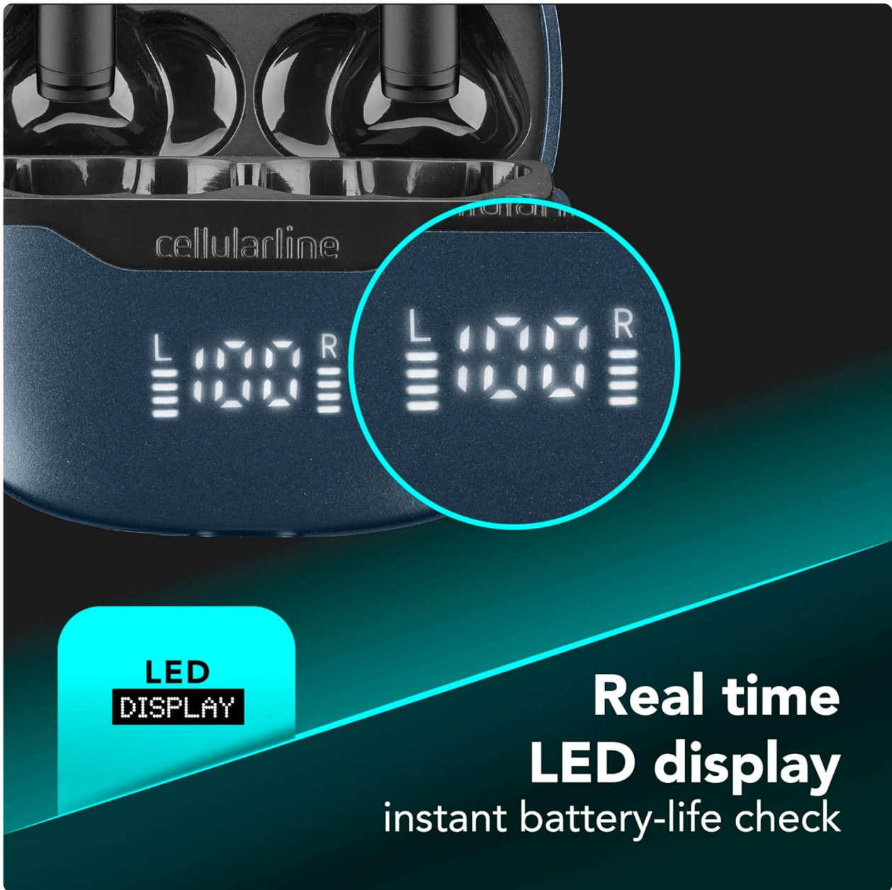
Image: A detailed view of the charging case's LED display, showing the battery levels for the left (L) and right (R) earphones, providing an instant battery-life check.