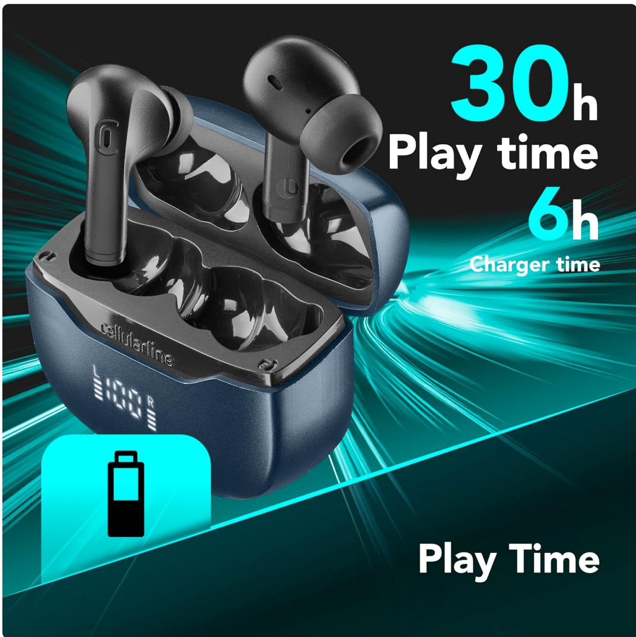
Image: The earphones and charging case. The image highlights a total playtime of 30 hours and a charger time of 6 hours, indicating battery life and charging duration.

A full charge provides approximately 30 hours of total playtime, with the charging case contributing to this extended battery life.