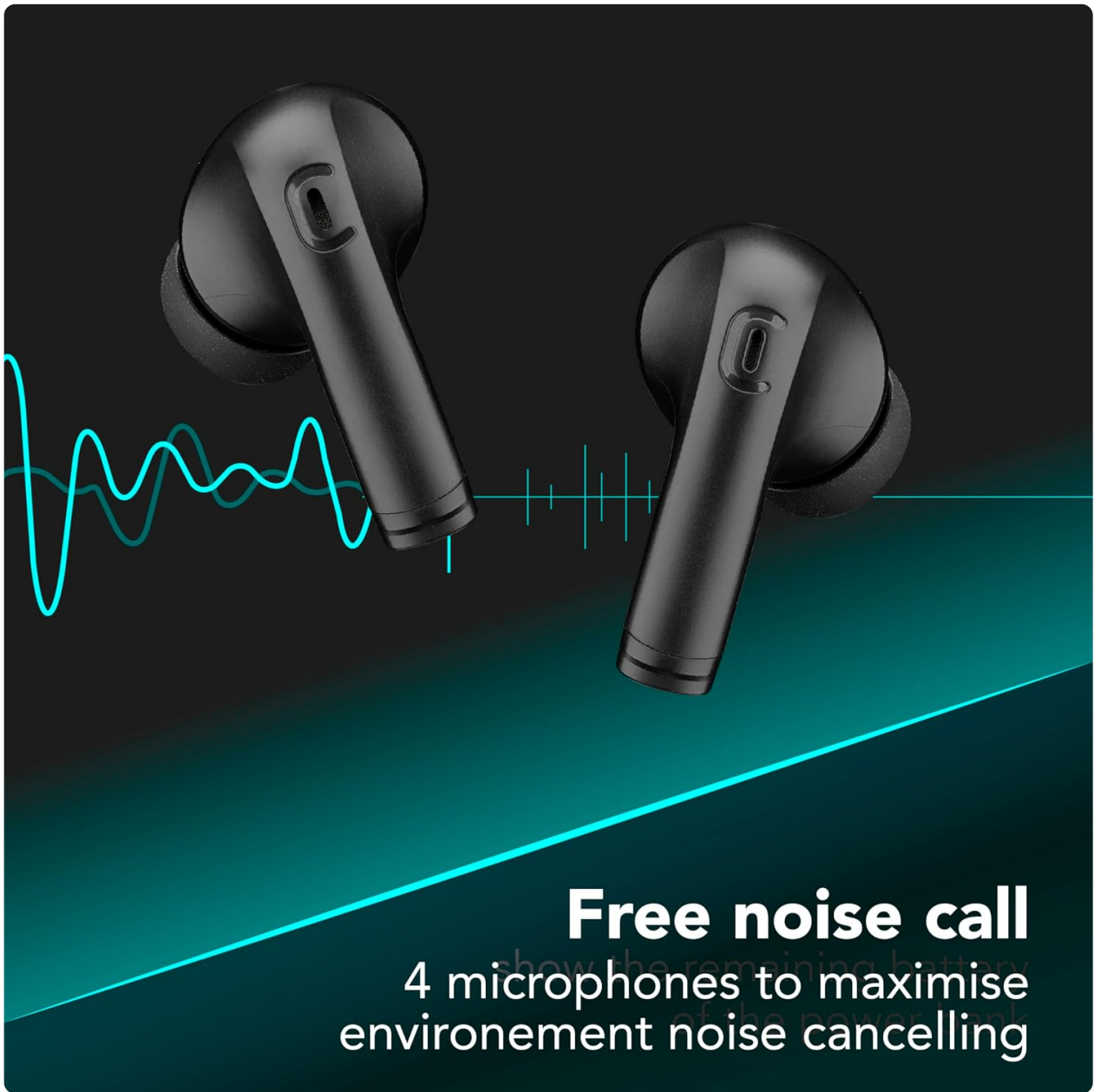
Image: Two earphones are depicted with sound wave patterns, symbolizing the active noise cancellation feature during calls, enabled by the four integrated microphones.