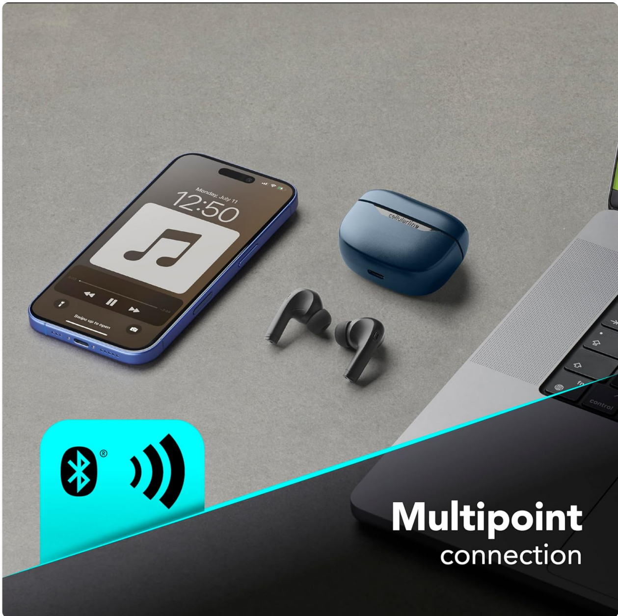
Image: The cellularline KEY PRO earphones are shown alongside a smartphone and a laptop, demonstrating their ability to connect to multiple devices simultaneously via Multipoint Technology.