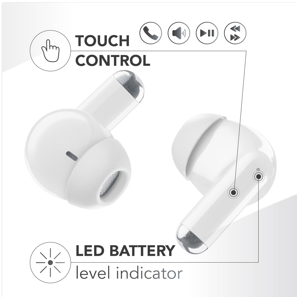
Figure 3.2: Earbud Touch Control Areas and Case LED Indicators.