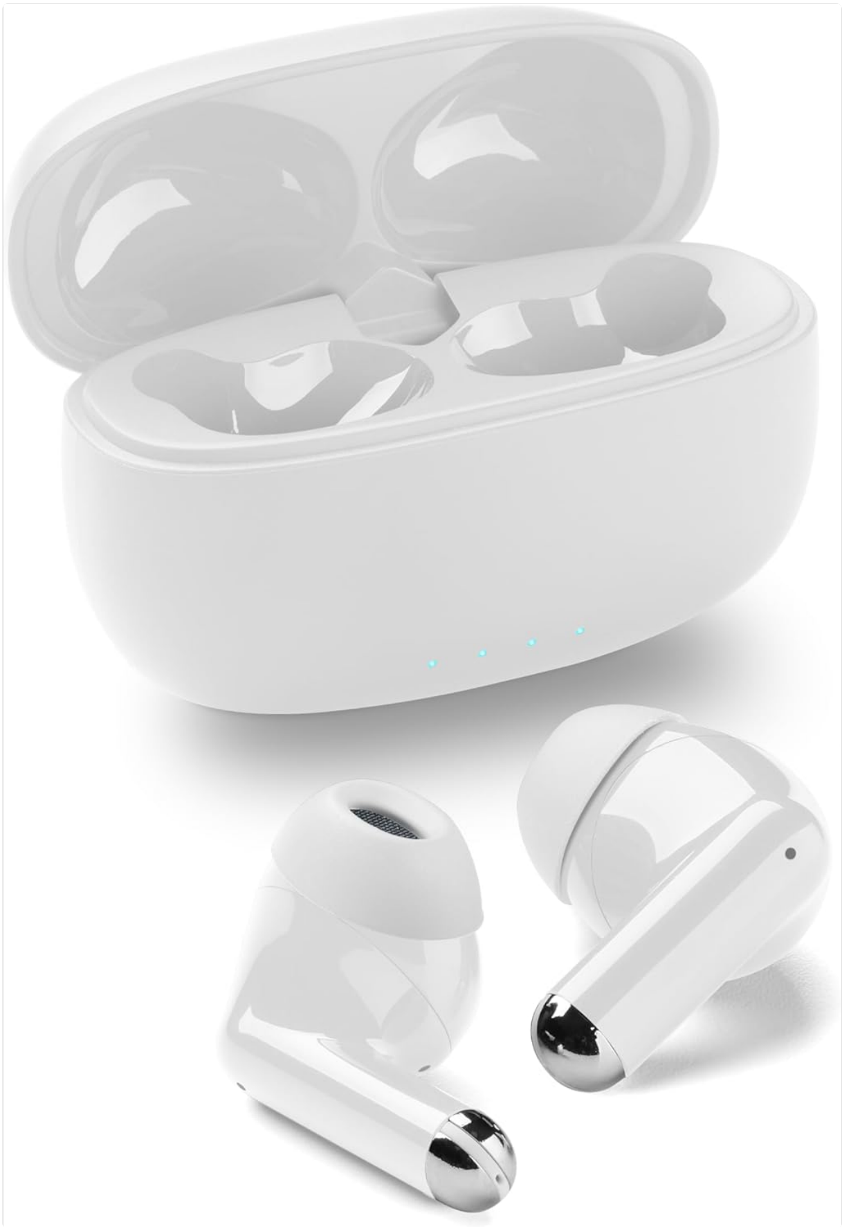
Figure 3.1: Music Sound Drift Earbuds and Charging Case.