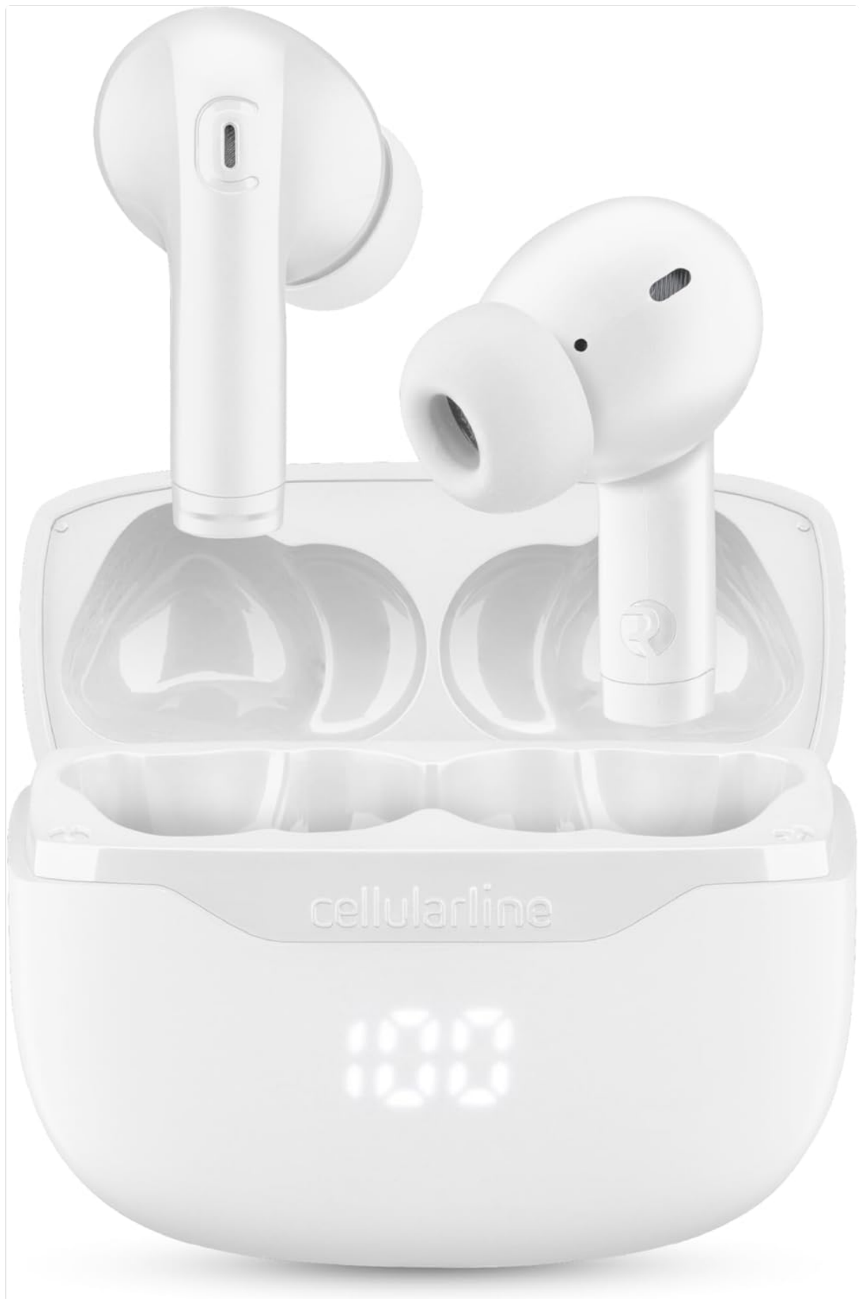
Figure 3.1: The cellularline Key In-Ear True Wireless Earbuds resting in their charging case.