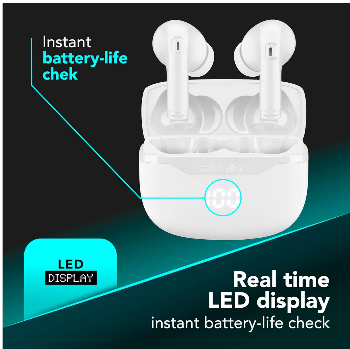
Figure 3.2: The charging case features an LED display that indicates the current battery level.