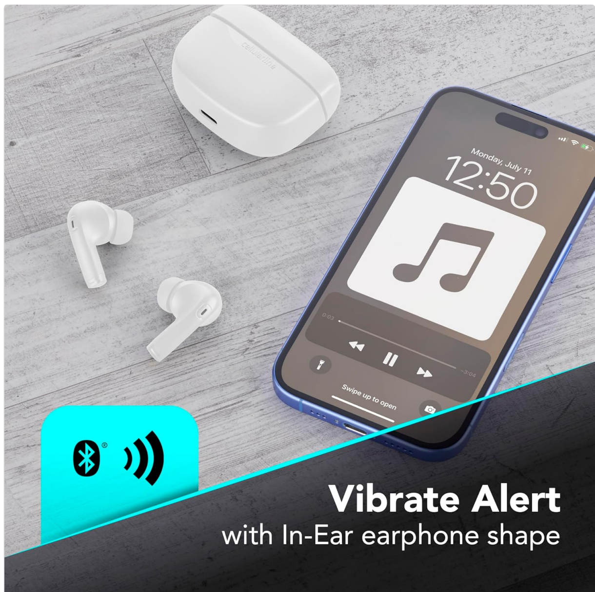
Figure 5.1: The earbuds are designed for seamless wireless connection with your smartphone for music and calls.

After initial pairing, the earbuds will automatically connect to the last paired device when removed from the charging case, provided Bluetooth is enabled on the device.