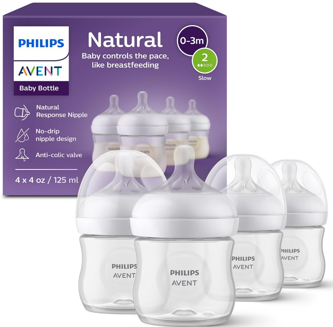
Image: A 4-pack of Philips Avent Natural Baby Bottles, showing the bottles, nipples, screw rings, and caps, along with the product packaging.