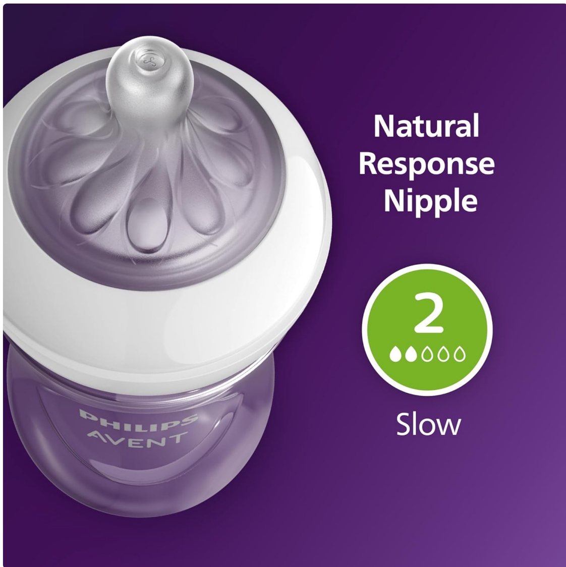
Image: A close-up of the Philips Avent Natural Response Nipple, indicating 'Flow 2 Slow' with five drops, two of which are filled.

Choosing the correct flow rate is important. While age is a general guide, observe your baby's feeding cues: