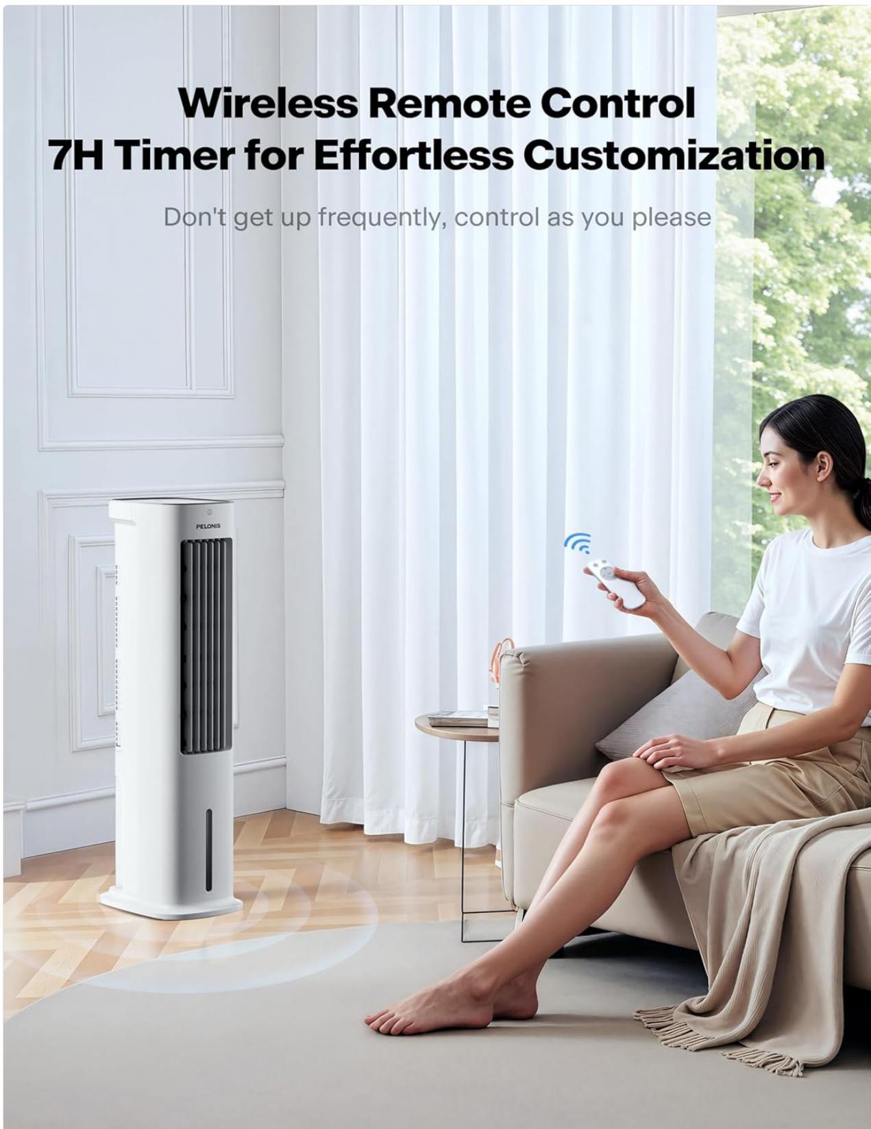
Figure 4.1: The intuitive control panel located on the top of the air cooler, alongside the remote control for convenient operation from a distance.

Don't get up frequently, control as you please