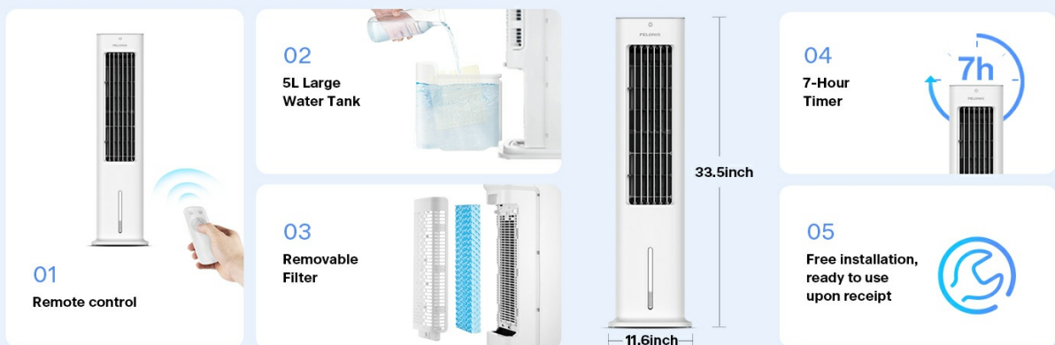
Figure 2.2: Overview of key features and components including remote control, 5L water tank, removable filter, dimensions, and timer.

Your browser does not support the video tag.