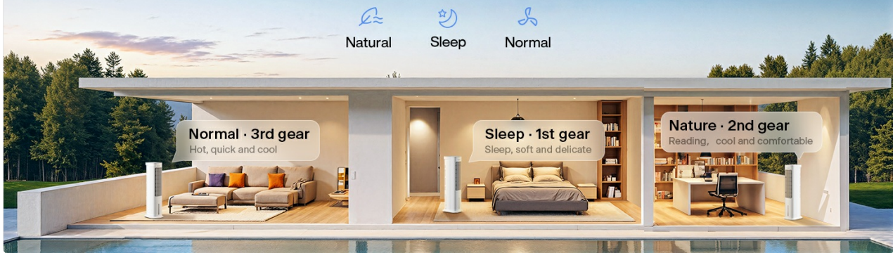
Figure 4.3: The air cooler offers three customizable wind modes (Normal, Natural, Sleep) to suit various preferences and scenarios, from powerful cooling to gentle airflow for rest.

Different life scenarios can be satisfied.