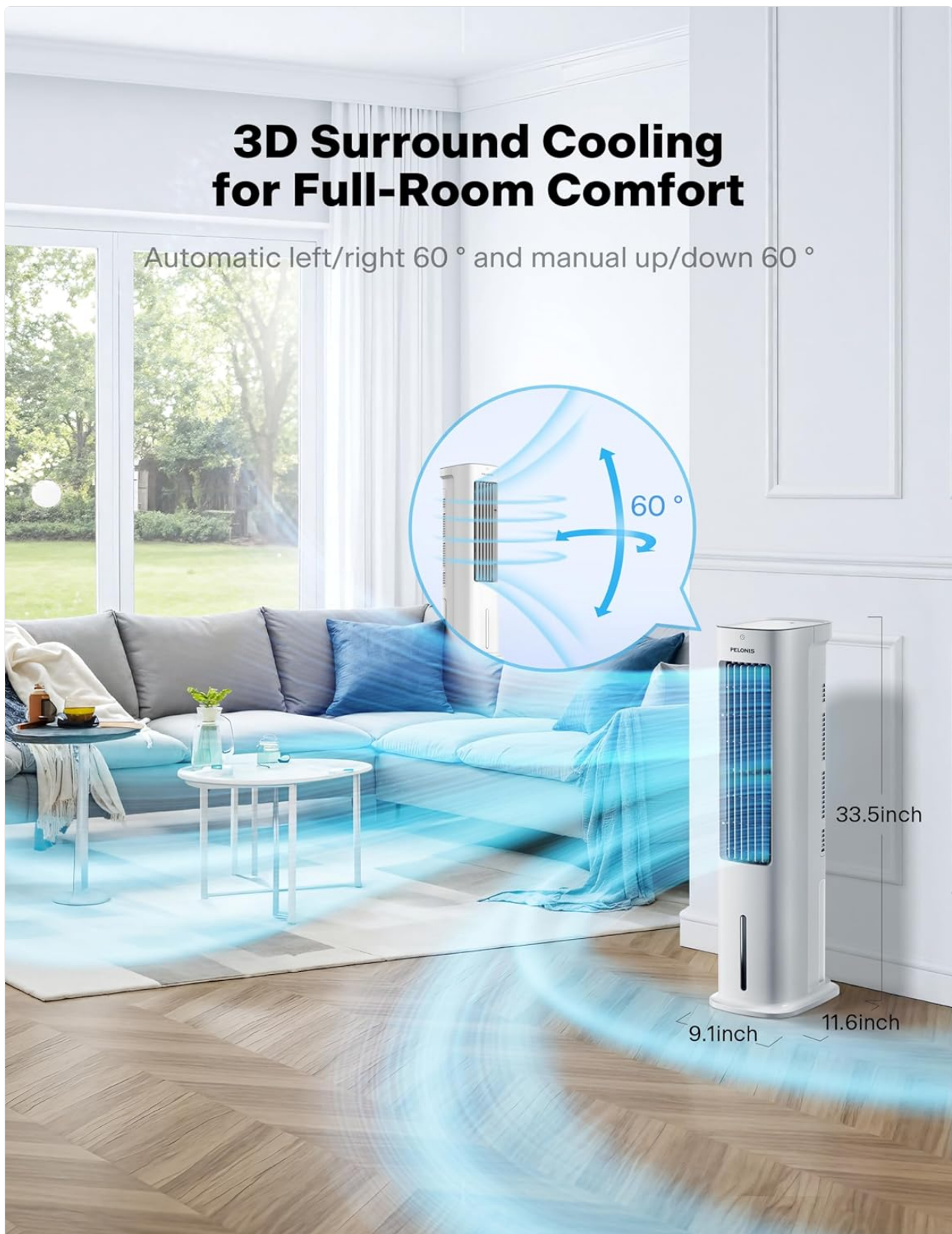
Figure 4.2: The air cooler provides 3D surround cooling with automatic 60-degree left/right oscillation and manual up/down adjustment for comprehensive air distribution.