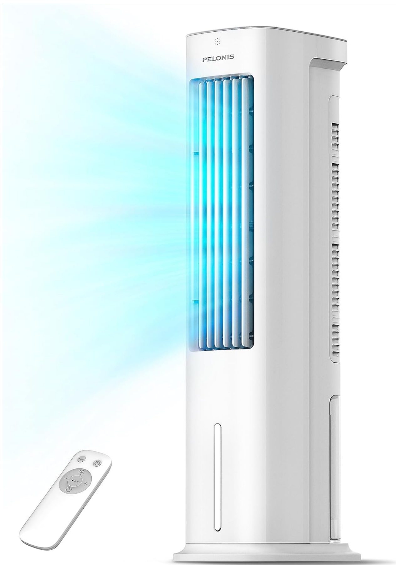
Figure 2.1: The PELONIS 3-in-1 Air Cooler and its remote control.