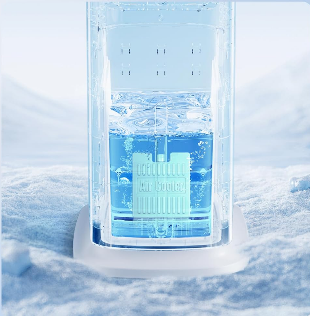
Figure 3.1: The 5-liter water tank, showing the water level indicator and space for ice packs. The tank is designed for easy filling and maintenance.

Your browser does not support the video tag.