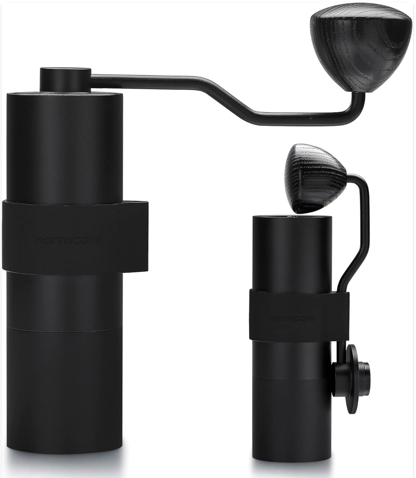
The Normcore Manual Coffee Grinder V2, showcasing its sleek black design and handle.