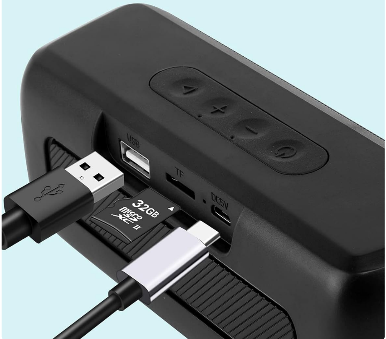
Figure 3: Side panel revealing USB, TF card, and DC5V charging ports.