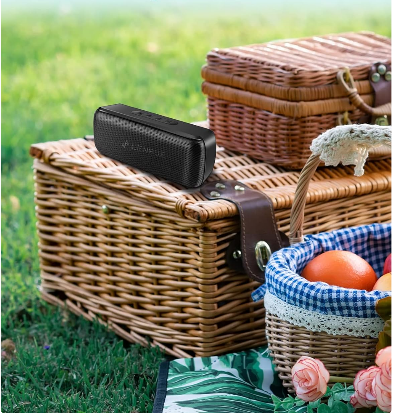
Figure 2: Top panel with silicone control buttons for easy operation.