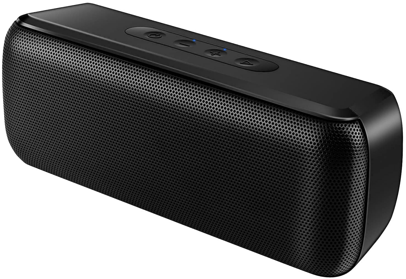
Figure 1: LENRUE A52 Bluetooth Speaker, Matte Black.