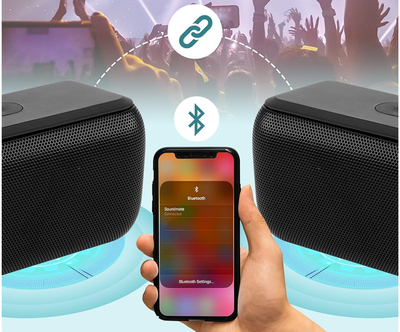
Figure 4: TWS connection setup for enhanced stereo sound.

Connect 2 speaker for 20W double-louder stereo sound