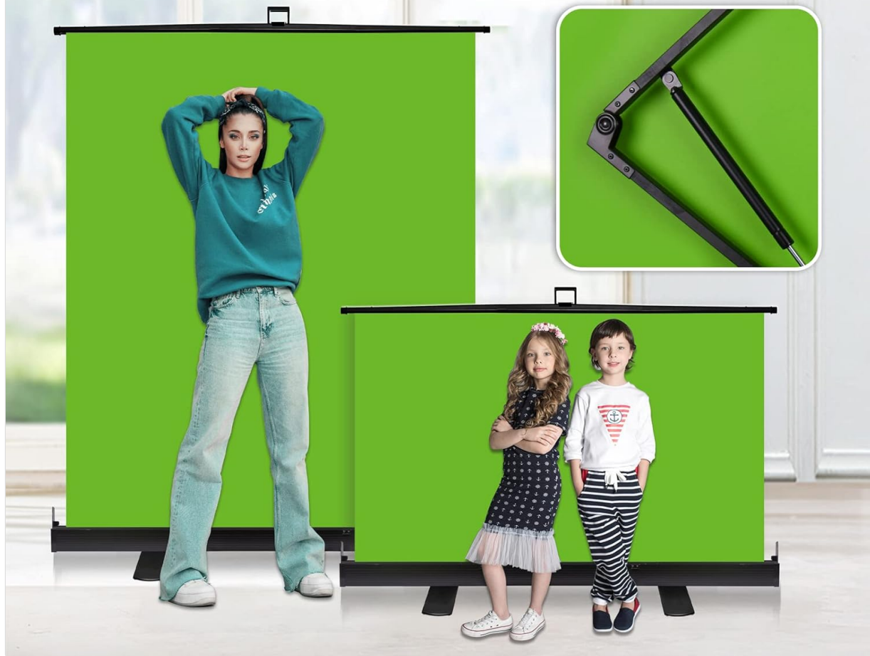
Figure 2: The sturdy, rust-proof aluminum X-frame provides stable support for the backdrop, ensuring it remains upright and secure during use.

Pull up the green screen and Pneumatic X-frame can lock the height to the place you want.