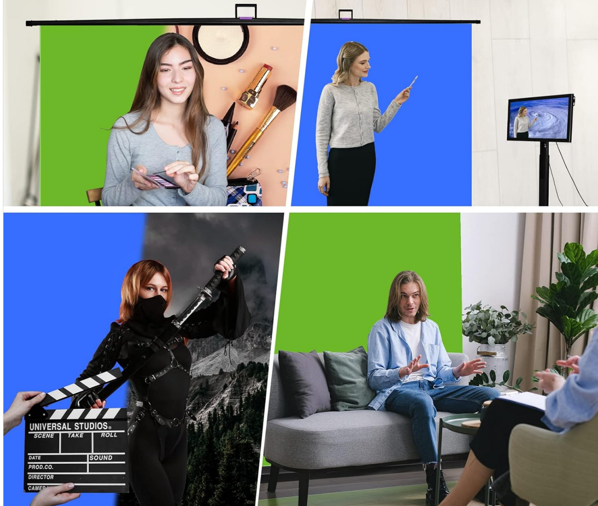
Figure 4: Examples of the backdrop in use for various scenarios, highlighting its versatility for both green and blue screen applications.

Two sides, you can choose any background color suitable for your shooting.