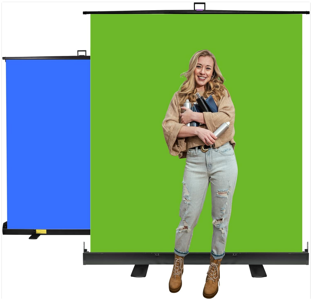
Figure 3: The EMART backdrop features both green and blue chromakey surfaces, offering flexibility for various production needs.