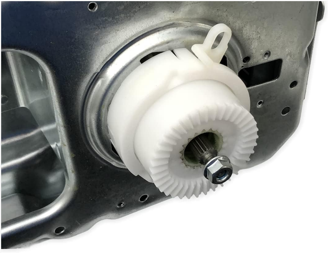
Figure 3: Close-up view of the white plastic gear and associated components on the gear case. This detail is important for ensuring proper engagement with other drive components.