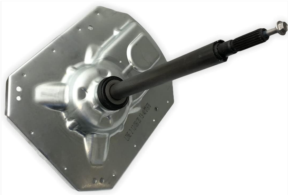
Figure 1: Front view of the WEIJIA W11255272 Washer Transmission Gear Case. This image displays the main body of the gear case with the

The WEIJIA W11255272 is a replacement washer transmission gear case assembly designed for various Whirlpool washing machine models. This component is crucial for the proper functioning of your washing machine's agitation and spin cycles. It replaces several part numbers, including W11454741, W10473144, W10870910, W11035749, W10771759, W10771758, W10473143, W10006378, W10006402, W10903969.