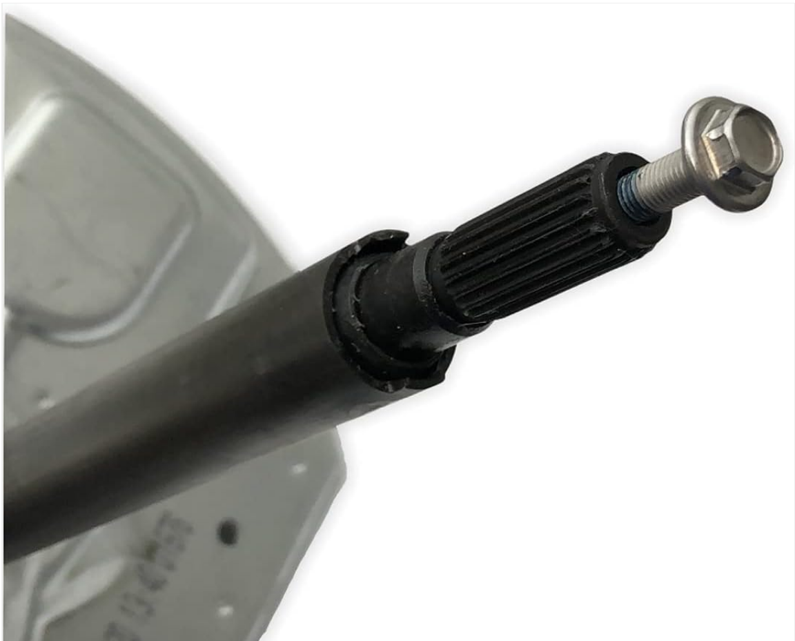
Figure 4: Detailed view of the drive shaft, showing the splines and retaining bolt. Proper condition and engagement of this shaft are critical for washer function.