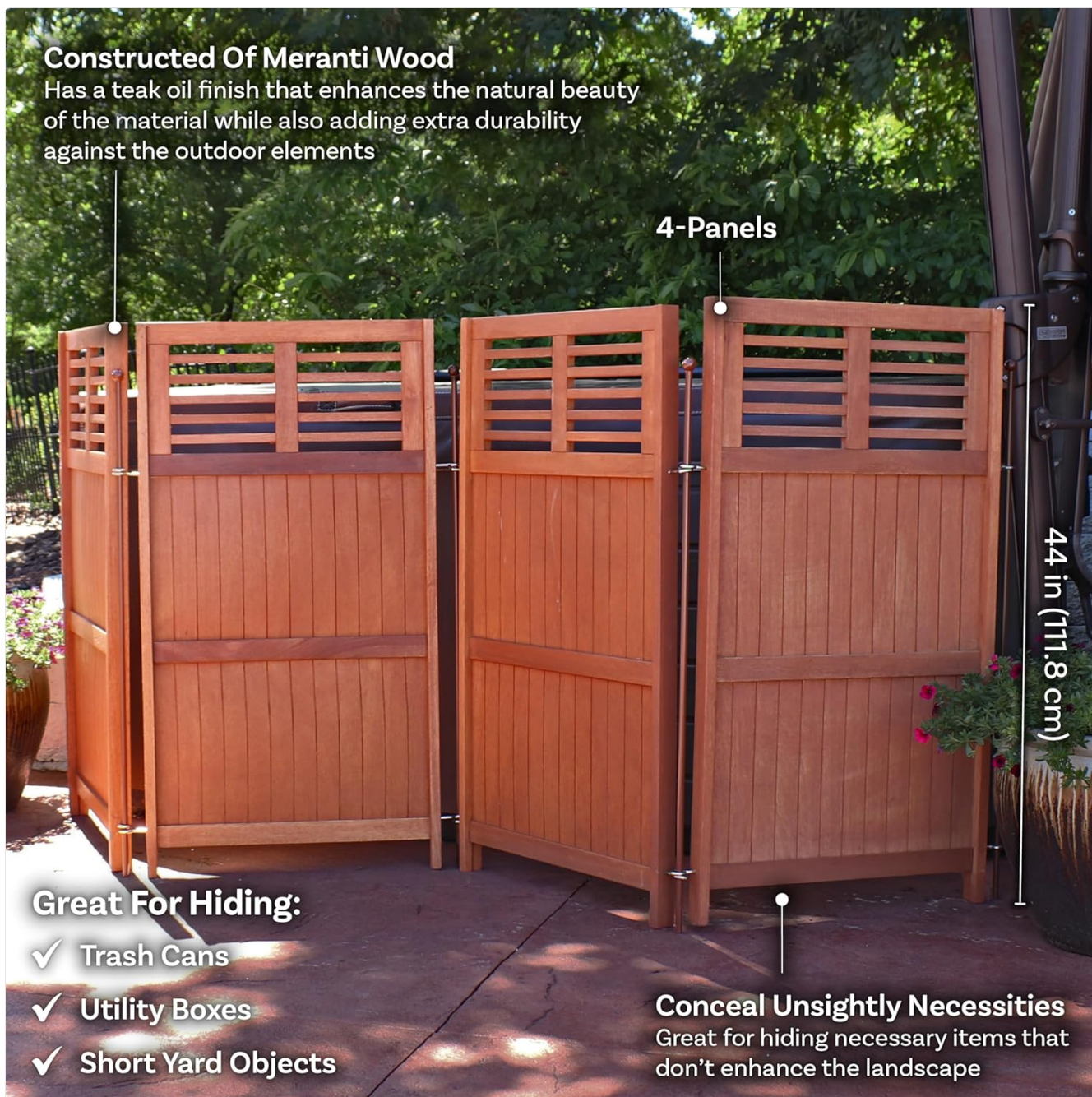
Image: The Sunnydaze 44-inch folding outdoor wood privacy screen, illustrating its four panels, 44-inch height, meranti wood construction, and its utility for concealing items like trash cans and utility boxes.