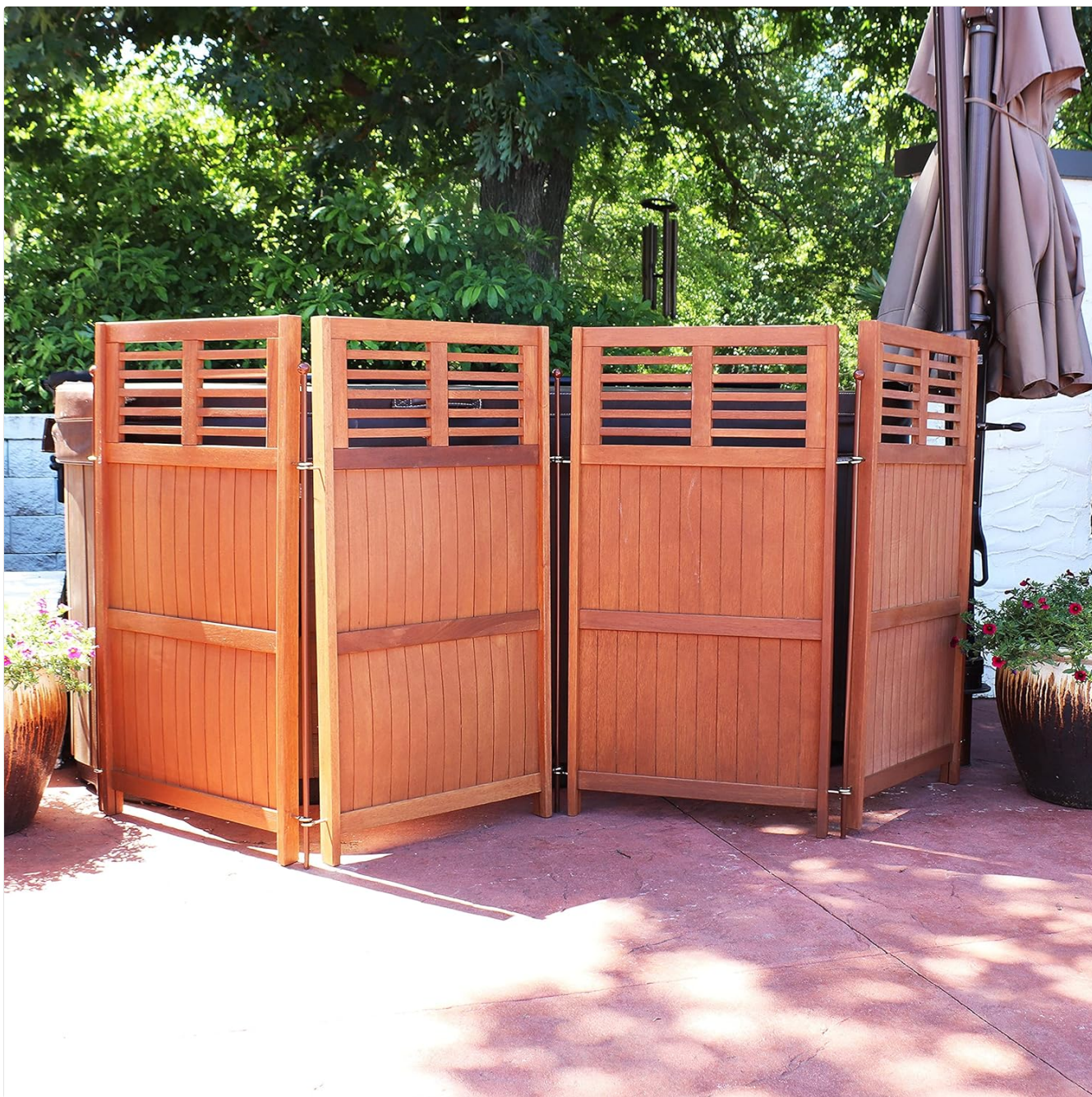
Image: The privacy screen positioned on an outdoor patio, demonstrating its use in a real-world setting to provide privacy or define a space.