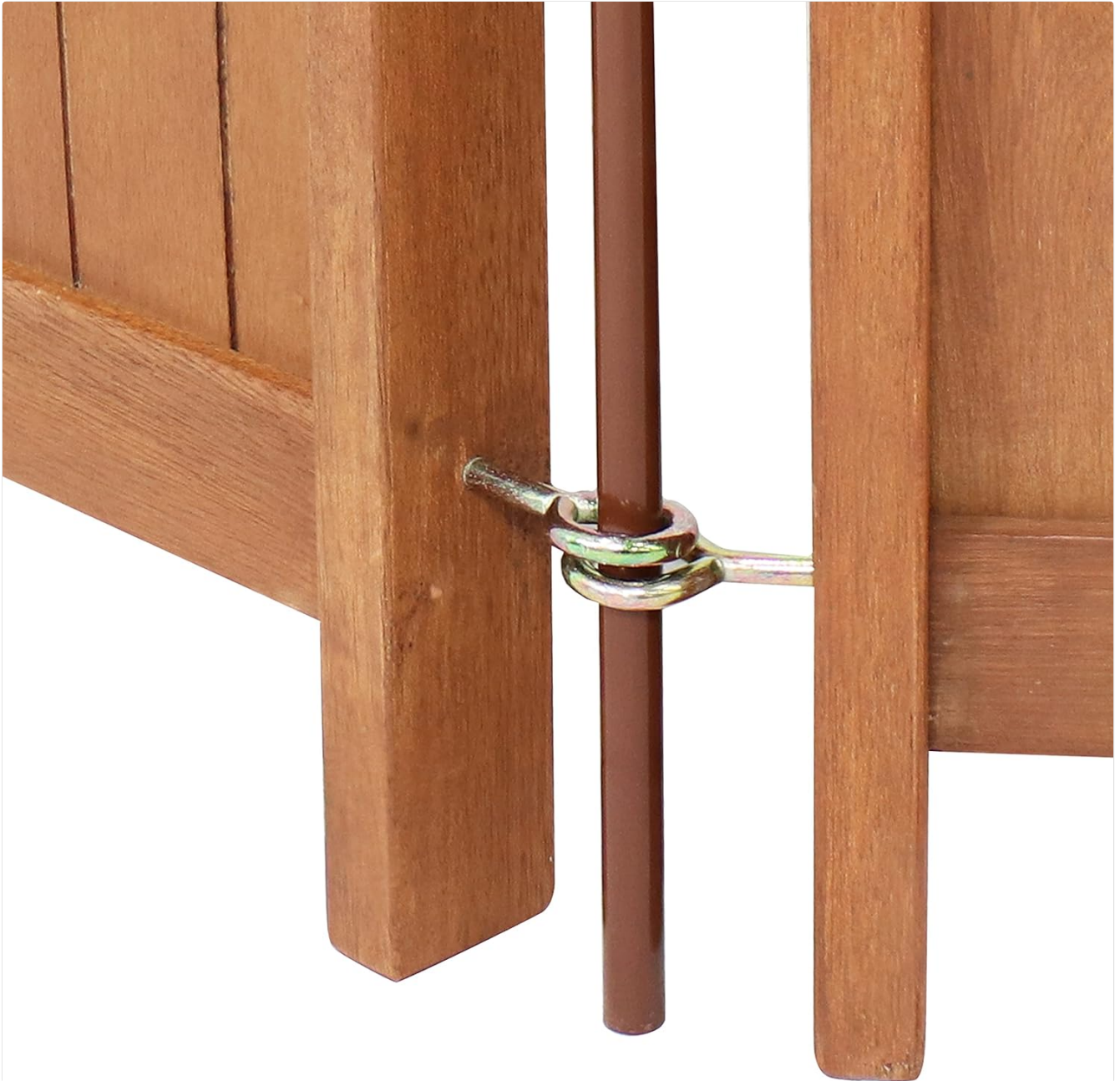
Image: A close-up view of the metal hooks and connecting pole used to join two panels of the privacy screen, demonstrating the assembly mechanism.

optimal stability, especially in windy conditions, configure the screen with slight curves or angles.