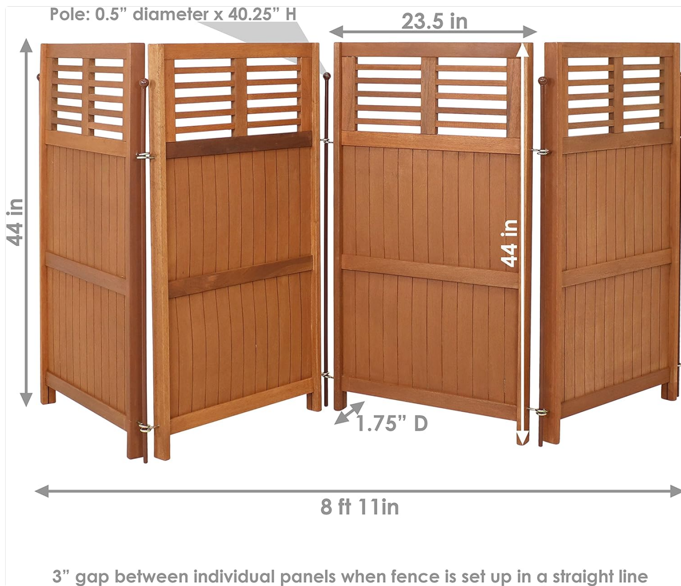
Image: A diagram illustrating the detailed dimensions of the privacy screen, including overall width, height, and individual panel measurements.