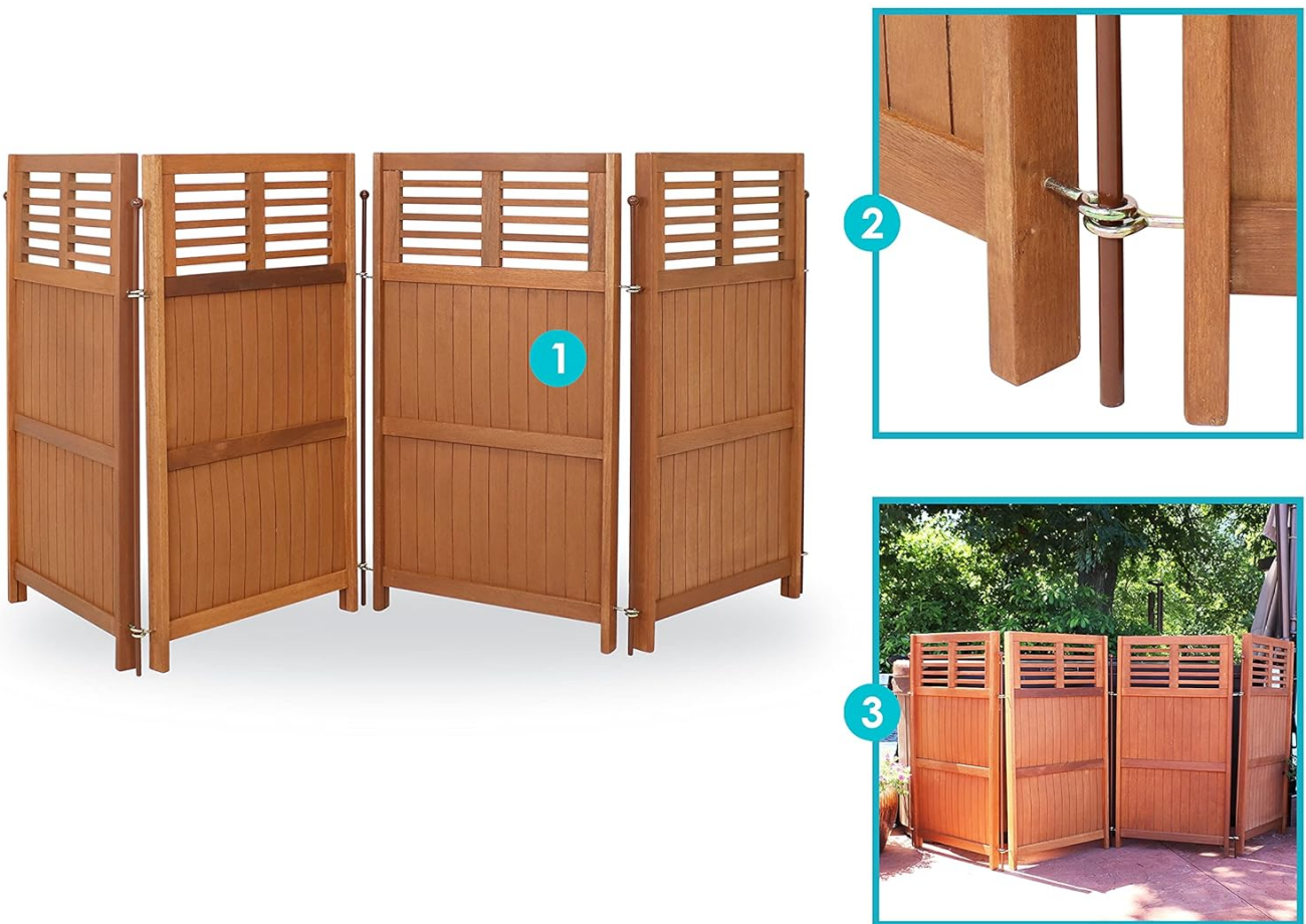
Image: An illustration showing the components and basic assembly steps for the privacy screen, highlighting the connection points between panels.