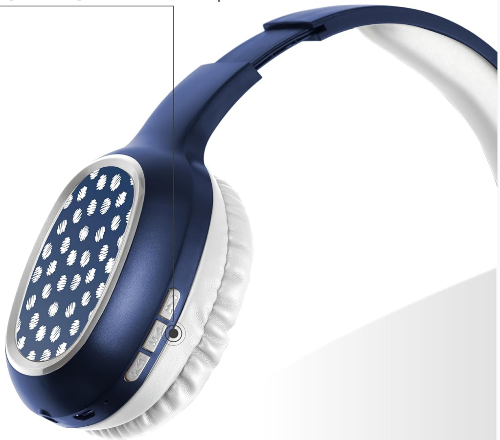
Image: Close-up view of the earcup showing the integrated control buttons for managing music and calls.