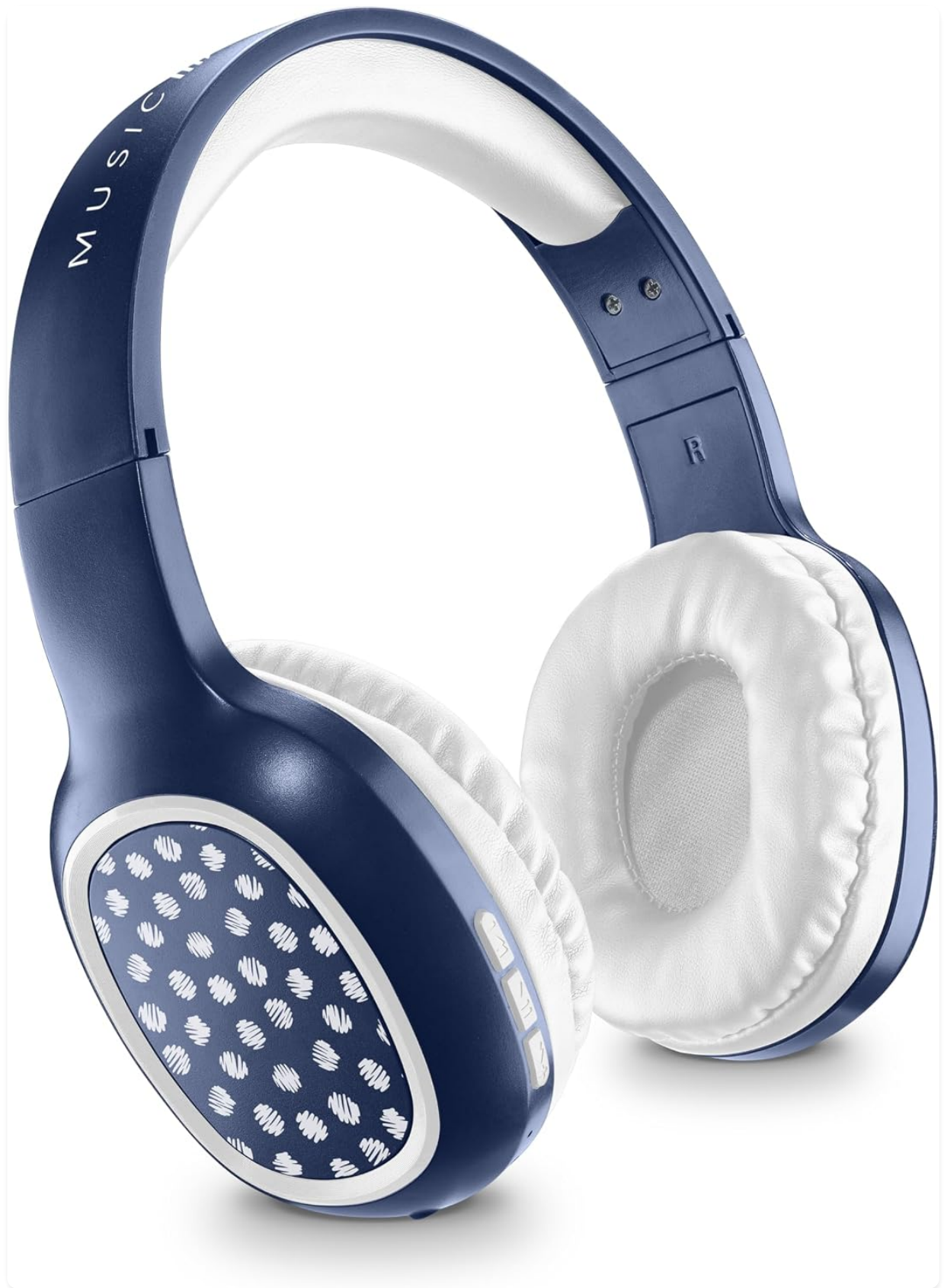
Image: Front view of the Music Sound SHINY Wireless Over-Ear Headphones in blue.