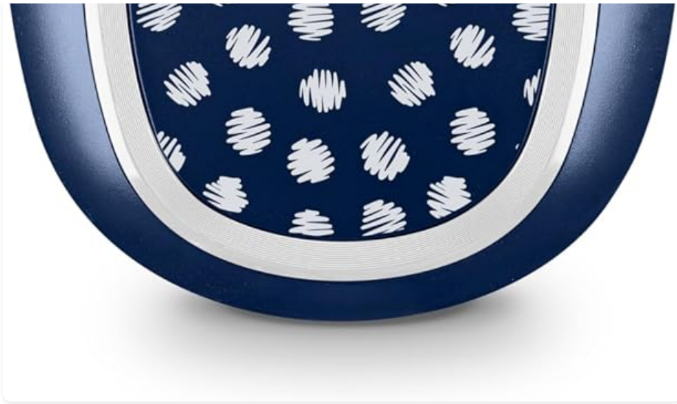
Image: Side view of the Music Sound SHINY Wireless Over-Ear Headphones, highlighting the earcups and headband. The headphones feature an adjustable headband and padded earcups for comfort. All primary controls are located directly on the earcup for easy access.