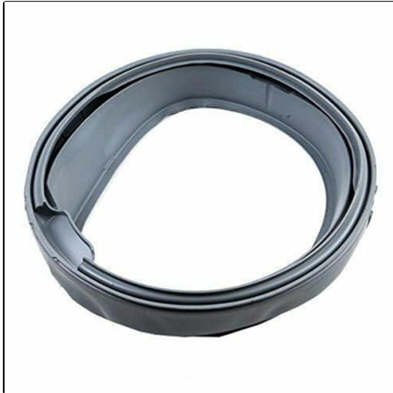
Figure 2: The Mintu Door Gasket Boot Seal Replacement. This image shows the circular rubber seal designed to fit around the washing machine door opening.

Orient the new Mintu gasket correctly. There is usually a small arrow or mark on the gasket that indicates the top. Carefully fit the inner lip of the new gasket onto the outer tub, ensuring it is seated properly all the way around.