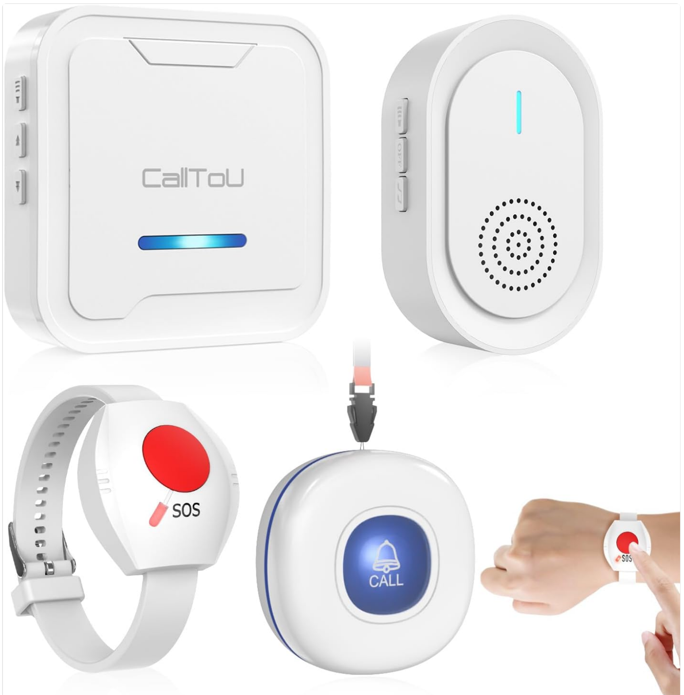
Figure 1: CallToU Wireless Caregiver Pager System components.