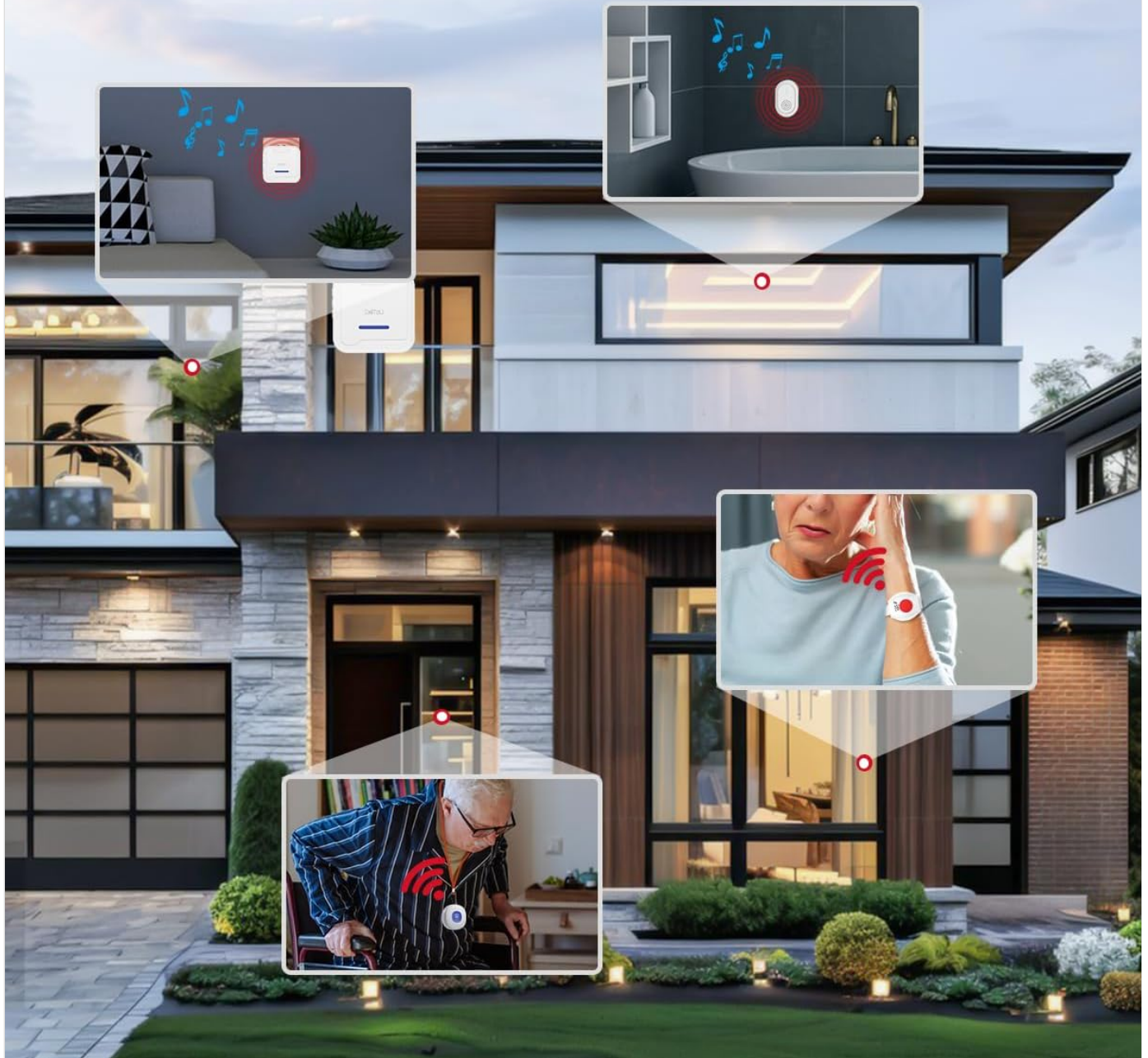
Figure 6: Wireless range of the CallToU Caregiver Pager System.

The signal of call buttons carries across 500FT easily. Never miss a call