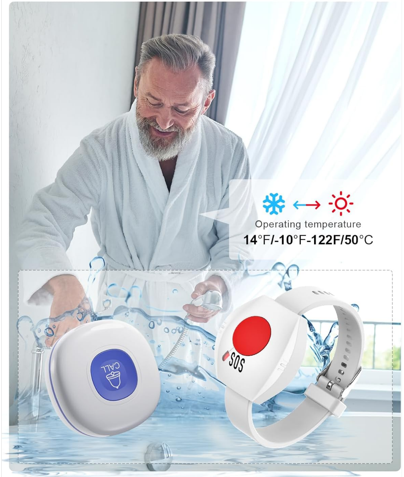
Figure 7: IP55 Waterproof rating of the Call Buttons.