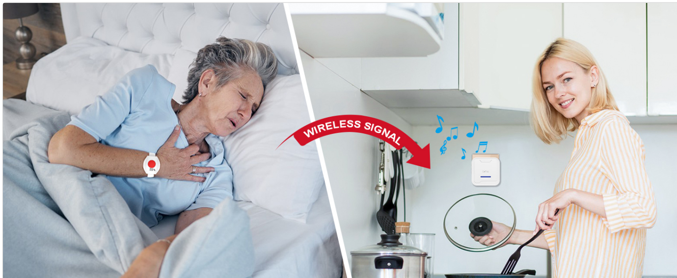
Figure 2: Plug-in Receiver with ringtone and volume controls.