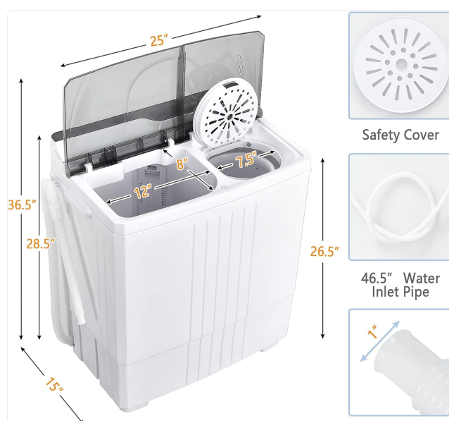
Figure 3.1: Product dimensions and hose connections.