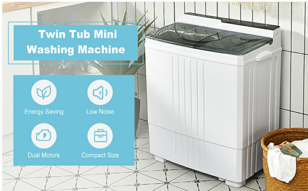
Figure 2.1: Detailed view of the washing machine features including filter, spin washing, water inlets, and safety lid.