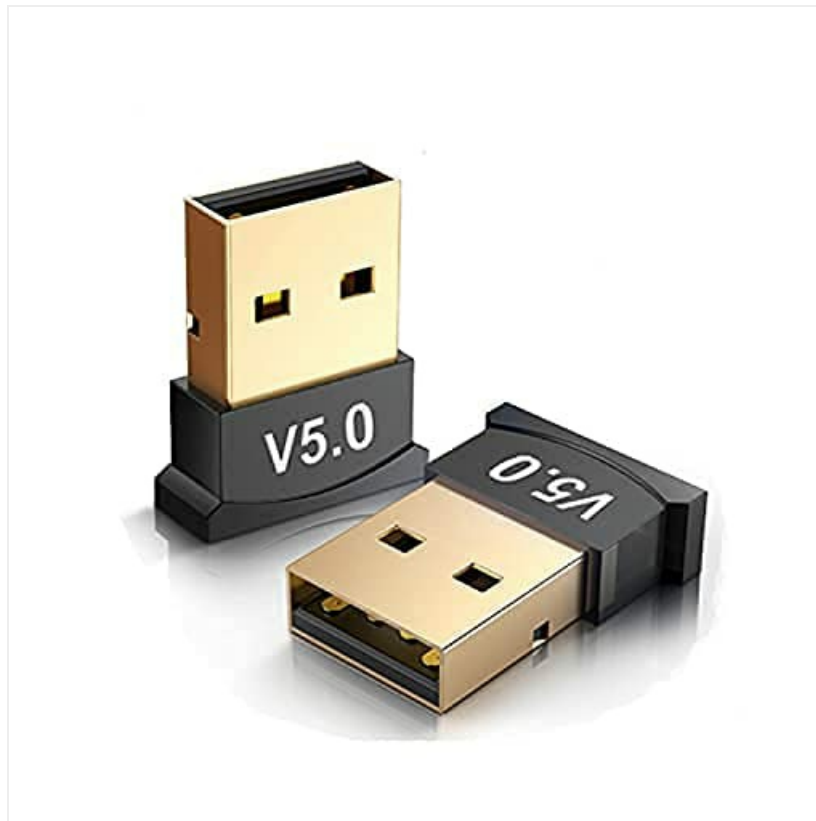
Figure 5.1: Two adapters shown, highlighting their compact size and USB connector. This illustrates the small footprint of the device when plugged in.