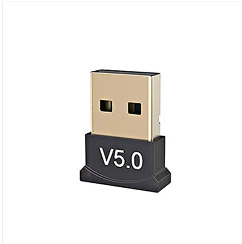
Figure 2.1: The Yanmai USB Bluetooth 5.0 Adapter. This image shows the compact design of the adapter, featuring a black base with 'V5.0' marking and a gold-colored USB connector.