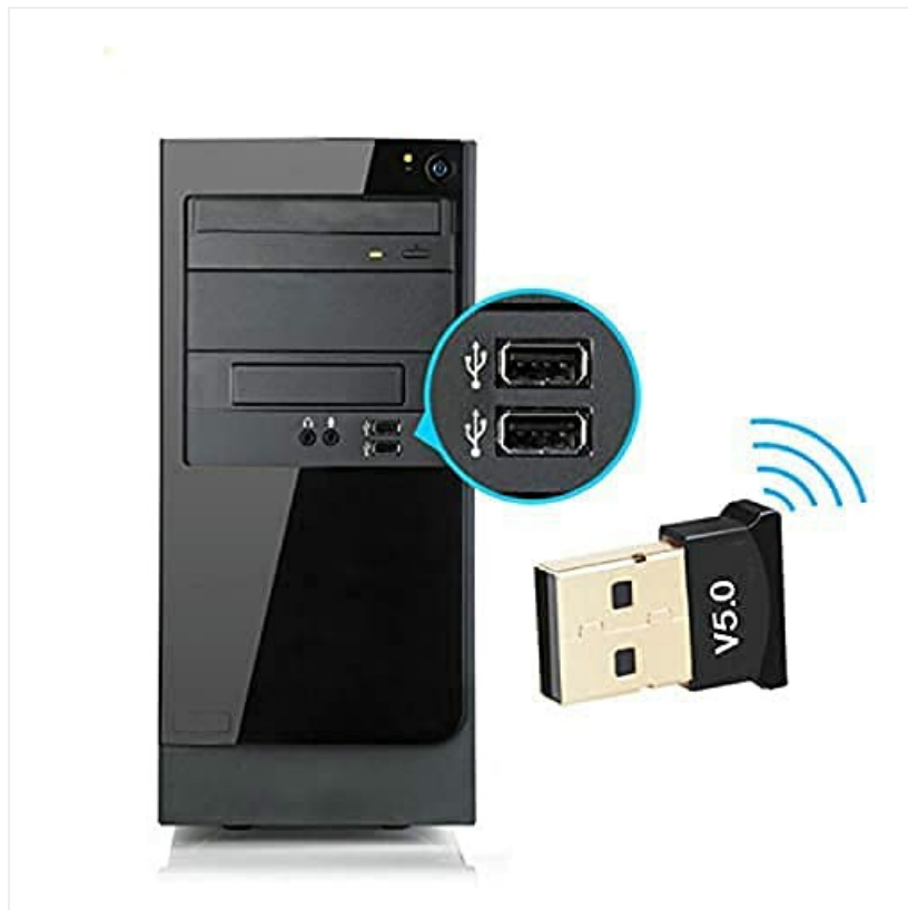
Figure 5.2: The adapter inserted into a USB port on the front of a desktop computer tower. A magnified inset shows the USB ports clearly.