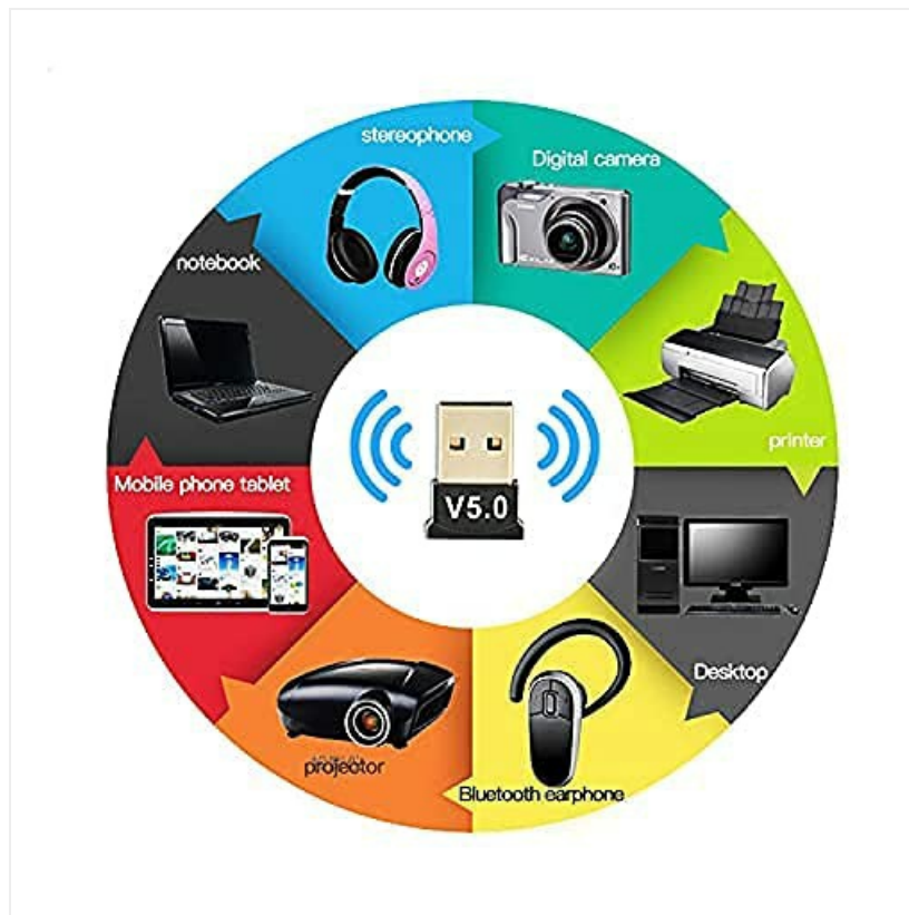
Figure 6.3: A circular diagram illustrating the wide range of devices compatible with the Bluetooth adapter, including laptops, mobile phones, projectors, Bluetooth earphones, desktops, printers, digital cameras, and stereophones.