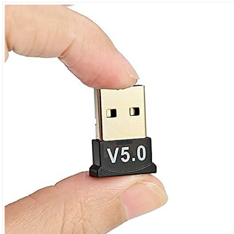
Figure 2.2: The adapter held between fingers, illustrating its small, unobtrusive size. The 'V5.0' branding is visible on the black casing.