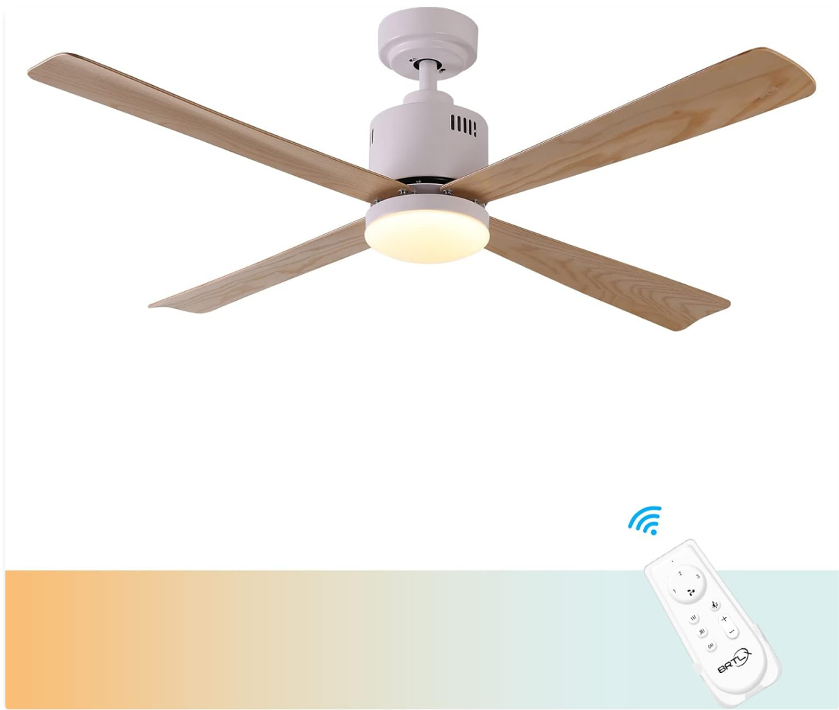
Figure 1: BRTLX 50" Modern Ceiling Fan with Lights.