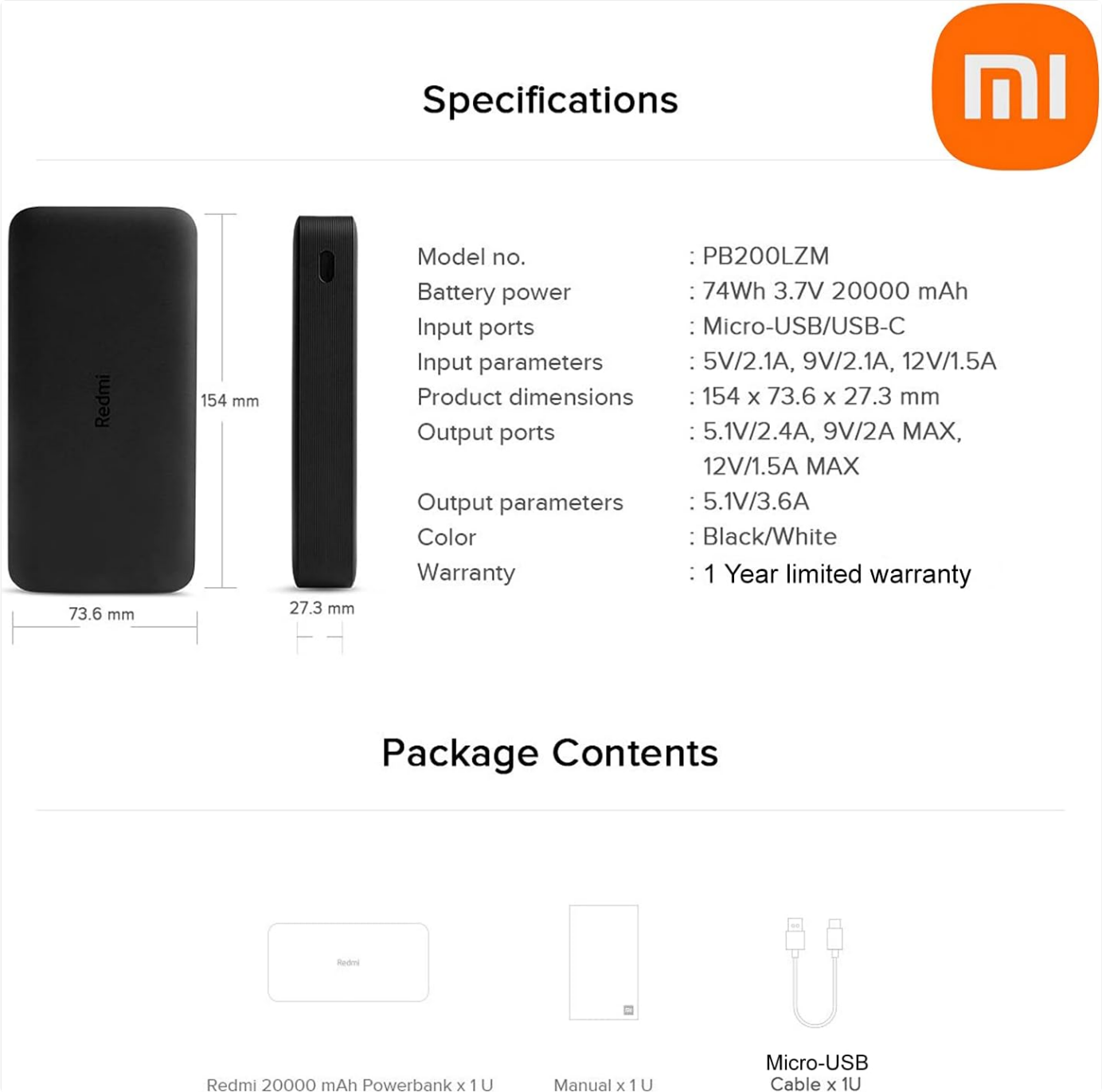
Image: Technical diagram detailing the dimensions and key specifications of the power bank.