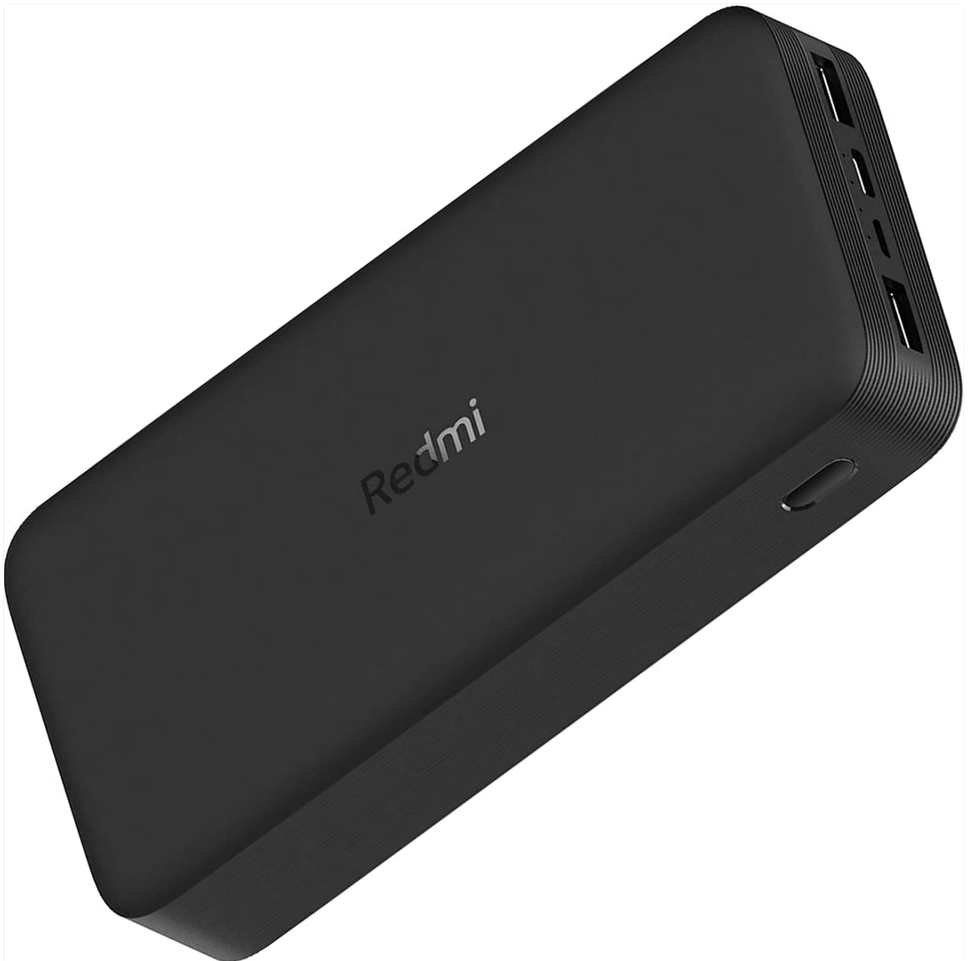
Image: Front view of the Xiaomi Redmi Power Bank.