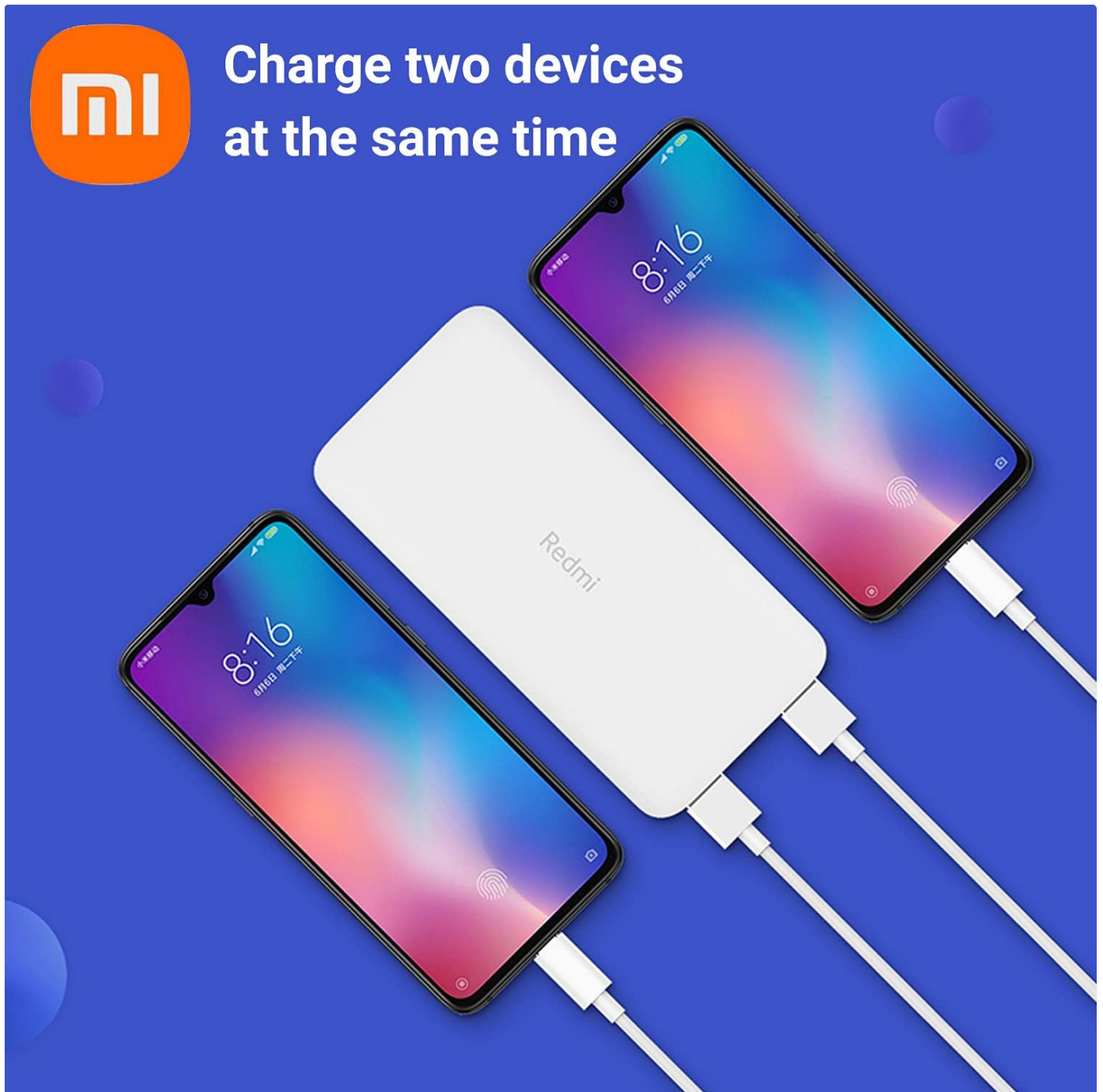
Image: The power bank simultaneously charging two smartphones, demonstrating its dual output capability.

The 20000mAh capacity is sufficient to fully charge an iPhone SE approximately 5.5 times, a Galaxy 5G approximately 3.5 times, and an iPhone 12 Pro approximately 3.8 times.