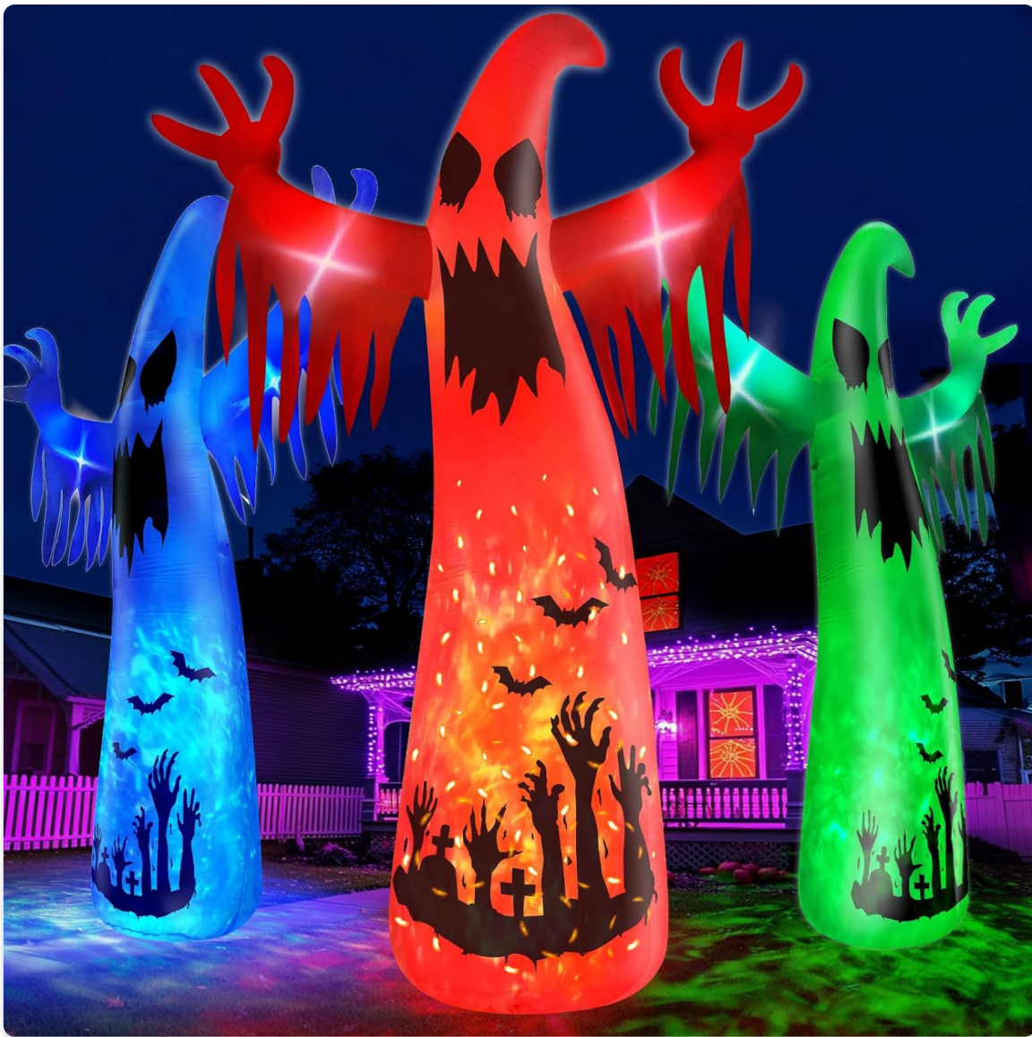
Image 1: The 12-foot inflatable ghost displaying its three color-changing rotating flame LED lights in an outdoor setting.