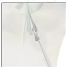
To Tie The String

Come With 7 Ground Stakes And 3 Ropes To Make It Stand More Stable