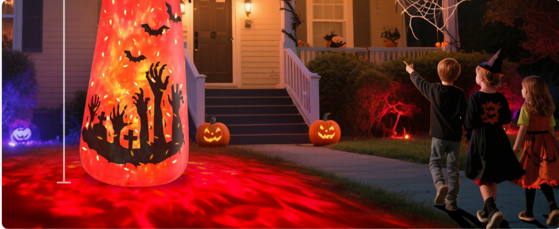
Image 4: Close-up of the inflatable ghost showcasing the 3-colored rotating flame LED effect.