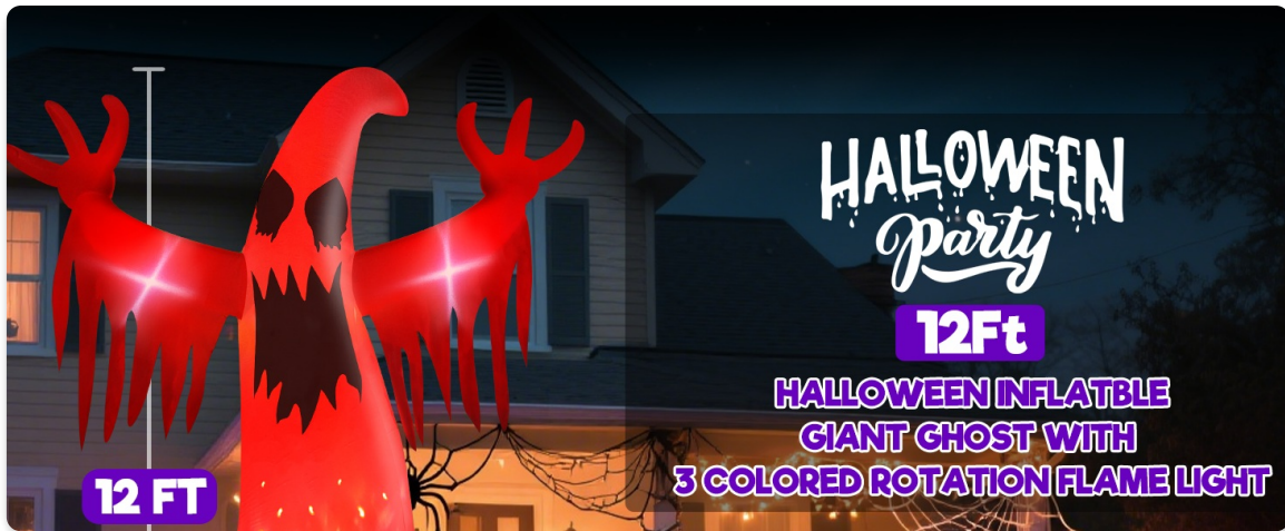
Image 5: The inflatable is made from waterproof fabric and features internal LEDs for illumination.