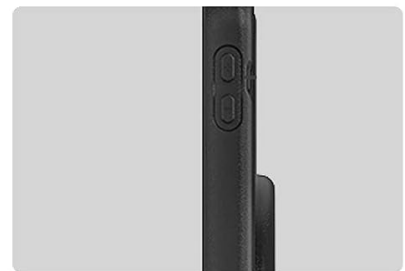
Ports and Buttons