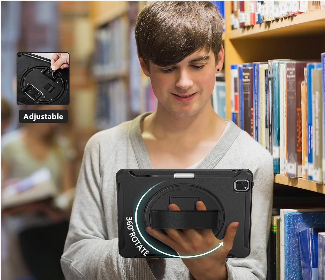
Figure 3: The adjustable hand strap offers a secure and comfortable grip for your iPad.