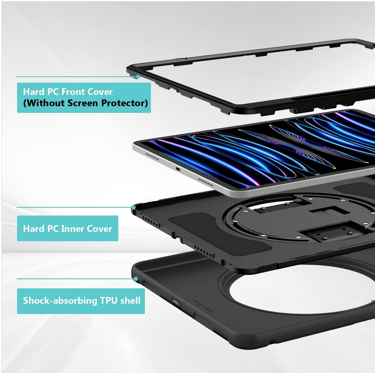
Figure 1: Exploded view illustrating the three protective layers of the ProCase Rugged Shockproof Case.

Your browser does not support the video tag.