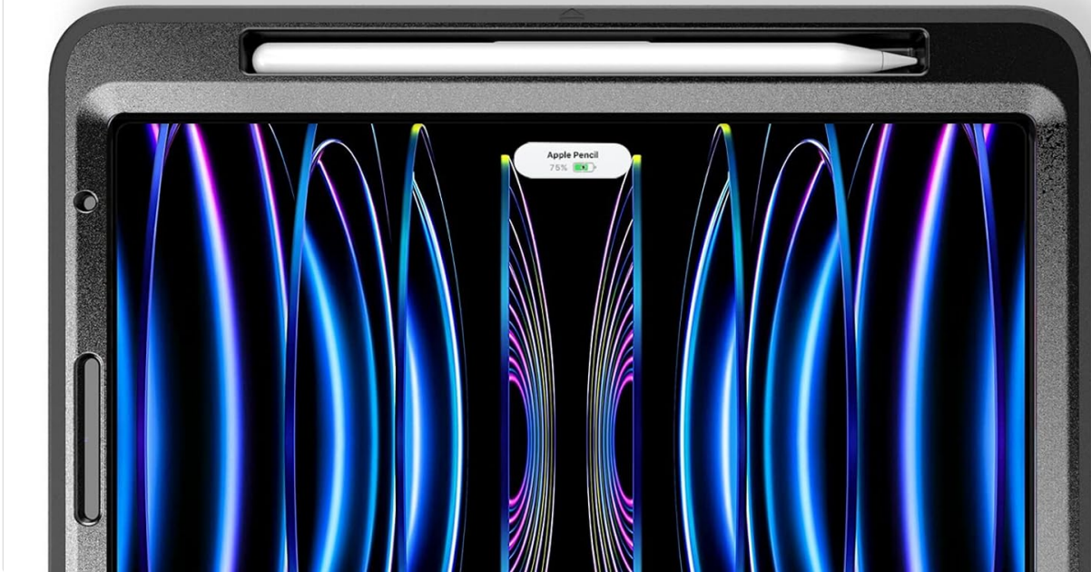
Figure 4: The integrated Apple Pencil holder keeps your stylus secure and accessible.