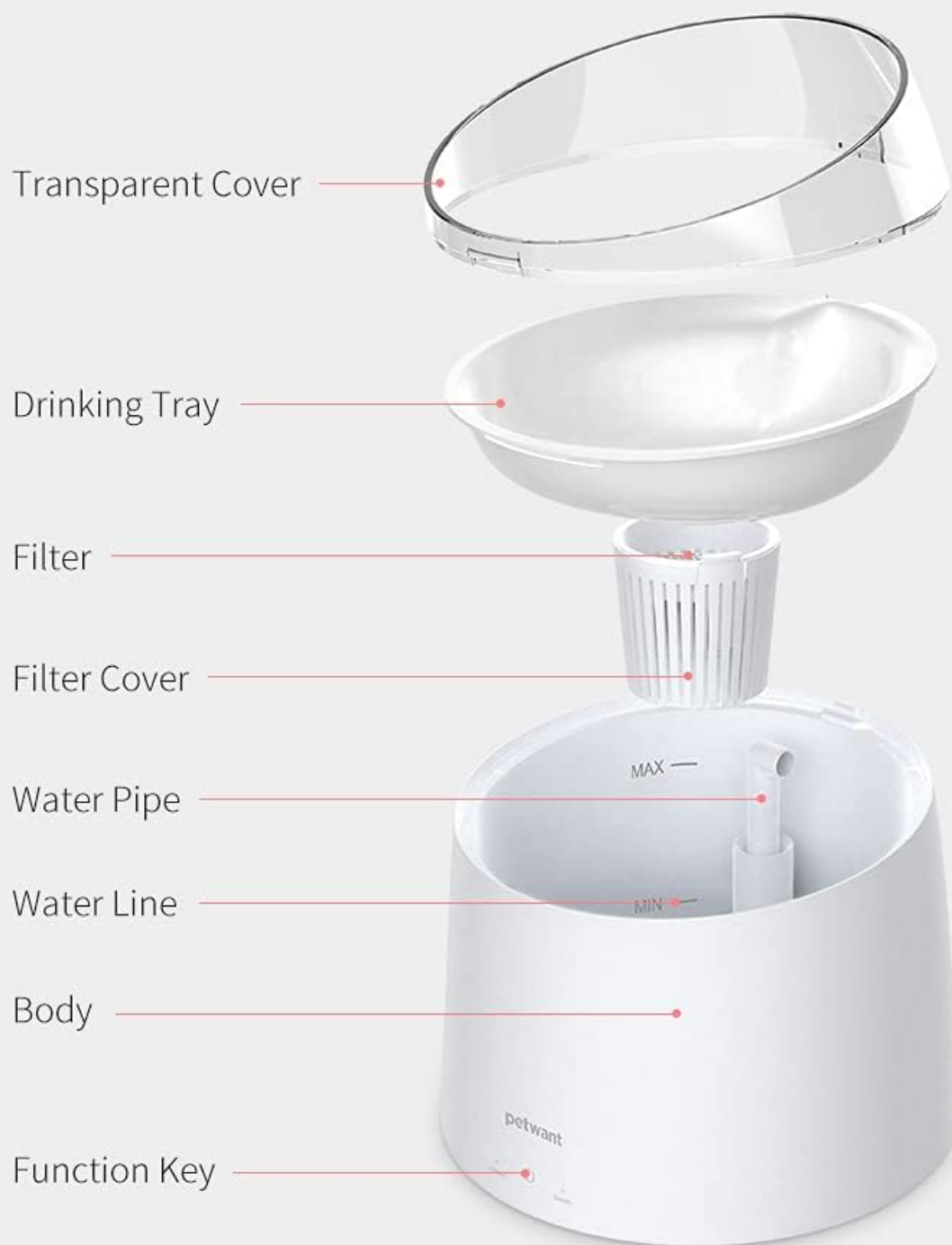
Image: Exploded view showing the Transparent Cover, Drinking Tray, Filter, Filter Cover, Water Pipe, Water Line (Min/Max), Body,