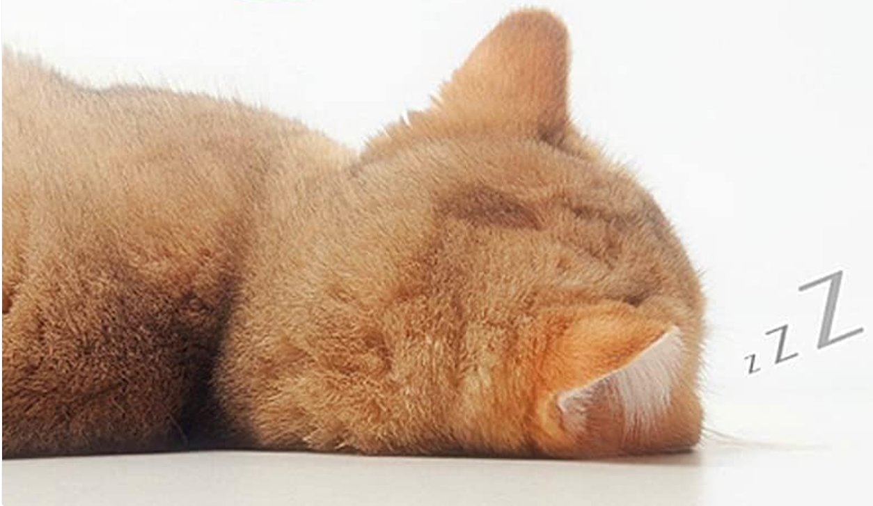
Image: A cat sleeping peacefully near the Petwant water fountain, demonstrating its low noise operation.