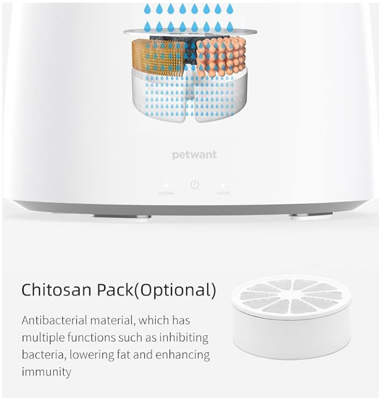
Image: Diagram illustrating the multi-layer filtration system, including activated carbon and ion-exchange resin, designed to purify water.