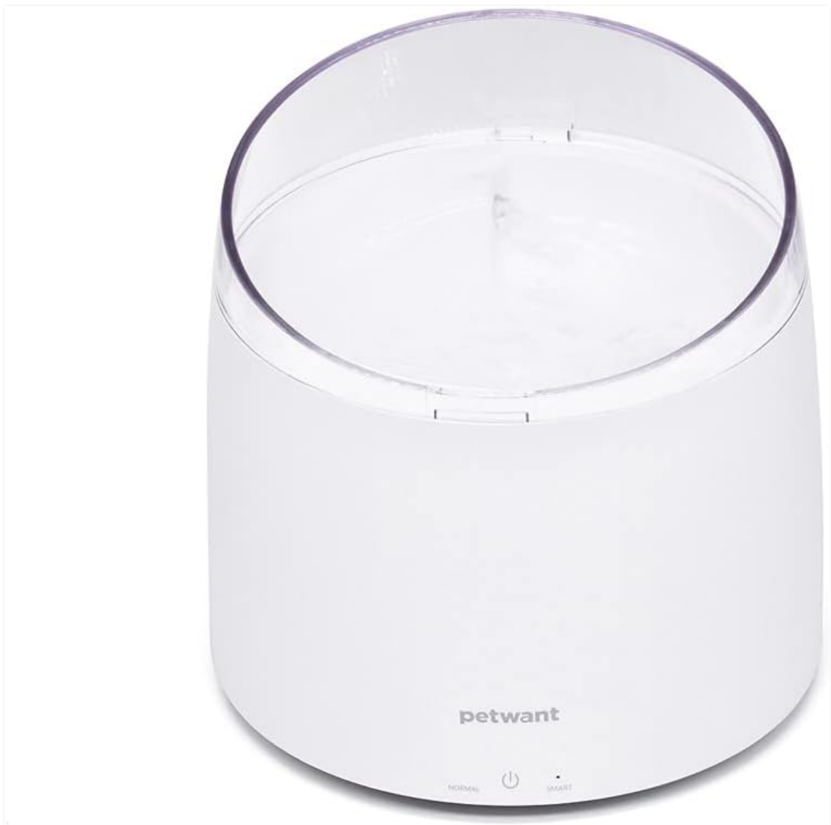
Image: Fully assembled Petwant Smart Pet Water Fountain, ready for use.