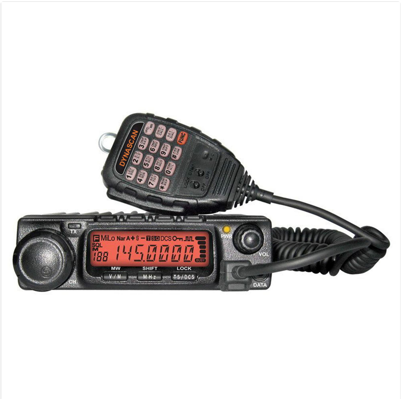
Image 4.1.1: Front view of the DynaScan M-6D-V radio unit with the microphone connected. Shows the display, control knobs, and function buttons.