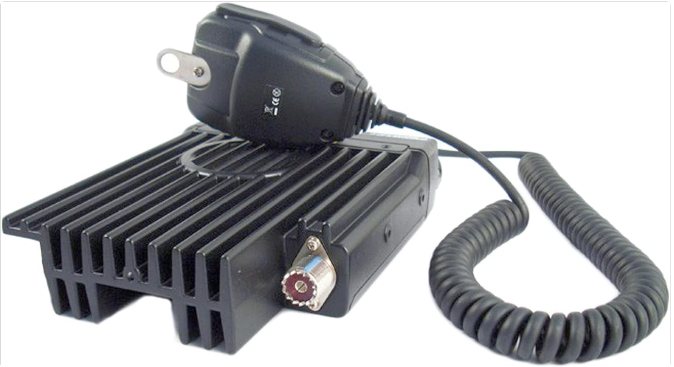
Image 4.1.2: Rear view of the DynaScan M-6D-V radio unit, highlighting the antenna connector and the extensive heat sink fins.