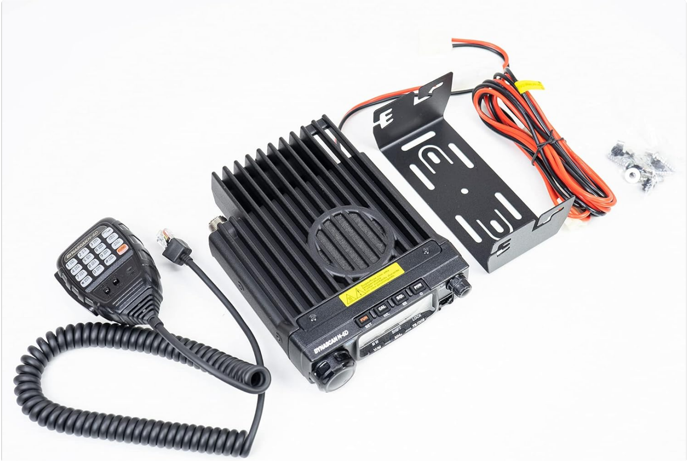
Image 3.1: Contents of the DynaScan M-6D-V package, including the radio unit, microphone, power cable, and mounting bracket.