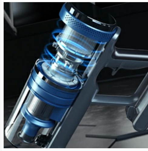
Image: An internal view of the vacuum's main unit, highlighting the brushless motor and multi-stage filtration system in blue and grey components.