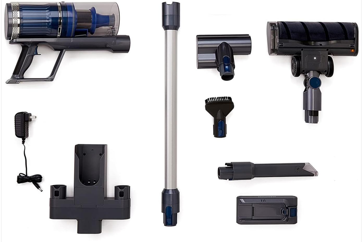
Image: All components included with the HAUSMEISTER P018E Cordless Vacuum Cleaner, laid out on a white background. This includes the main vacuum unit, extension wand, motorized brush head, crevice tool, dusting brush, wall mount, and power adapter.