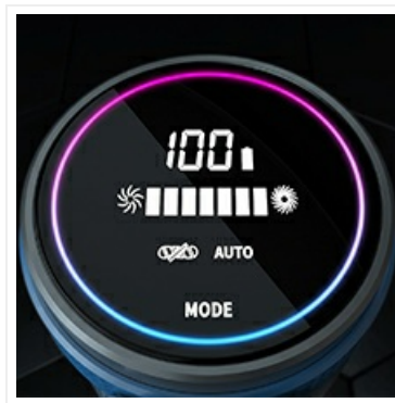
Image: A close-up of the vacuum's circular smart touch screen display, showing "100%" for battery, a bar graph for suction strength, and "AUTO" mode indicator.