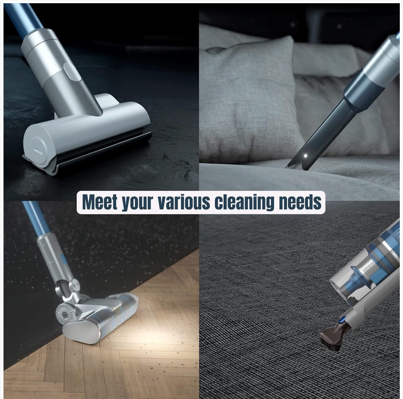
Image: The HAUSMEISTER P018E vacuum cleaner in use, transitioning from a wooden floor to a carpeted area, demonstrating its versatility for multi-floor cleaning.