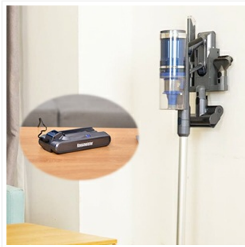
Image: The HAUSMEISTER P018E charging dock, shown both as a standalone unit on a table and mounted on a wall with the vacuum attached.