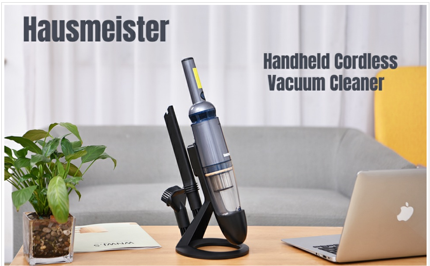
Image: HAUSMEISTER P013 Cordless Vacuum Cleaner with its charging stand and various accessories, including a brush tool and crevice tool.

The HAUSMEISTER P013 is a lightweight, cordless handheld vacuum cleaner designed for quick clean-ups around the home, office, and car. It features a HEPA filter and comes with various attachments for different cleaning needs.