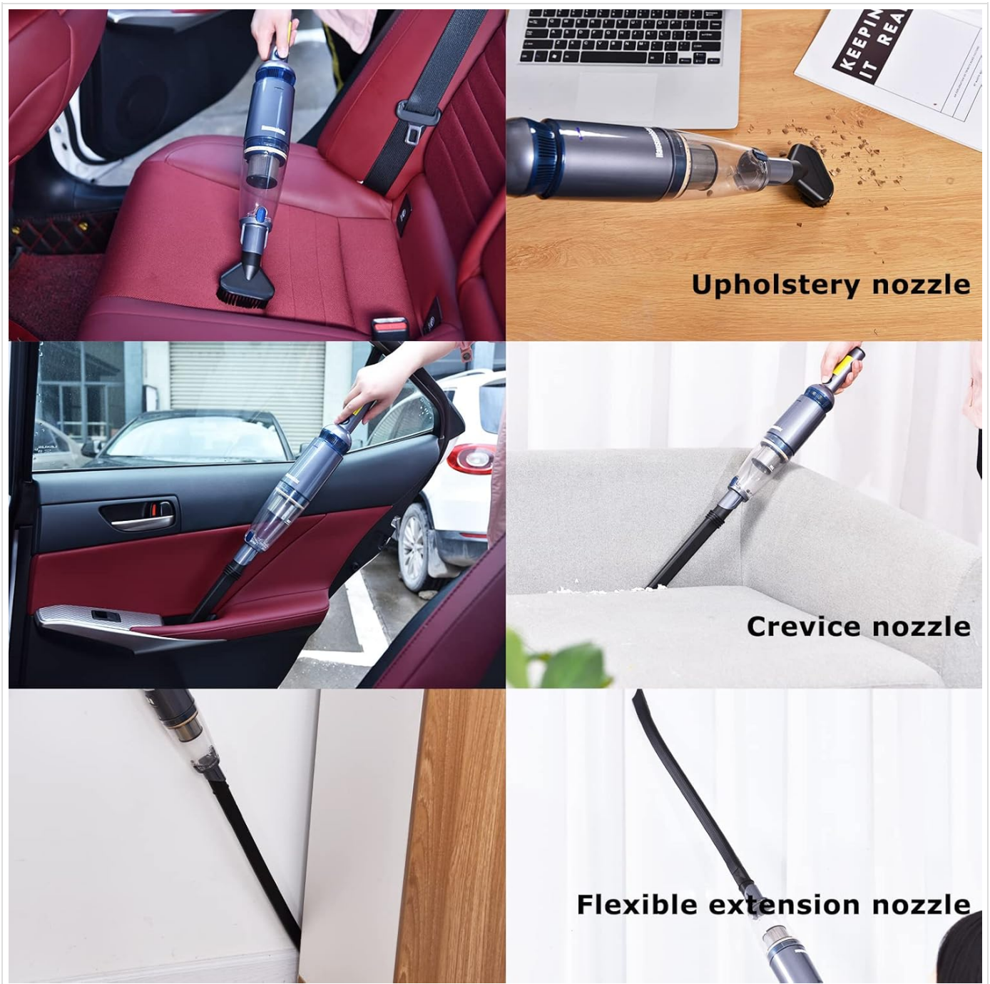
Image: The HAUSMEISTER P013 vacuum cleaner shown with its upholstery nozzle, crevice nozzle, and flexible extension nozzle, demonstrating their use in different cleaning scenarios.

To attach a nozzle, align it with the vacuum's suction inlet and push firmly until it clicks into place. To remove, pull the nozzle away from the inlet.