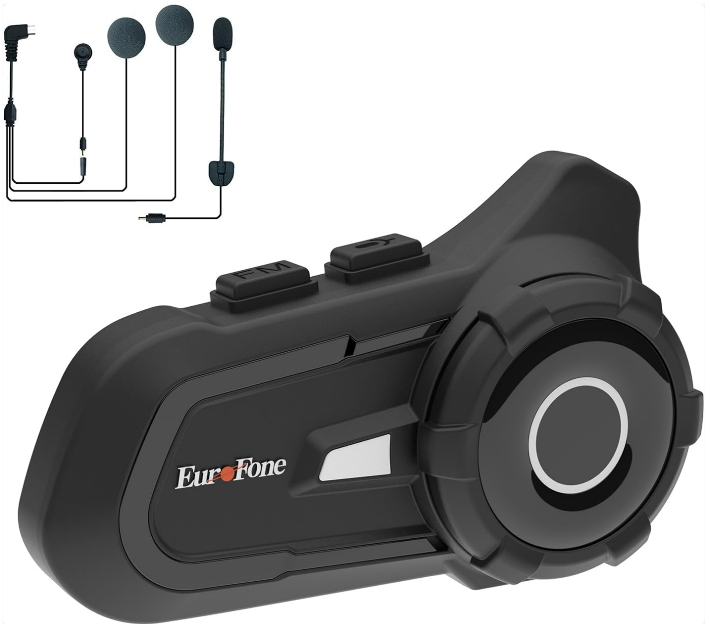
Figure 3.1: The EuroFone S2 main unit, speakers, and both hard and soft microphones included in the package.