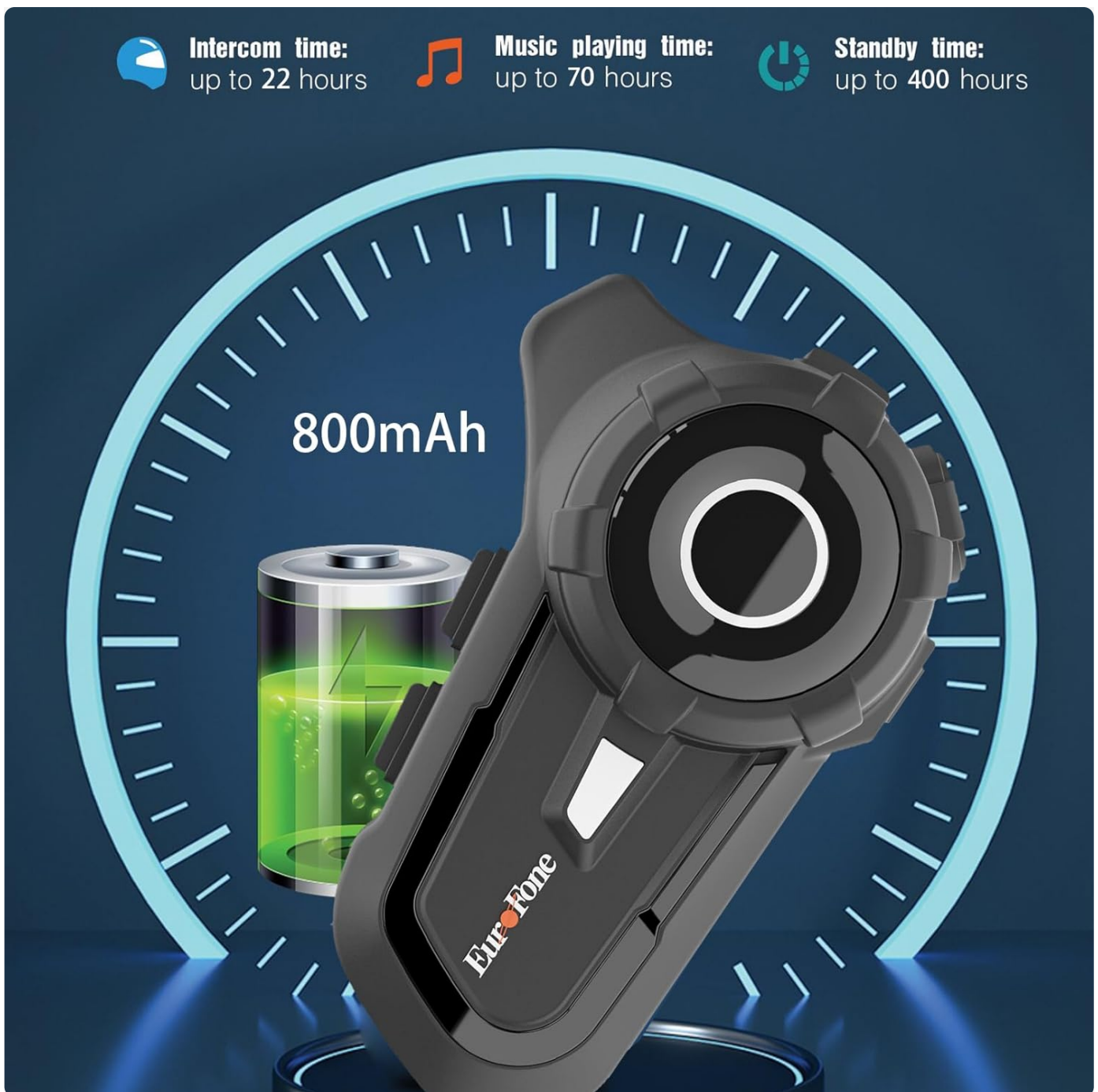
Figure 2.1: Overview of EuroFone S2 key features including 2-rider connection, hands-free call, stereo music, FM radio, GPS positioning, phone link, water resistance, rechargeable battery, and advanced noise control.