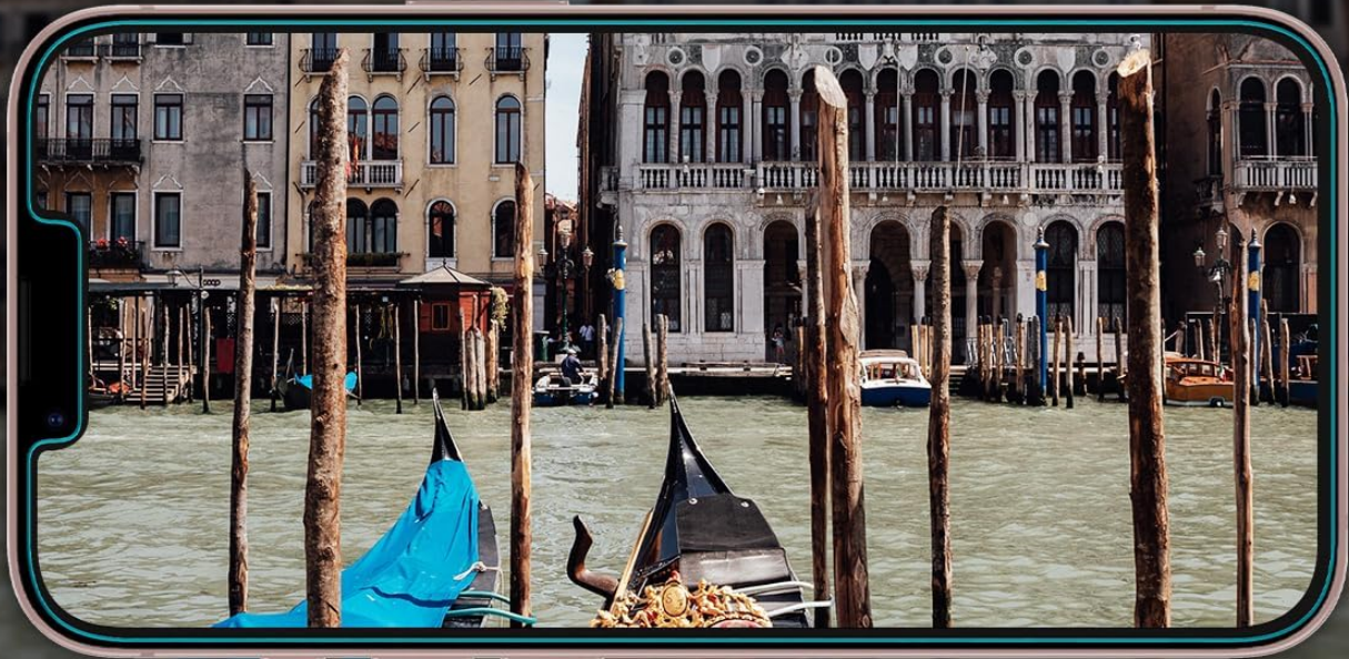
Image: Highlighting the true tone crystal clarity of the screen protector.

Enjoy the same original quality of clarity without any added blemishes.