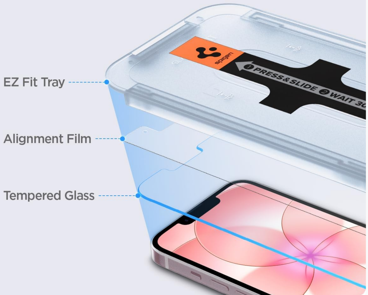
Image: Spigen GlasTR EZ FIT installation kit components.

Alignment tray makes glass application quick and easy without fail.