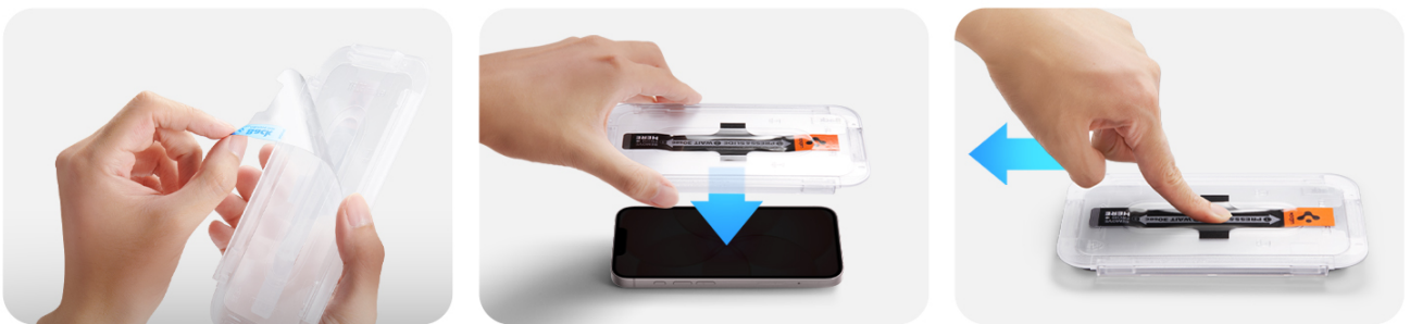
Image: Visual guide for the EZ Fit installation process.

Alignment tray guides the glass application for a precise fit.