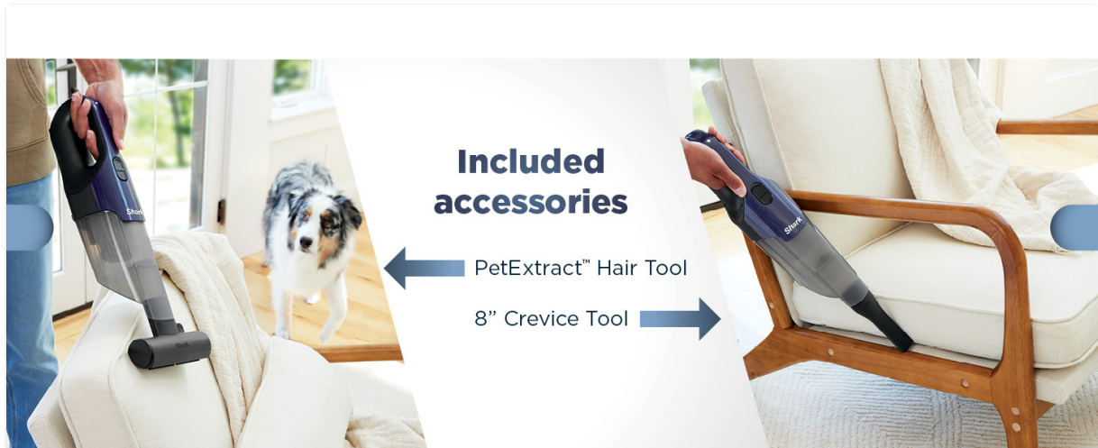
Figure 2: Included accessories with the Shark UltraCyclone Pet Pro.