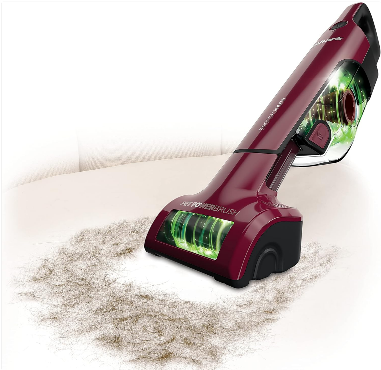
Figure 1: Front view of the Shark UltraCyclone Pet Pro Cordless Handheld Vacuum.