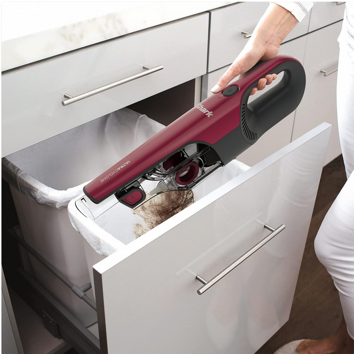
Figure 6: Emptying the XL dust cup with the CleanTouch dirt ejector.