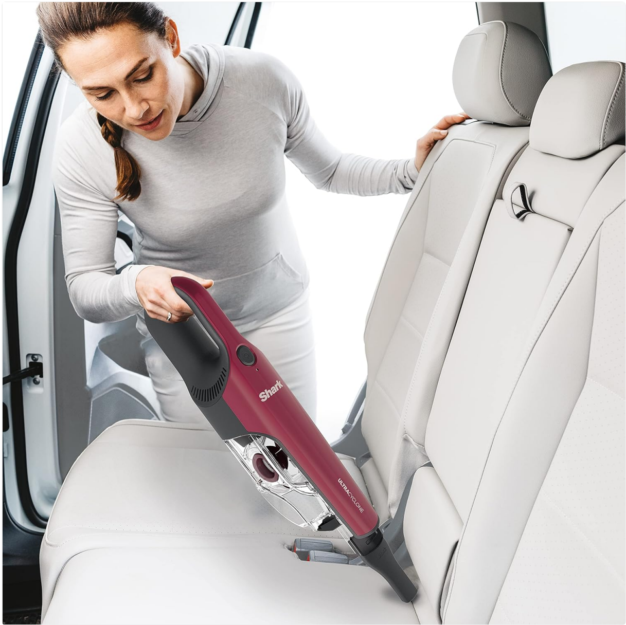
Figure 4: Cleaning a car seat with the crevice tool.