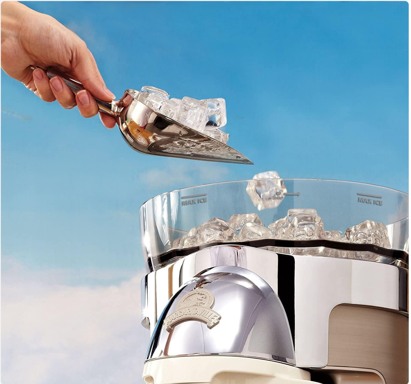
Image: Adding ice to the top reservoir. Ensure ice is evenly distributed for optimal shaving.