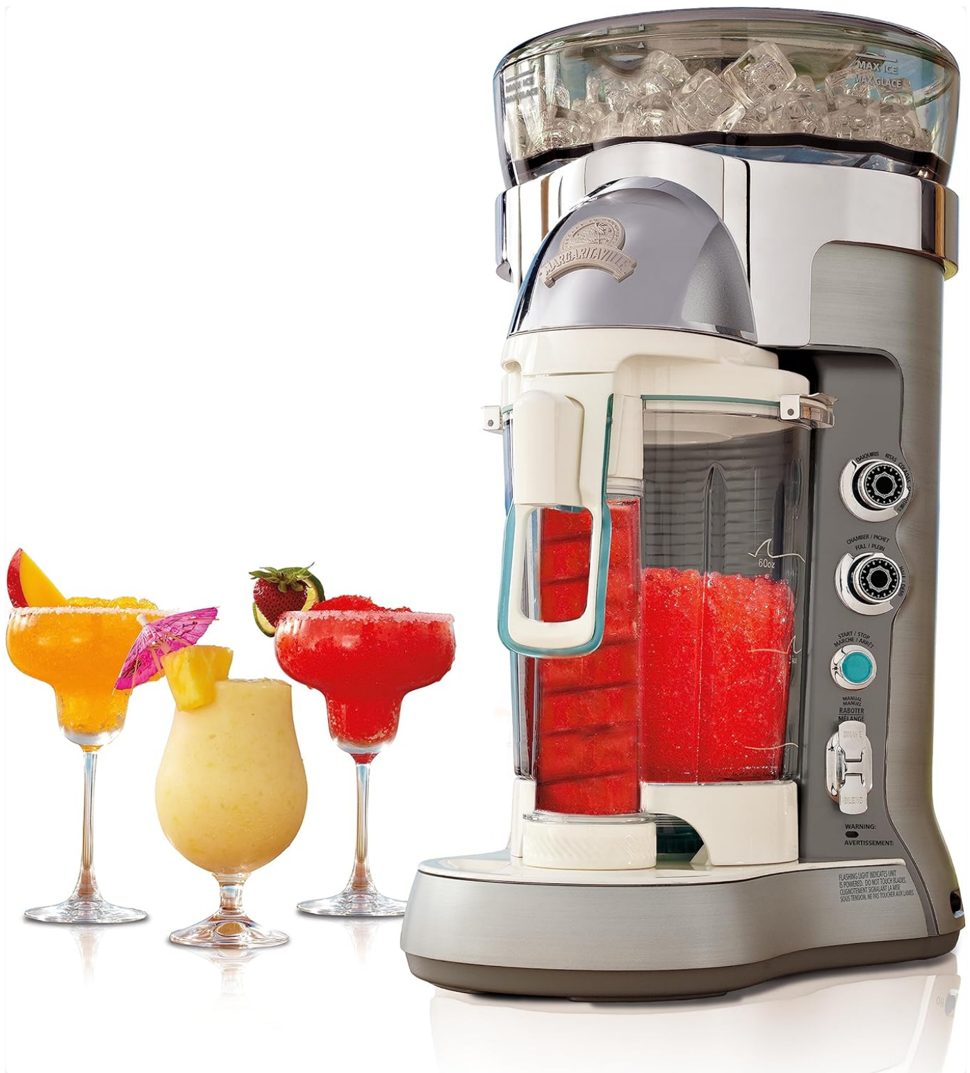
Image: The Margaritaville Bali Frozen Concoction Maker, showcasing its sleek design and three ready-to-serve frozen drinks.