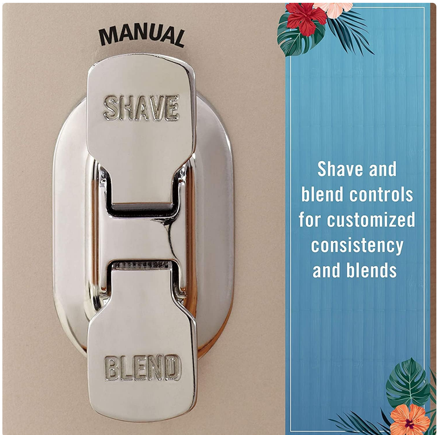
Image: Manual Shave and Blend controls for fine-tuning your drink's consistency.