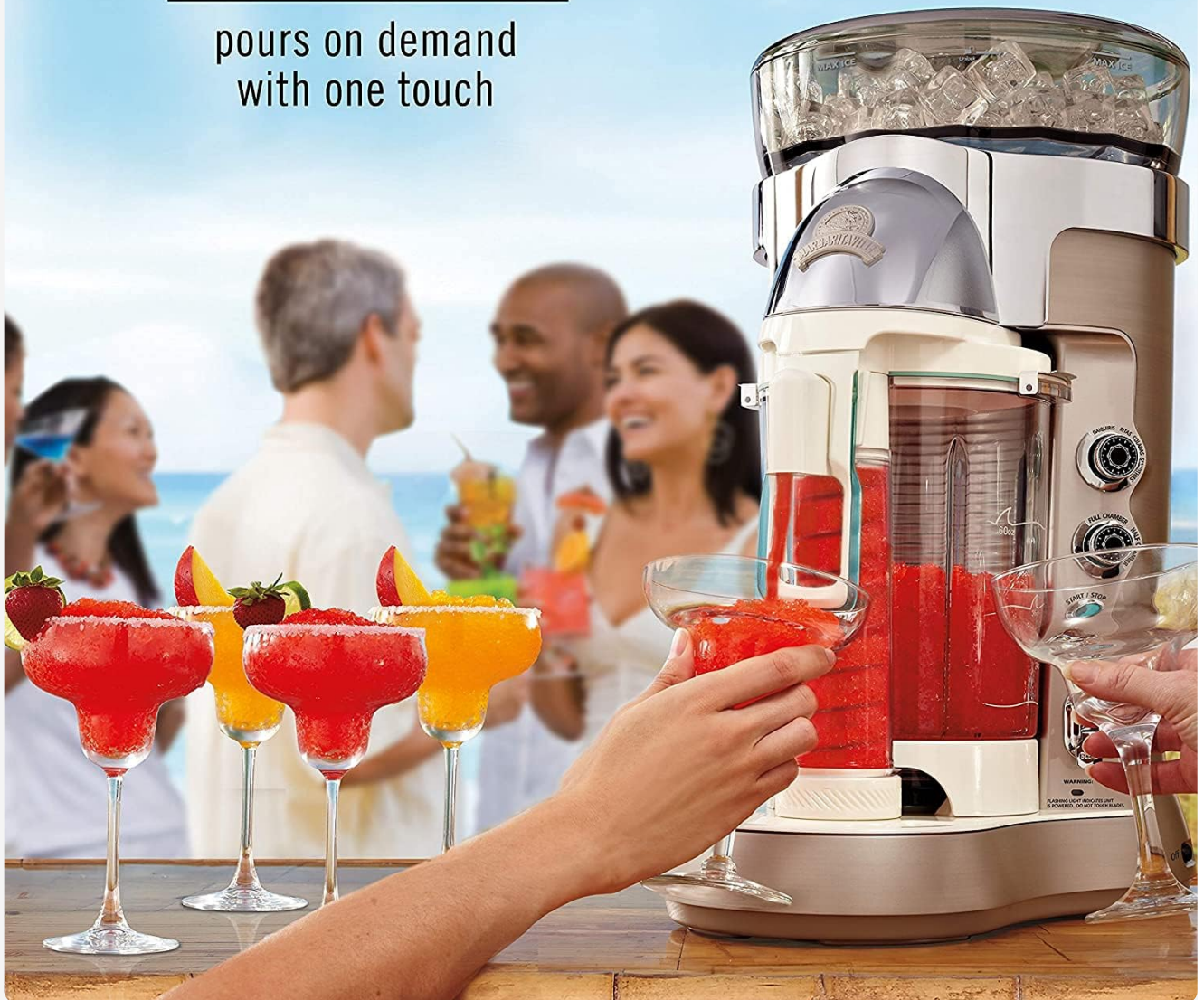
Image: Dispensing a frozen drink directly into a glass. The self-dispensing feature allows for easy serving.