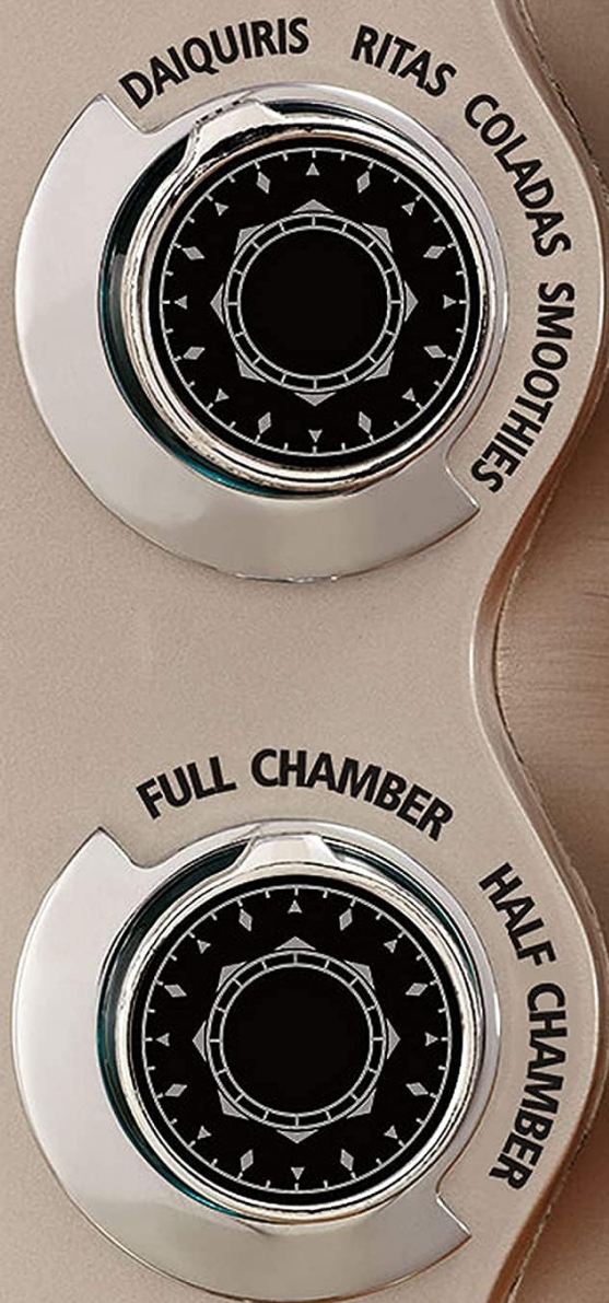
Image: Control dials for selecting drink type and batch size.