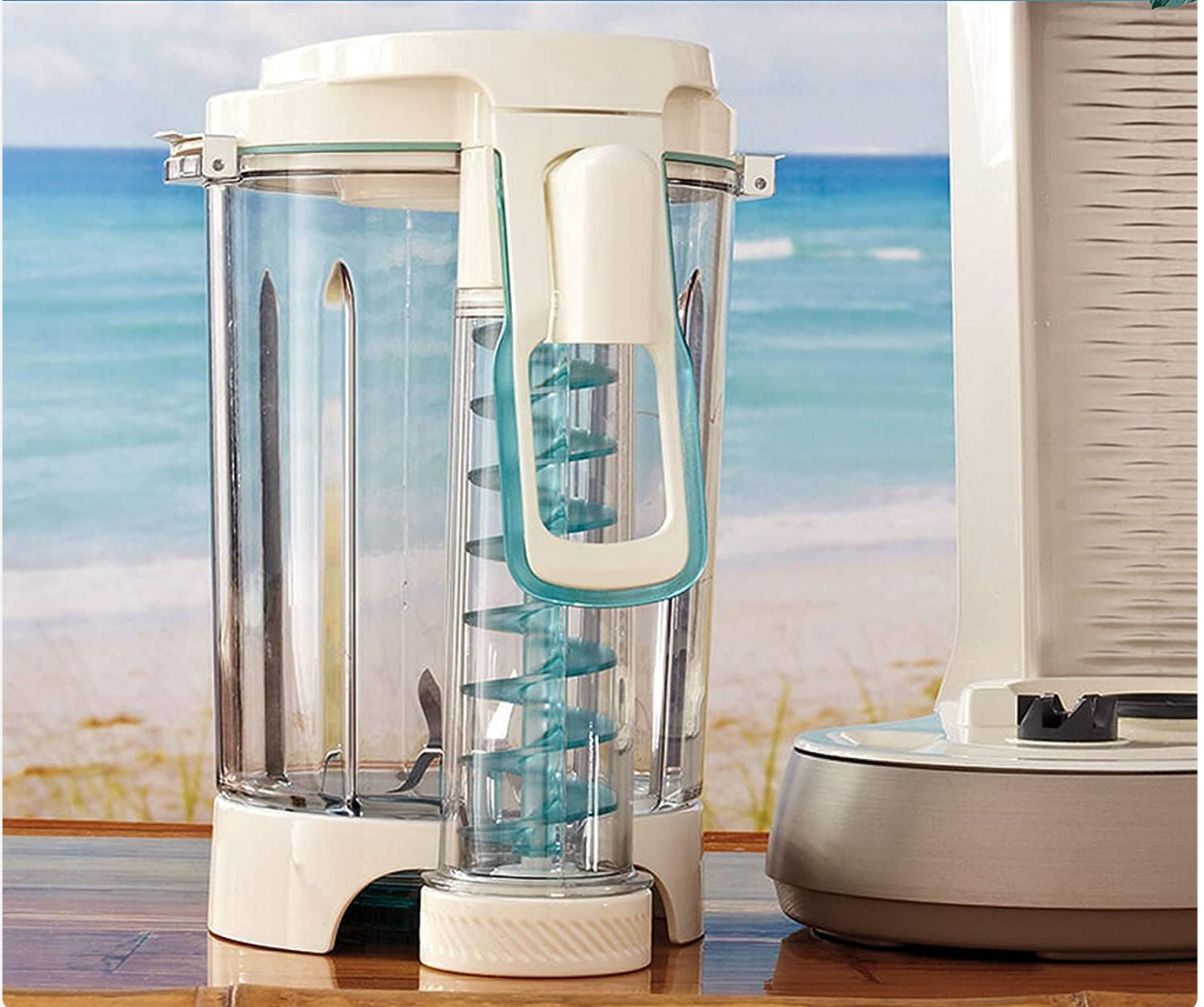
Image: The blending jar with its unique remix channel, designed for consistent blending and dispensing.