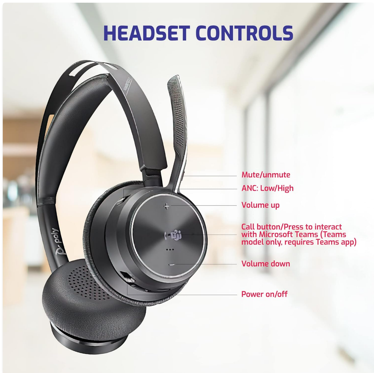
Image: A detailed diagram highlighting the location and function of each control button on the Poly Voyager Focus 2 headset.