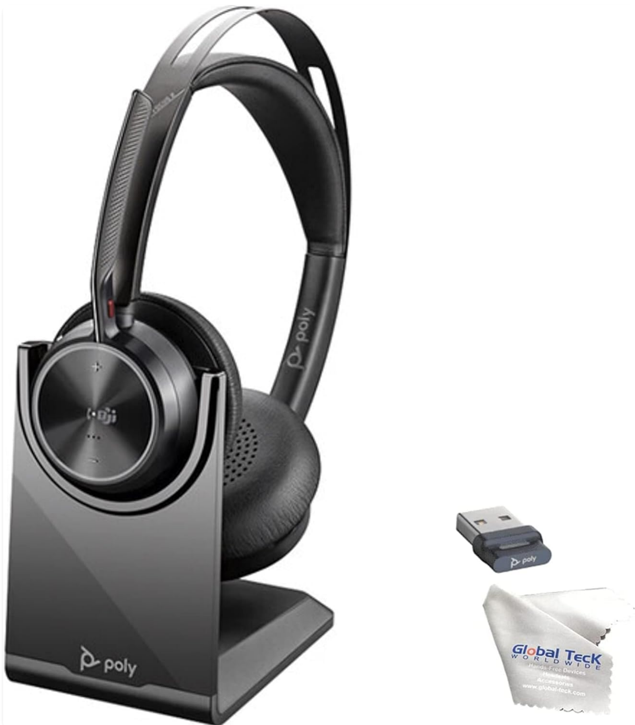
Image: The complete package contents, including the headset on its charging stand, the USB dongle, and a microfiber cleaning cloth.