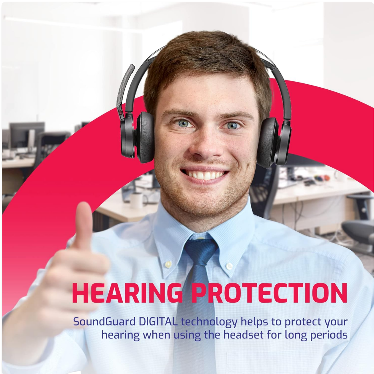
Image: A user wearing the headset, illustrating the impressive 30 days of standby power, minimizing the need for frequent recharging.