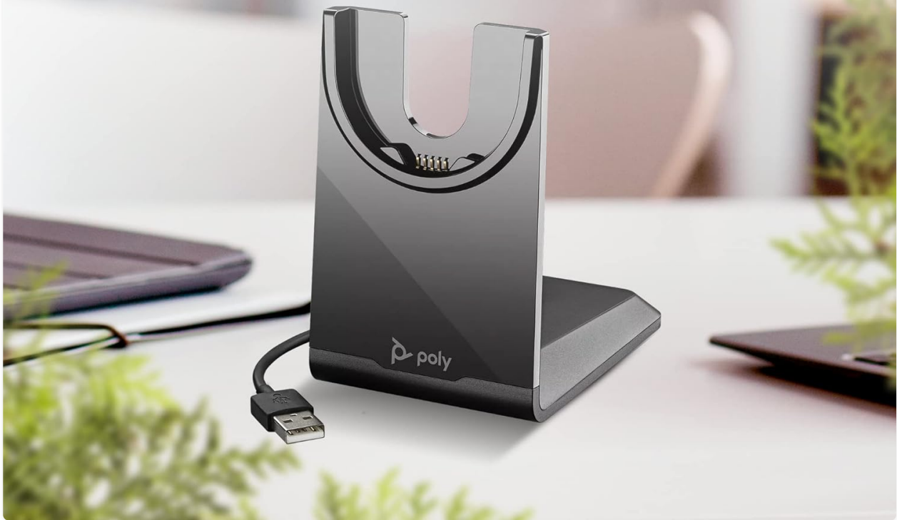
Image: The dedicated charging stand for the Poly Voyager Focus 2 headset, designed to keep the headset powered and ready for use.

Lets you store your headset when not in use, stays powered up and ready for your next call