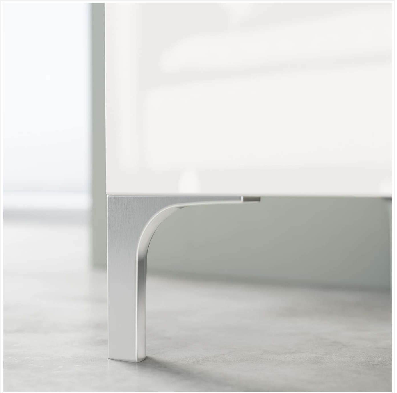
Image: A NANNARP leg securely installed on an IKEA BESTA unit, demonstrating the flush fit and stable connection.