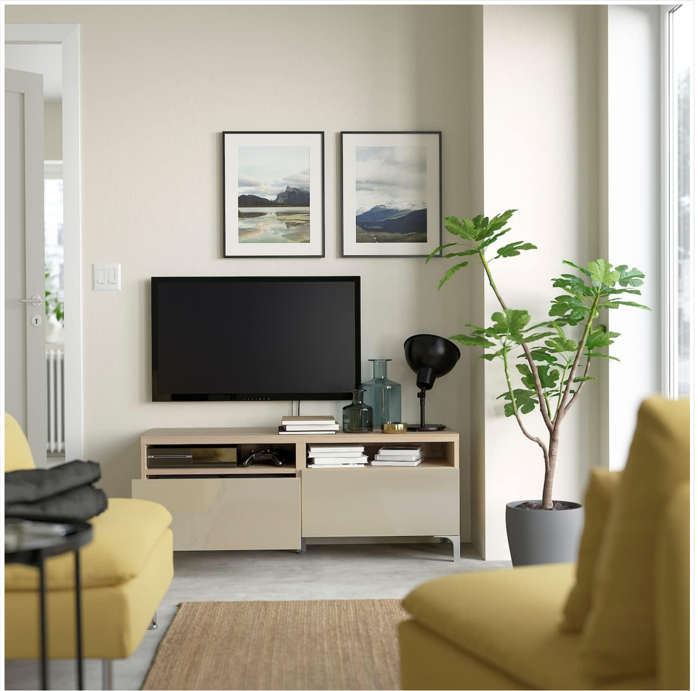
Image: An IKEA BESTA storage system elevated by NANNARP legs, integrated into a modern living room environment, showcasing the product's intended use.