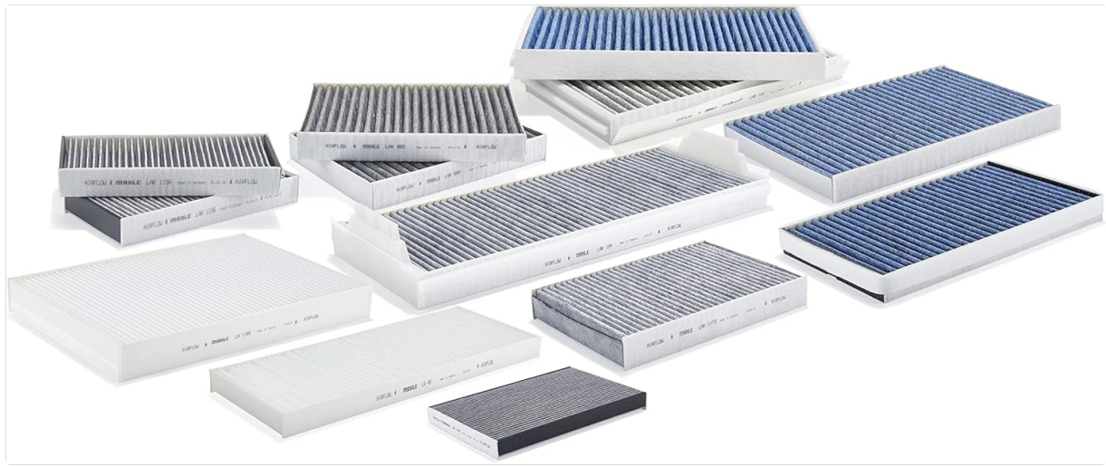
Image 2: A variety of MAHLE cabin air filters, showcasing different designs and sizes, including filters similar to the LA 1506.