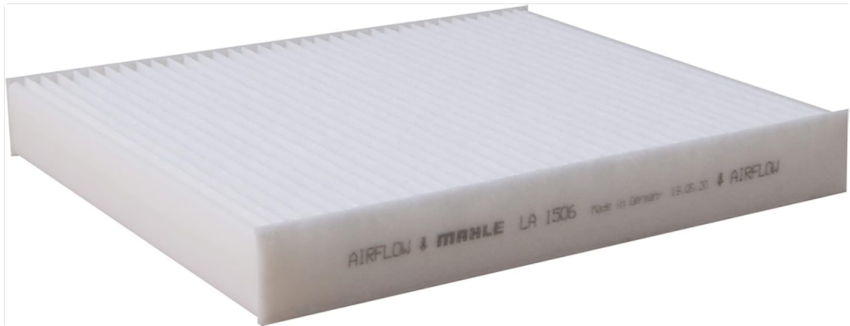
Image 1: The MAHLE LA 1506 Interior Cabin Air Filter, a white rectangular filter with 'AIRFLOW MAHLE LA 1506' printed on its side.

The MAHLE LA 1506 Interior Cabin Air Filter is designed to purify the air entering your vehicle's passenger compartment. It effectively filters out dust, pollen, and other airborne particles, contributing to a cleaner and healthier cabin environment. Regular replacement of your cabin air filter is essential for maintaining optimal air quality and the efficiency of your vehicle's heating, ventilation, and air conditioning (HVAC) system.