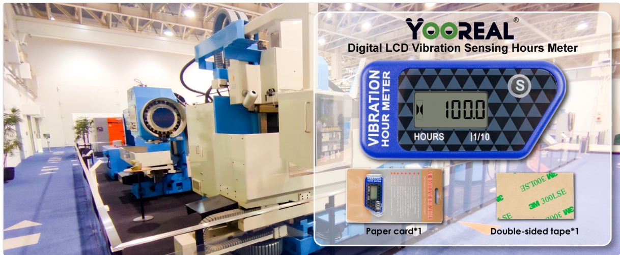
Image: YOOREAL Vibration Hour Meter and included accessories.