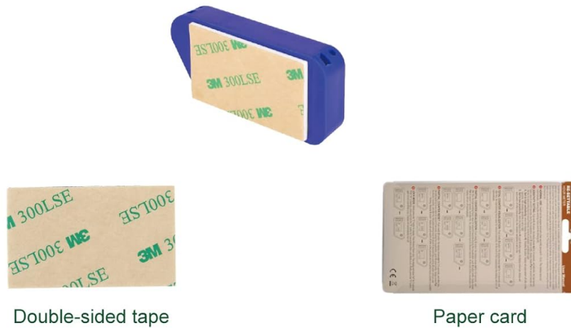
Image: Hour meter dimensions and installation method.