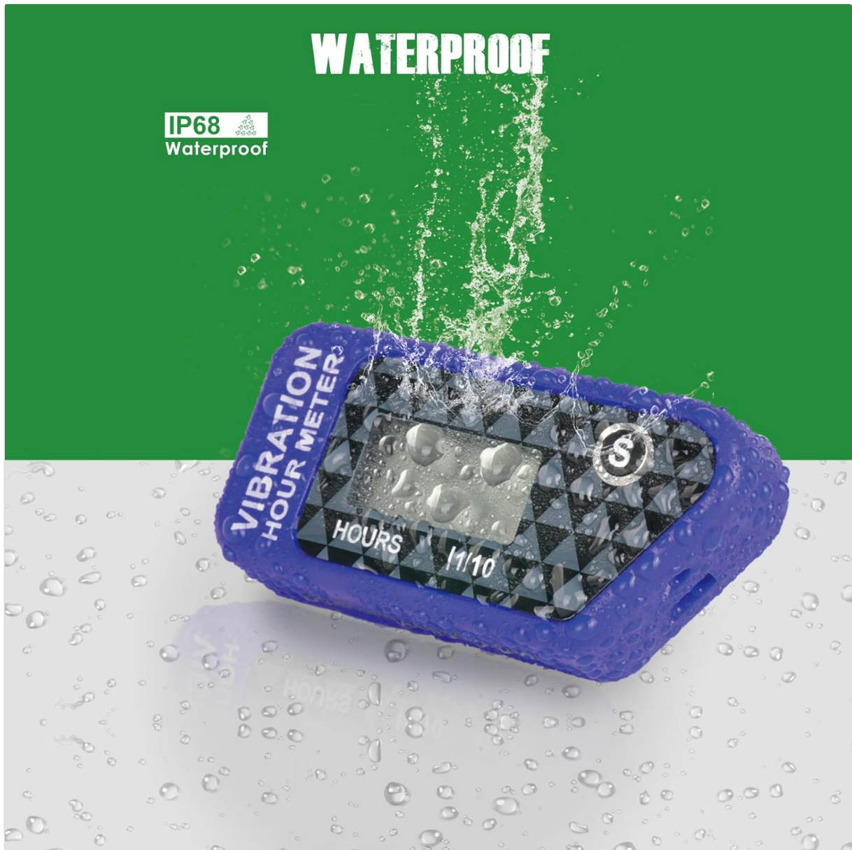
Image: Hour meter undergoing a waterproof test.