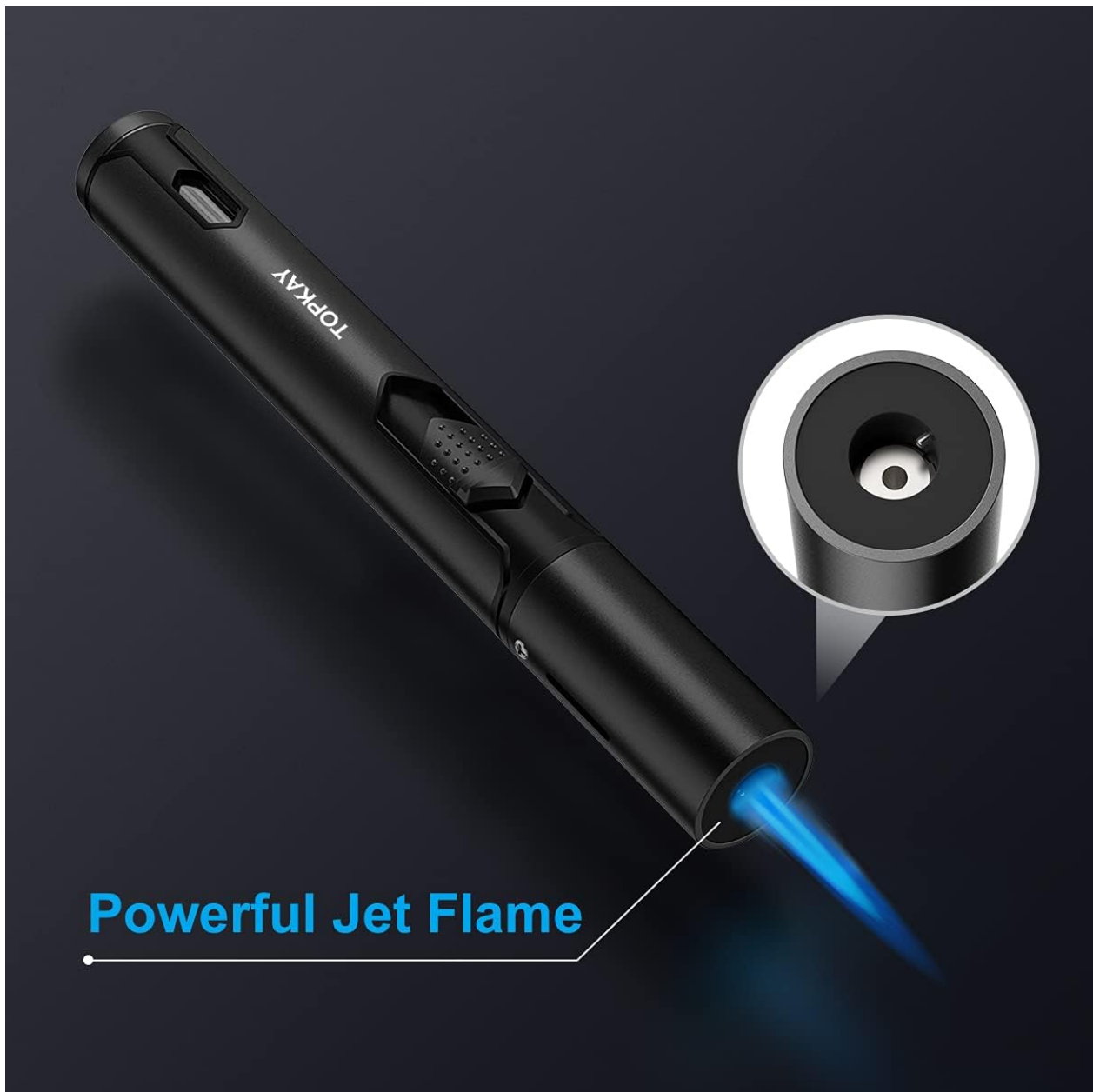
Image: The powerful jet flame in action.