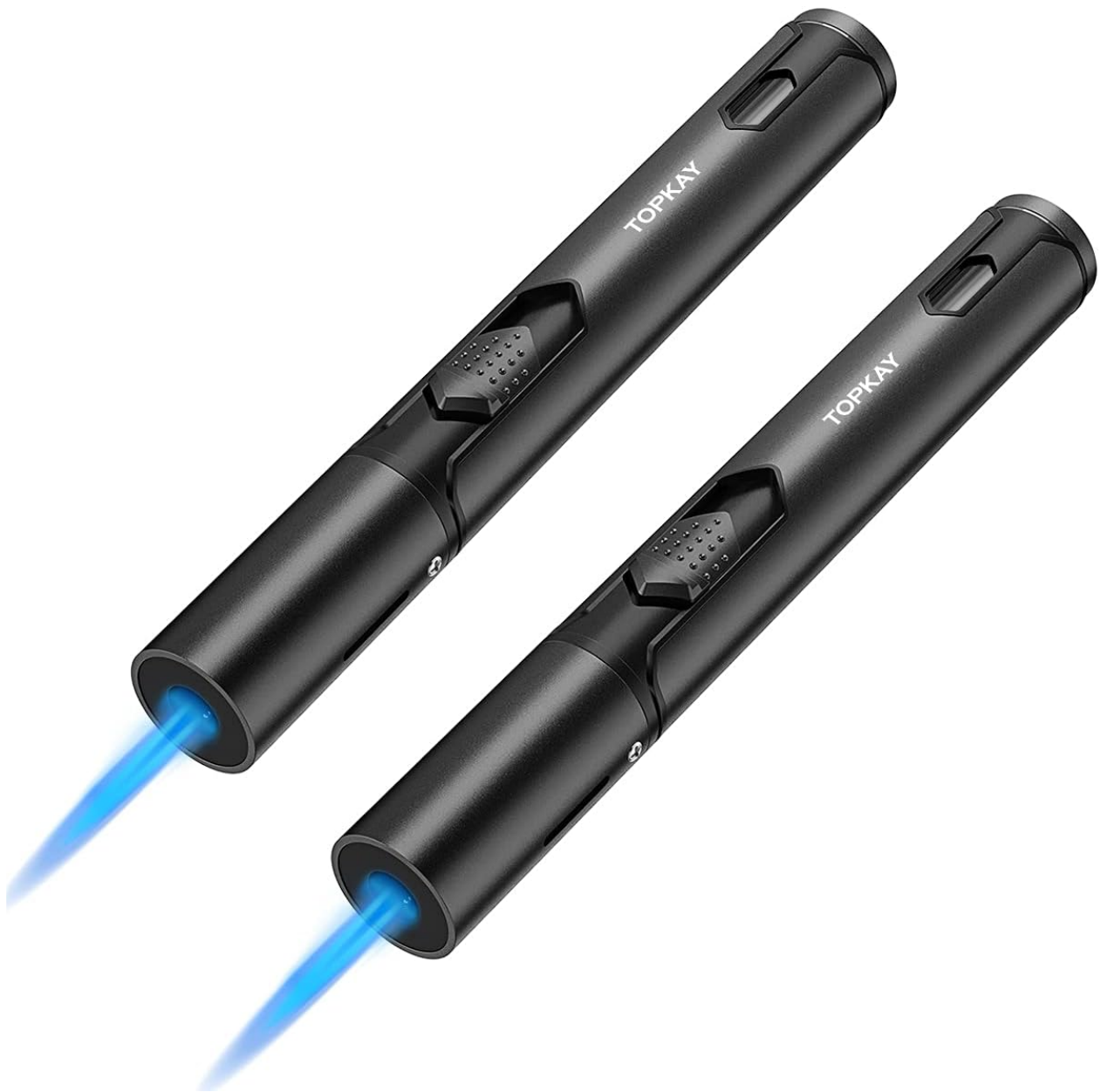
Image: Two TOPKAY Butane Torch Lighters in operation.