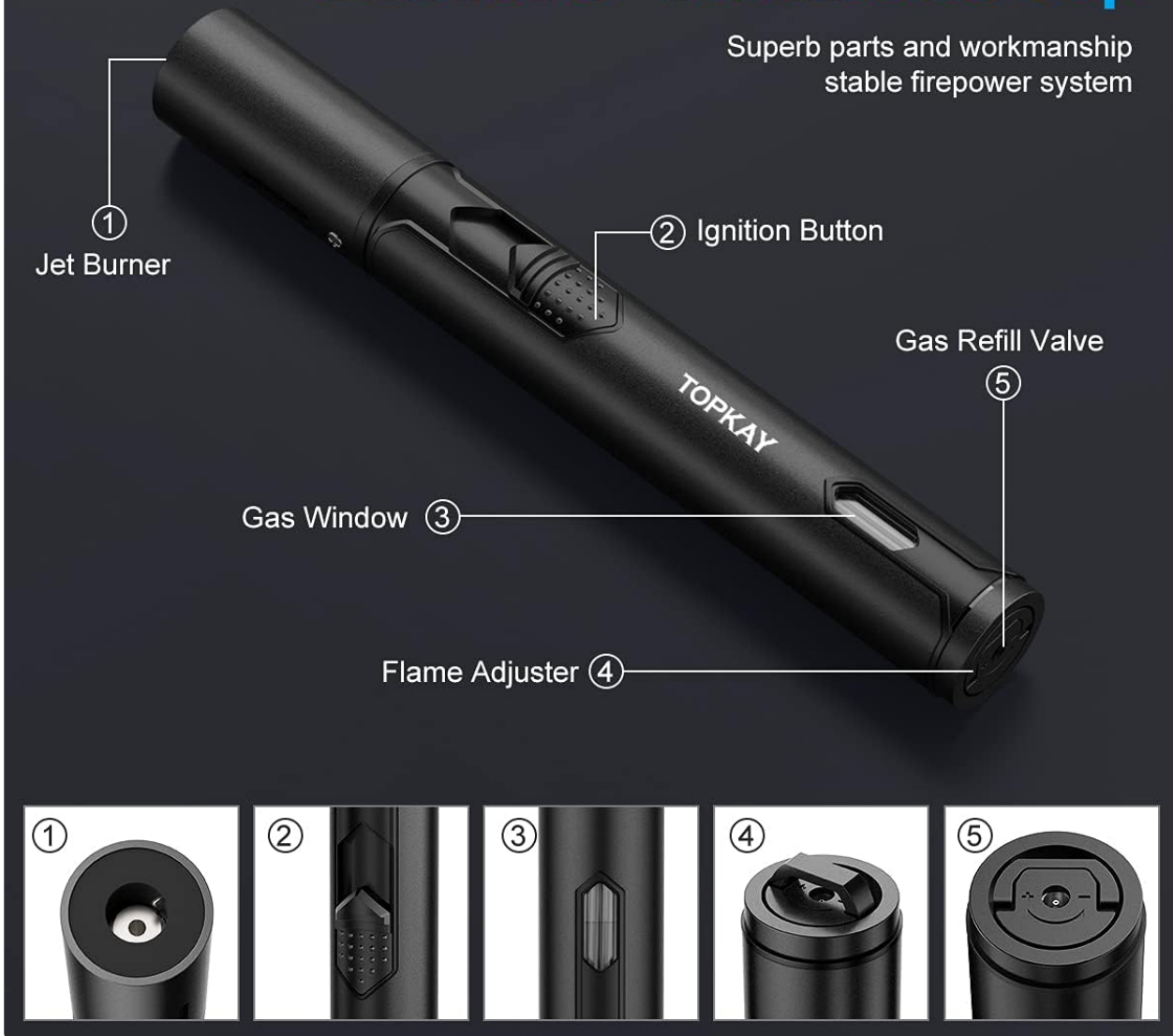
Image: Labeled components of the TOPKAY Torch Lighter.

Superb parts and workmanship stable firepower system