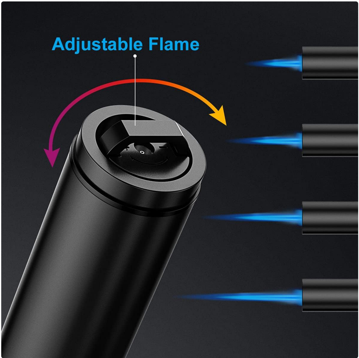
Image: How to adjust the flame height on your lighter.