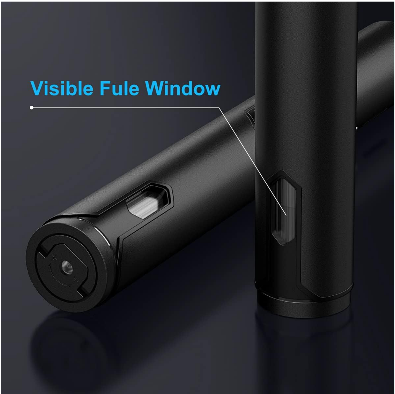
Image: The visible fuel window for easy monitoring.