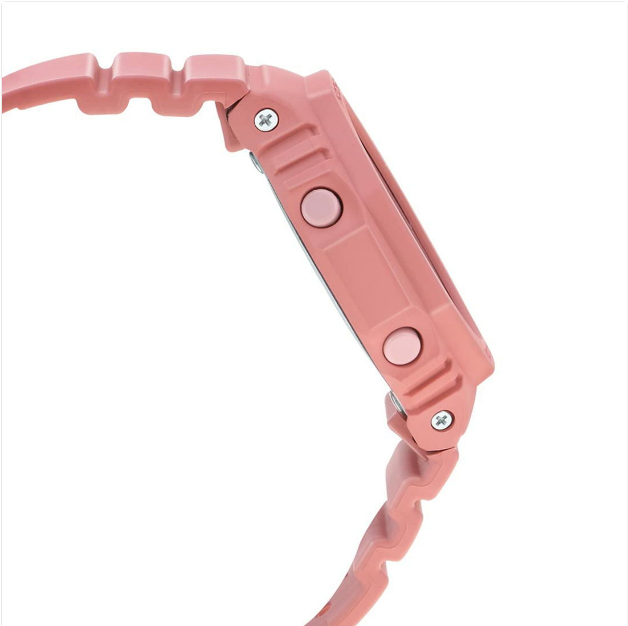
Image 3.2: Right side view of the watch, highlighting the 'Light' and 'Start' buttons on the right side of the case.