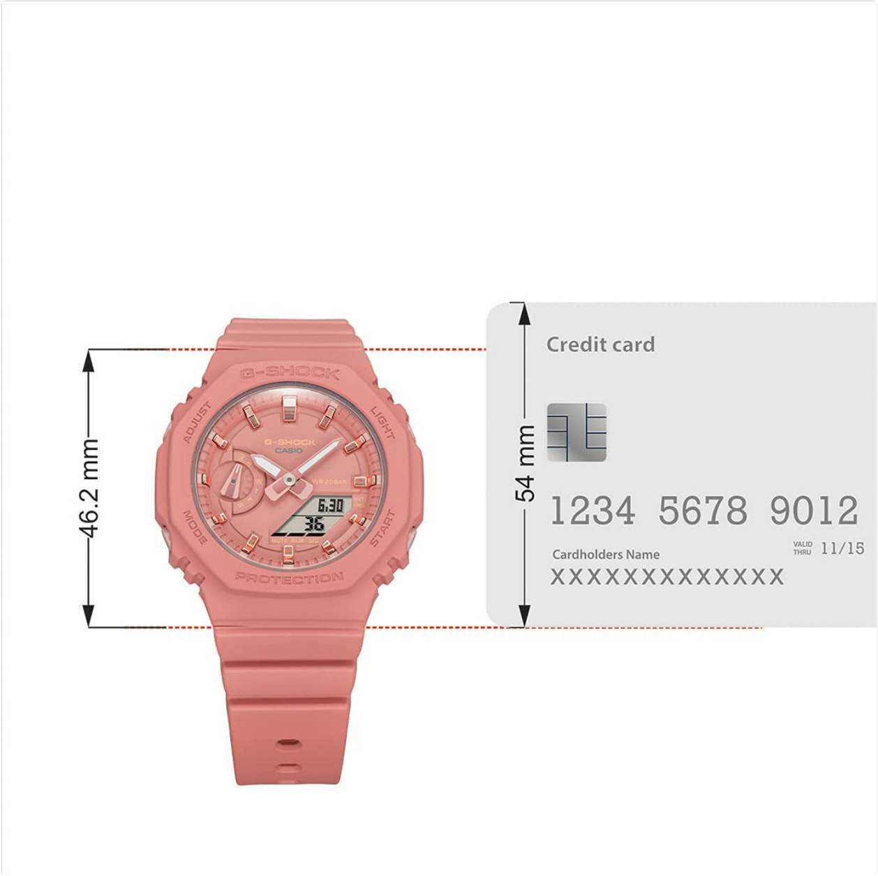
Image 8.1: Watch dimensions illustration. This image provides a visual comparison of the watch's size (46.2 mm length) against a standard credit card (54 mm width).