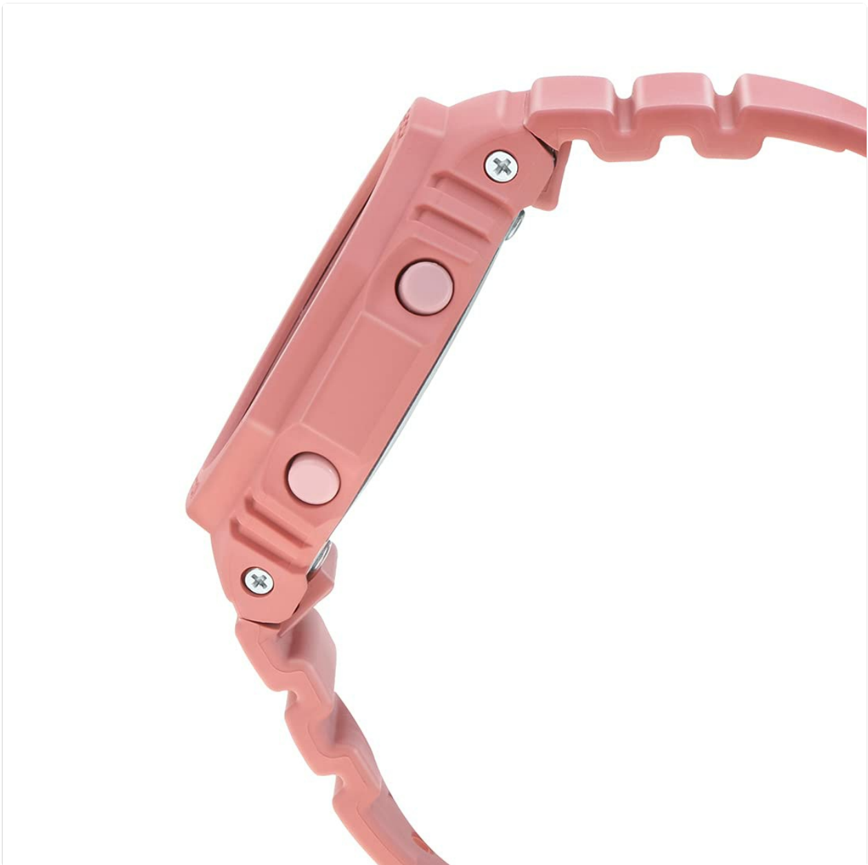
Image 3.1: Left side view of the watch, highlighting the 'Adjust' and 'Mode' buttons on the left side of the case.