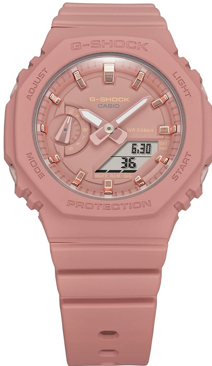
Image 1.1: Front view of the Casio G-Shock GMA-S2100-4A2DR watch. This image displays the watch's pink analog-digital dial, octagonal bezel, and matching pink resin strap. The digital display shows "6.30" and "36".