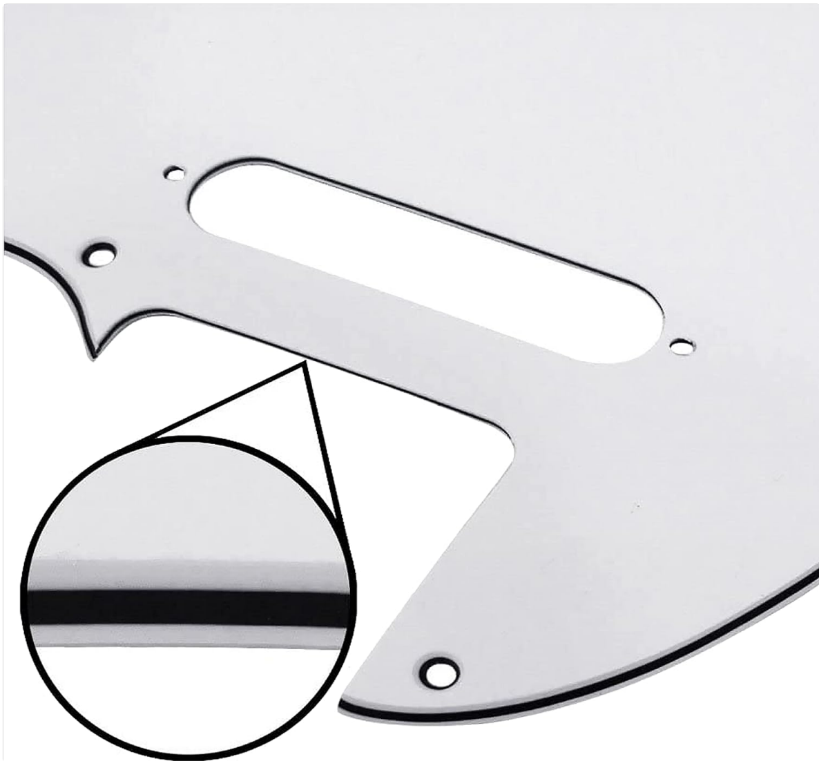
Figure 2: Close-up view of the pickguard's edge, highlighting the 3-ply (white/black/white) construction.