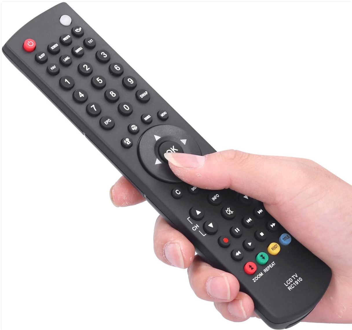
Image: A detailed view of the RC1910 remote control's silicone buttons and ABS casing, highlighting its durable and comfortable design.