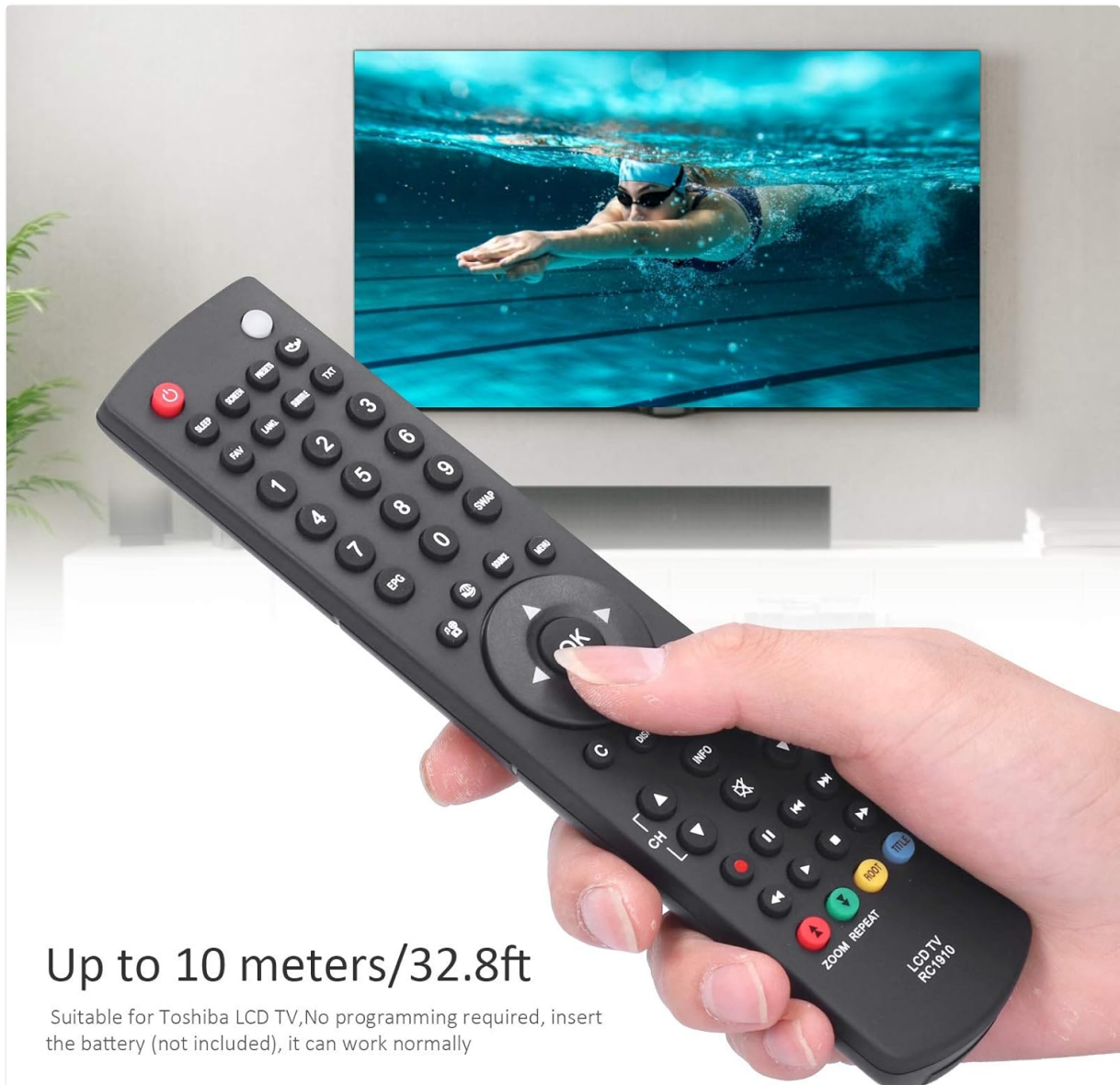
Image: The RC1910 remote control being used, illustrating its effective operating range of up to 10 meters (32.8 feet) from the television.

The effective operating distance of the remote control is up to approximately 10 meters (32.8 feet). Optimal performance is achieved within this range and with fresh batteries.