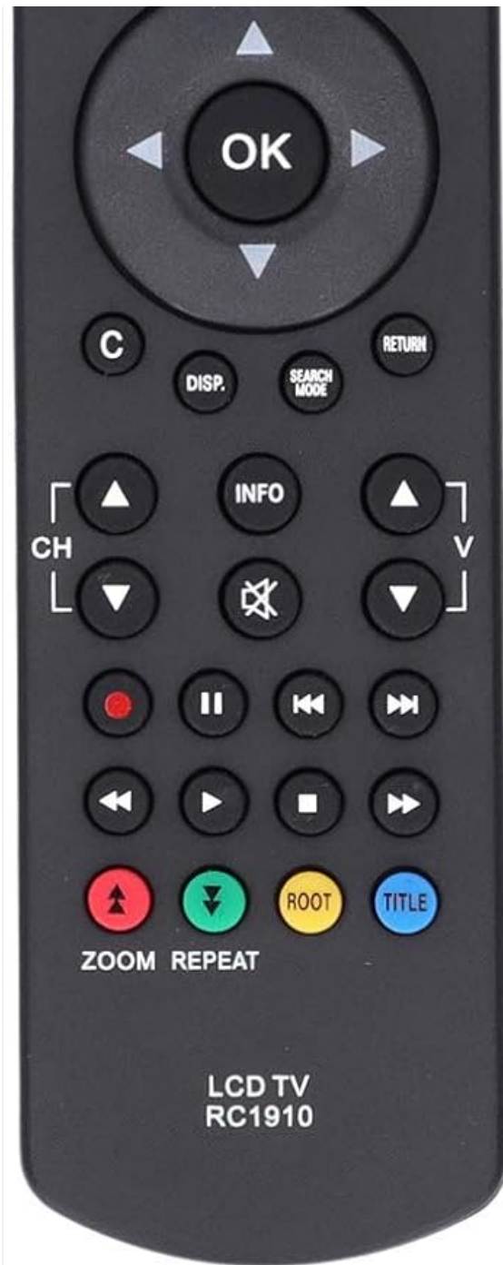
Image: The RC1910 Universal Remote Control, showcasing its full button layout and sleek black design.