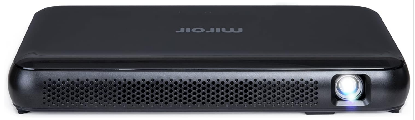
Image: Front view of the Miroir M600 Projector, showing the projection lens and ventilation grille.