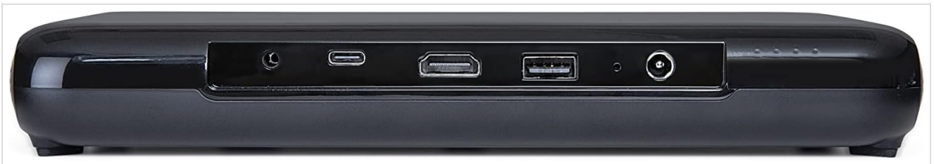
Image: Rear view of the Miroir M600 Projector, highlighting the various input/output ports.