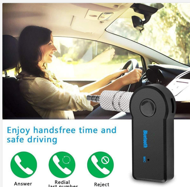
Figure 7: Visual representation of call management features.

When connected to your phone, the receiver allows for hands-free communication.