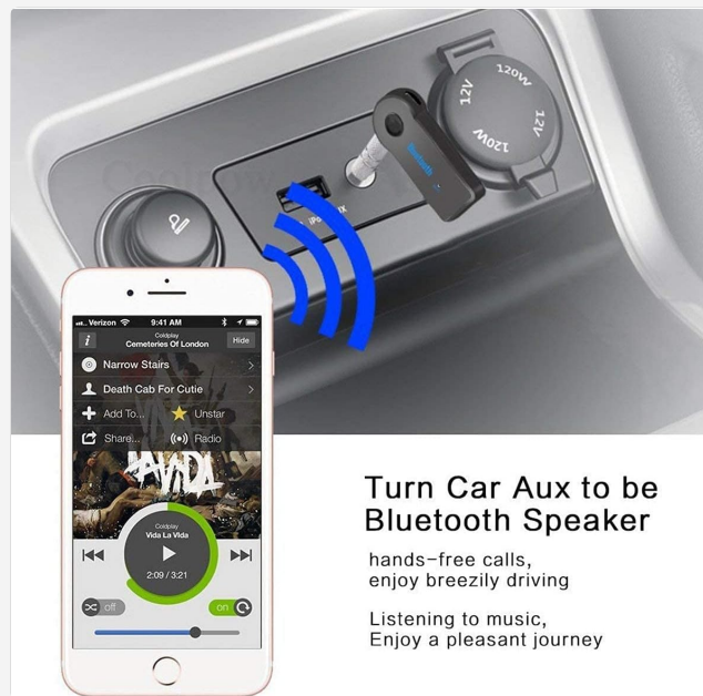
Figure 4: The receiver in a car's AUX port, enabling wireless audio streaming from a smartphone.

Plug the 3.5mm audio connector into the receiver's 3.5mm audio interface, then plug the other end of the 3.5mm connector into the AUX input of your car stereo, home audio system, or headphone jack.