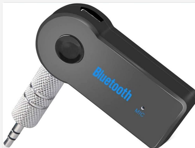
Figure 1: The UrbanX Mini Bluetooth Receiver, a compact device for wireless audio.

Familiarize yourself with the components and features of your UrbanX Mini Bluetooth Receiver.