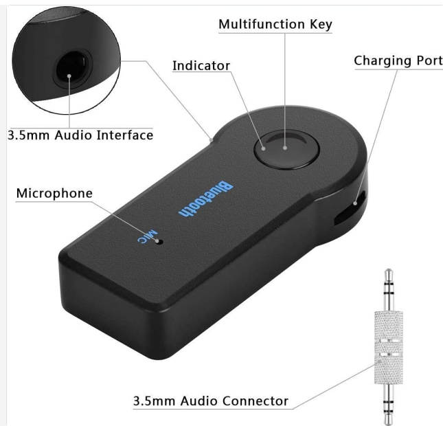
Figure 2: Labeled diagram of the UrbanX Mini Bluetooth Receiver, showing the Multifunction Key, Indicator, Charging Port, 3.5mm Audio Interface, Microphone, and 3.5mm Audio Connector.