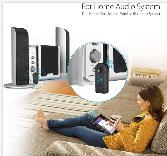
Figure 5: The receiver integrated with a home audio system, turning it into a wireless Bluetooth speaker.