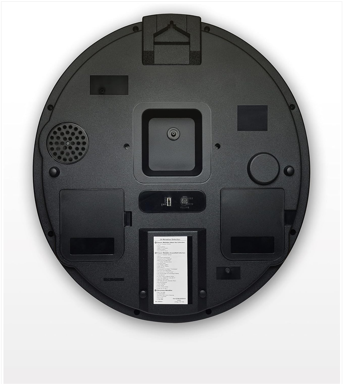
Rear view of the clock, illustrating the battery compartments and the integrated wall mounting hook.