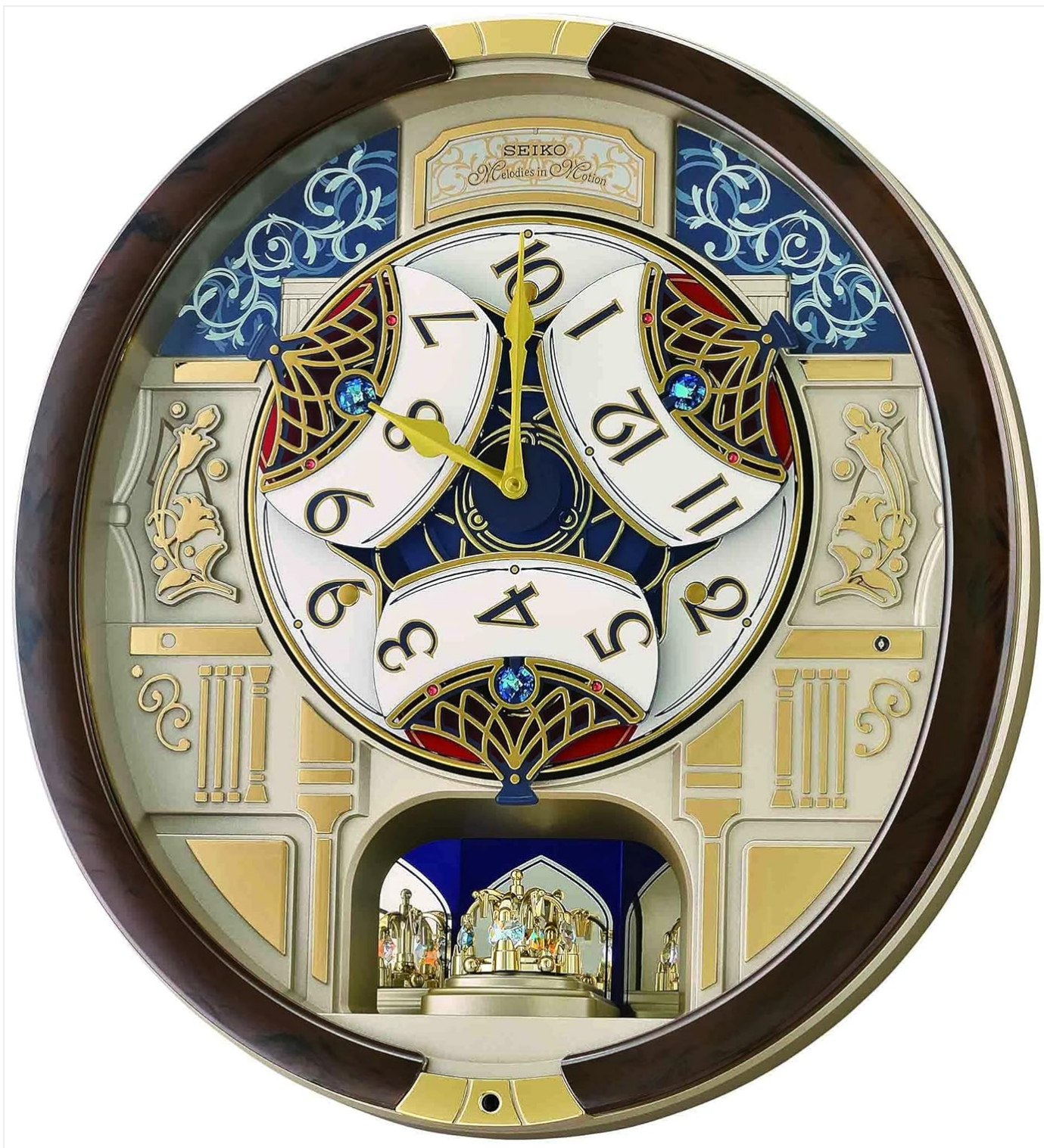
The clock's face partially open, showcasing the intricate internal mechanism and decorative elements.