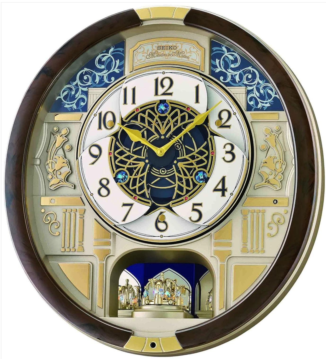
Front view of the Seiko Melodies in Motion Wall Clock, Golden Trellis. The clock features a detailed golden and blue design, a white clock face with black numerals, and a visible pendulum area at the bottom.