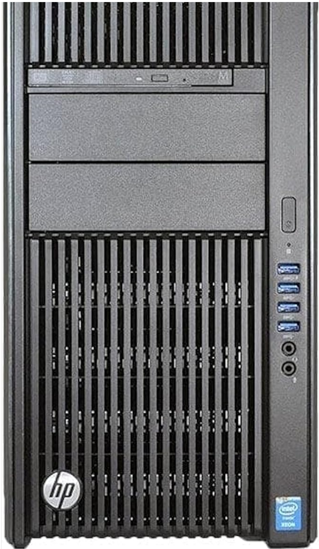
Figure 3: Front panel of the workstation, showing the power button and front I/O ports.