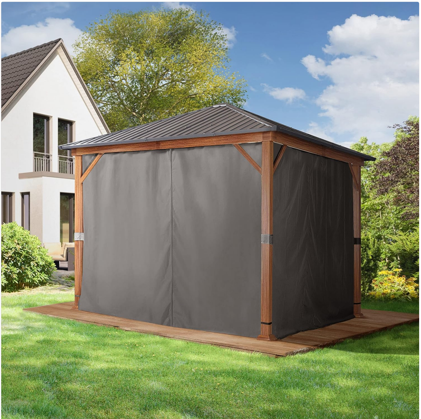
Figure 7: TOOLPORT Forest 3x3m Garden Gazebo with all four side curtains closed, providing privacy and protection.