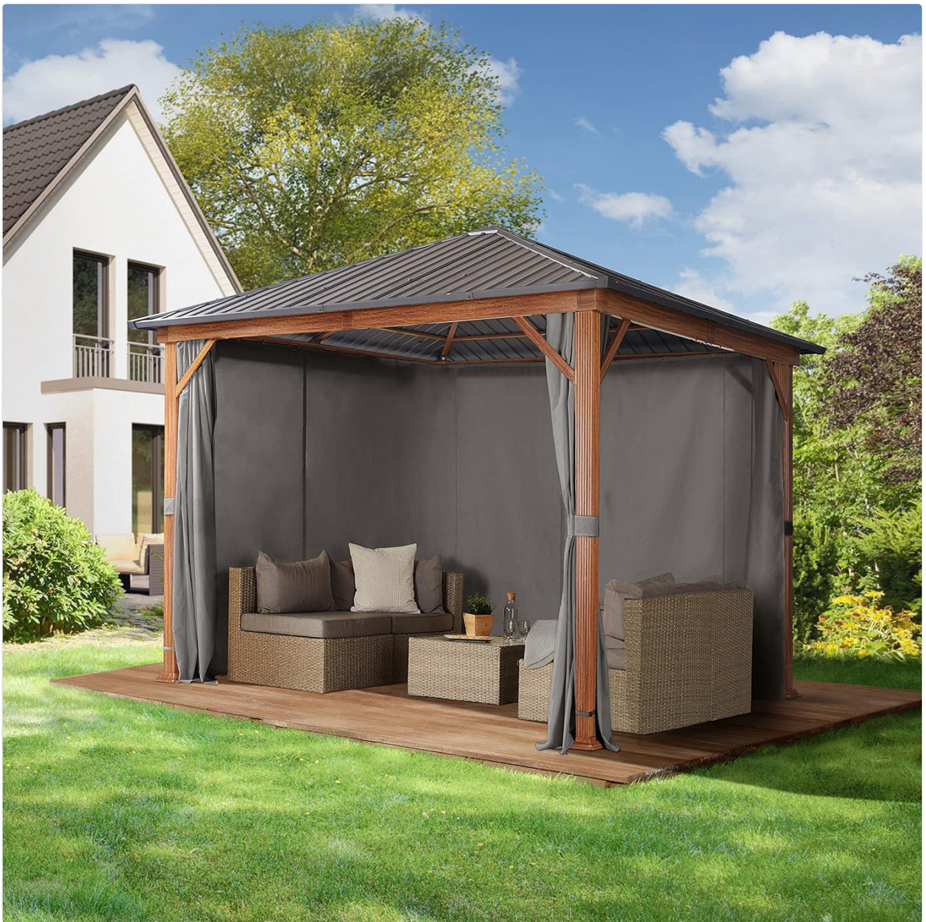
Figure 1: TOOLPORT Forest 3x3m Garden Gazebo with open side curtains, showcasing the wood-look frame and steel roof in a garden setting.