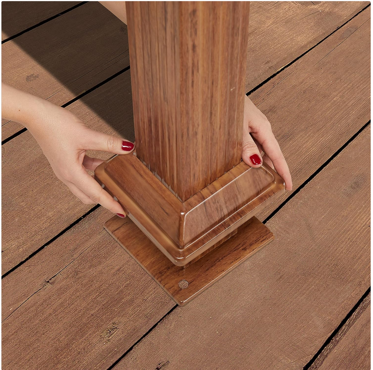
Figure 5: Close-up of the gazebo's post base, showing how it is secured to the ground for stability.