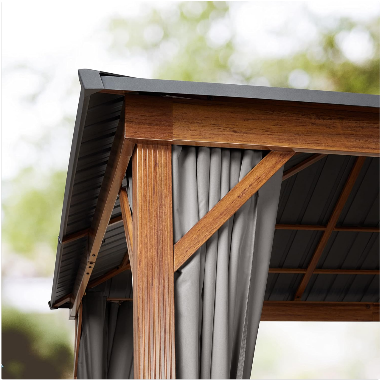
Figure 4: Detail of the gazebo's roof edge, demonstrating the secure attachment of the steel roof panels to the frame.