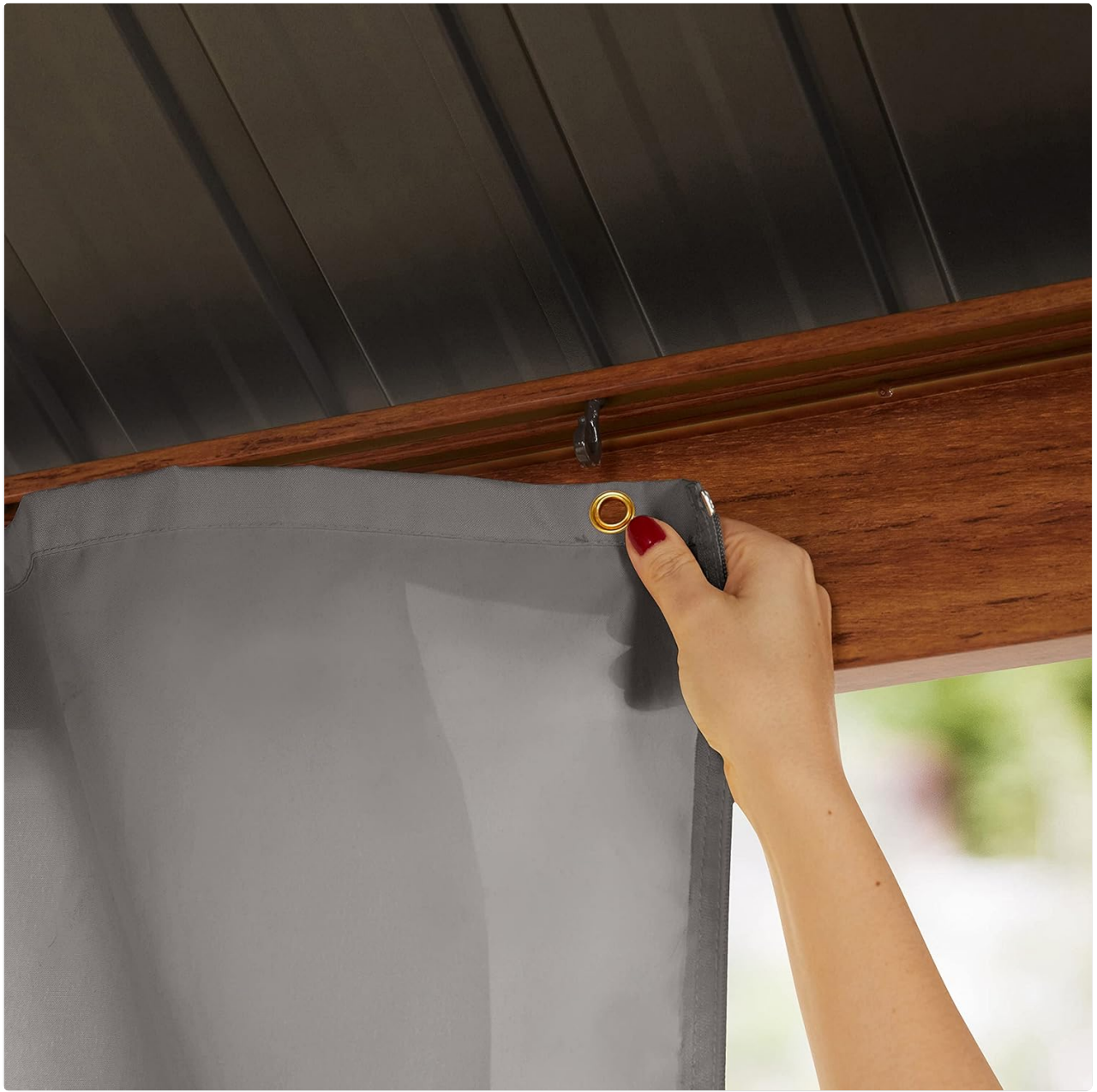
Figure 6: A hand attaching a side curtain to the gazebo frame using a hook, illustrating the simple hanging mechanism.