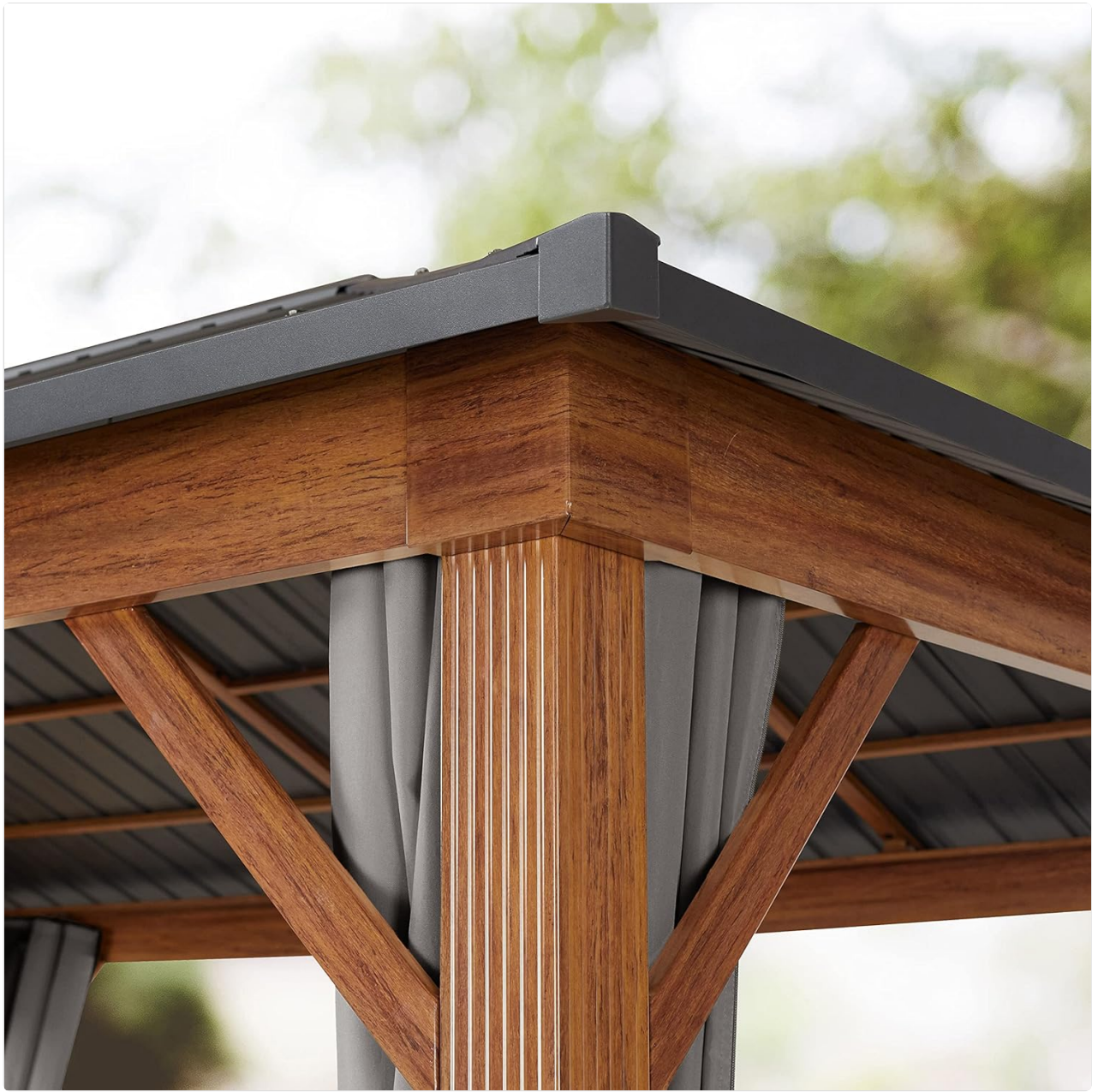
Figure 2: Close-up of a corner joint on the gazebo frame, showing the connection between the wood-look aluminum posts and roof beams.