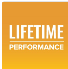
Image 8.1: Bostitch emphasizes lifetime performance for its products.

The Bostitch Heavy Duty Stapler B175-GOLD comes with a Limited Lifetime Warranty . This warranty covers defects in materials and workmanship under normal use. For specific terms and conditions, please refer to the official Bostitch warranty documentation or contact customer support.