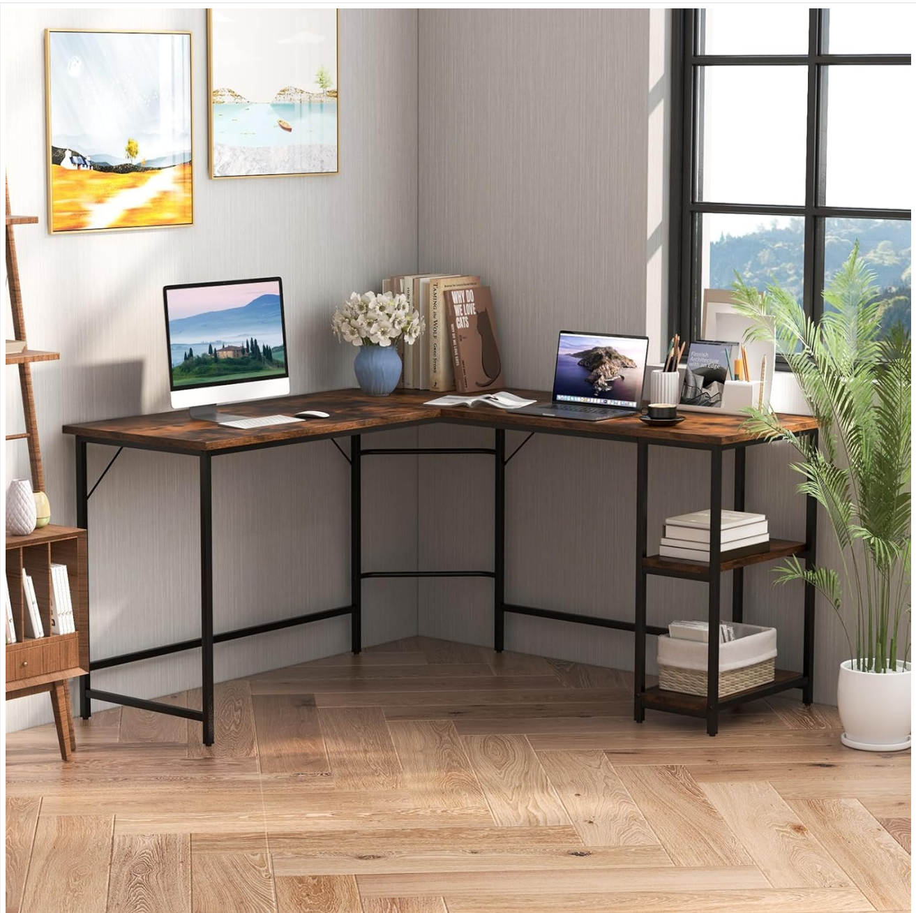
Figure 5: Image illustrating the removable shelf feature, allowing users to customize their storage space, for example, to fit a computer tower.