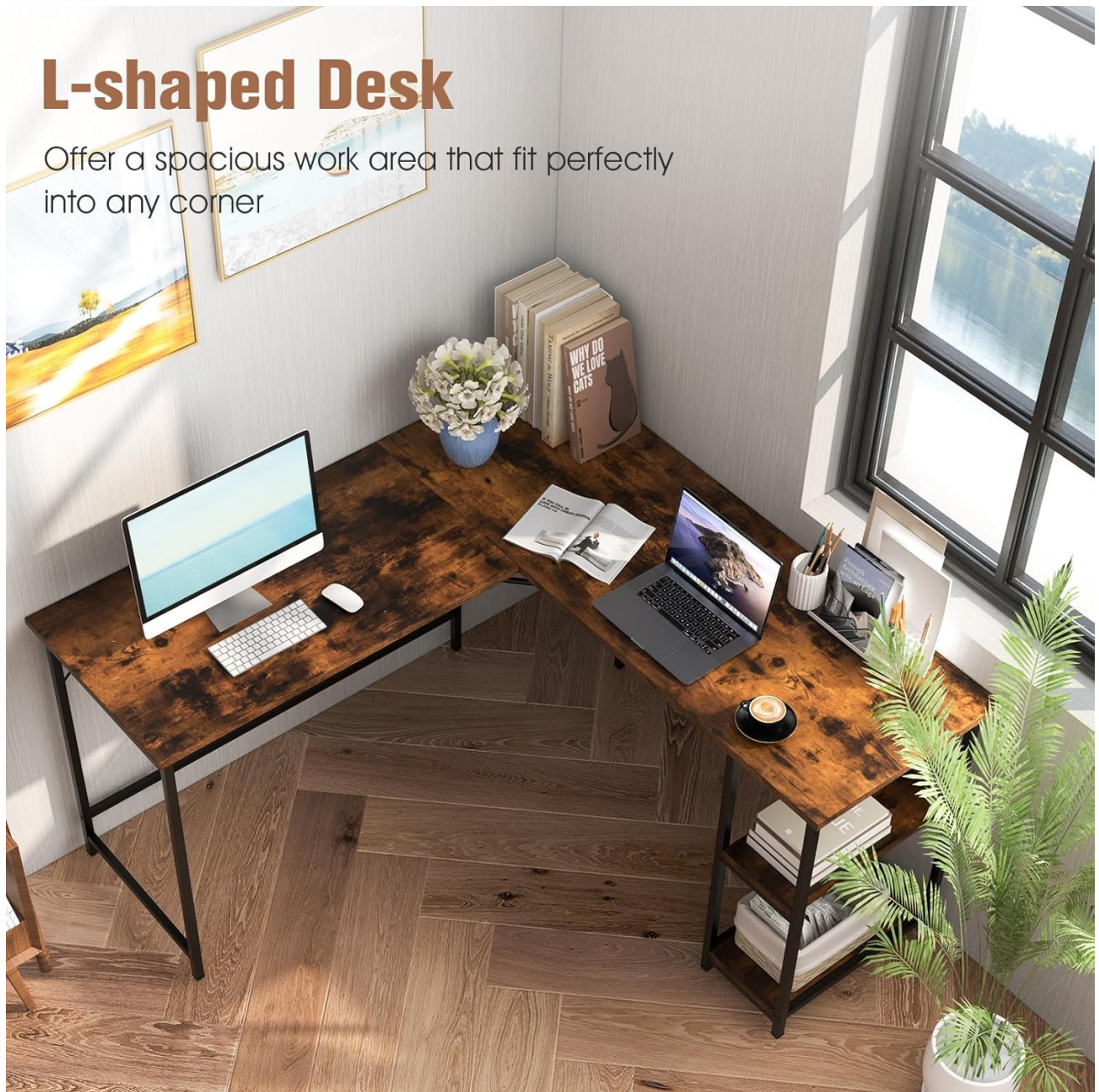
Figure 3: Detail of the desk's sturdy metal frame, highlighting the robust construction that provides stable and reliable support.

Offer a spacious work area that fit perfectly into any corner