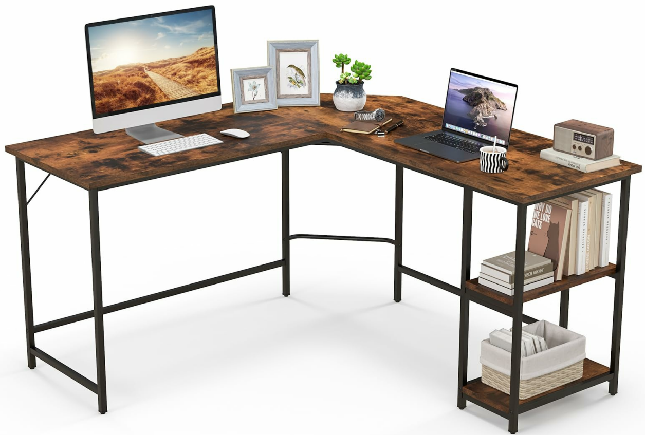
Figure 1: Overall view of the GIANTEX L-shaped Corner Desk, showcasing its design and functionality in a typical room setup.