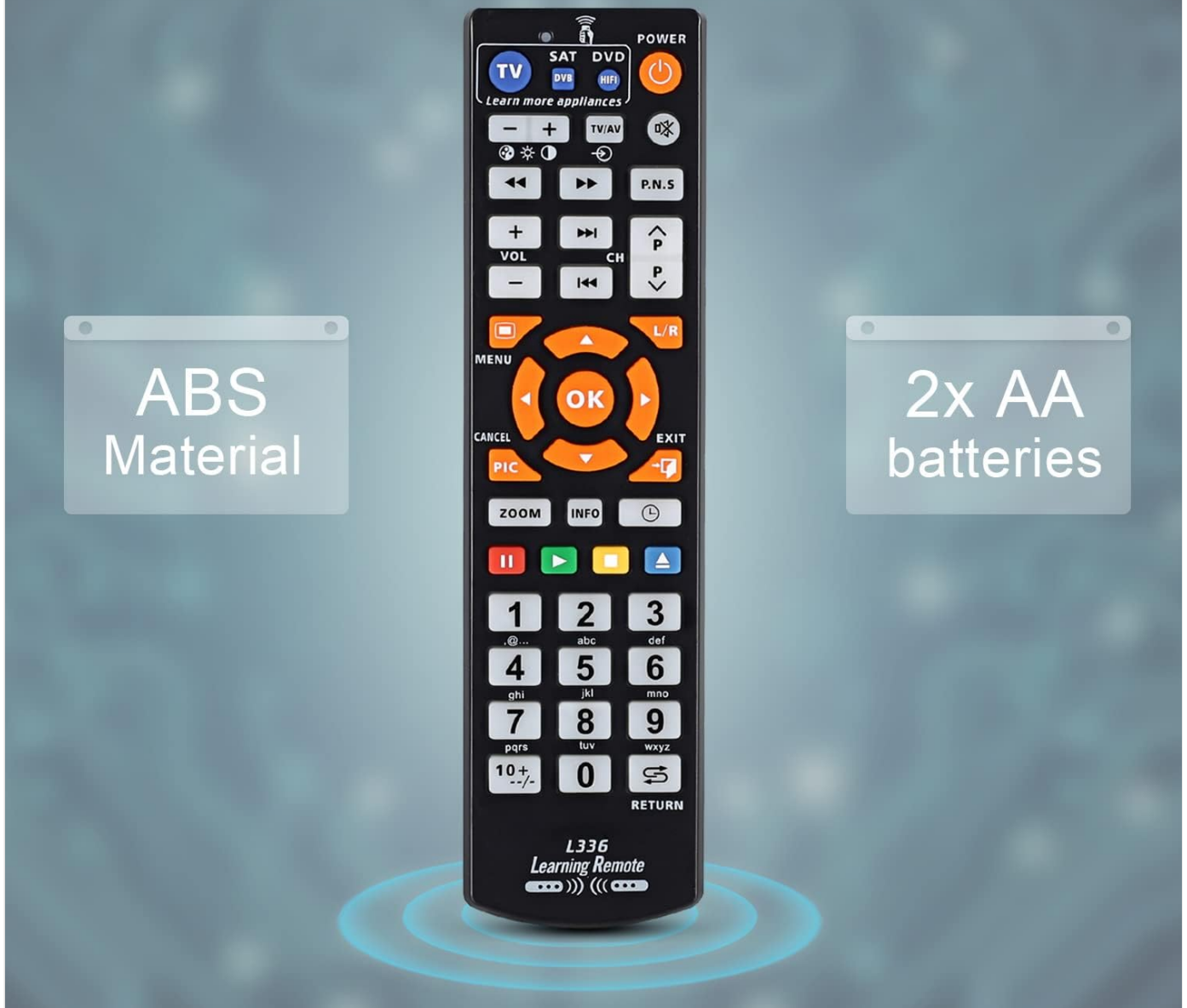
Figure 2: The L336 remote control, showing its construction from ABS material and the requirement for two AA batteries.