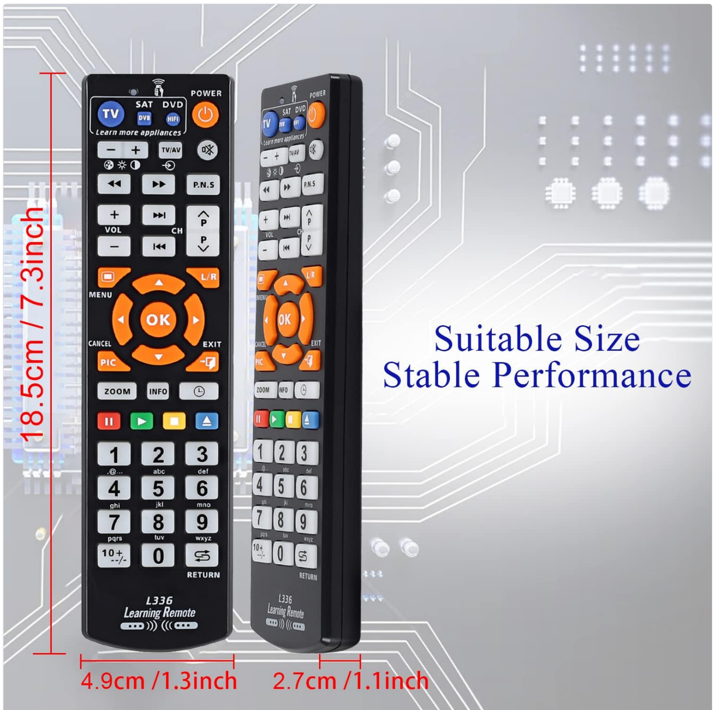
Figure 5: Dimensions of the L336 remote control for reference.