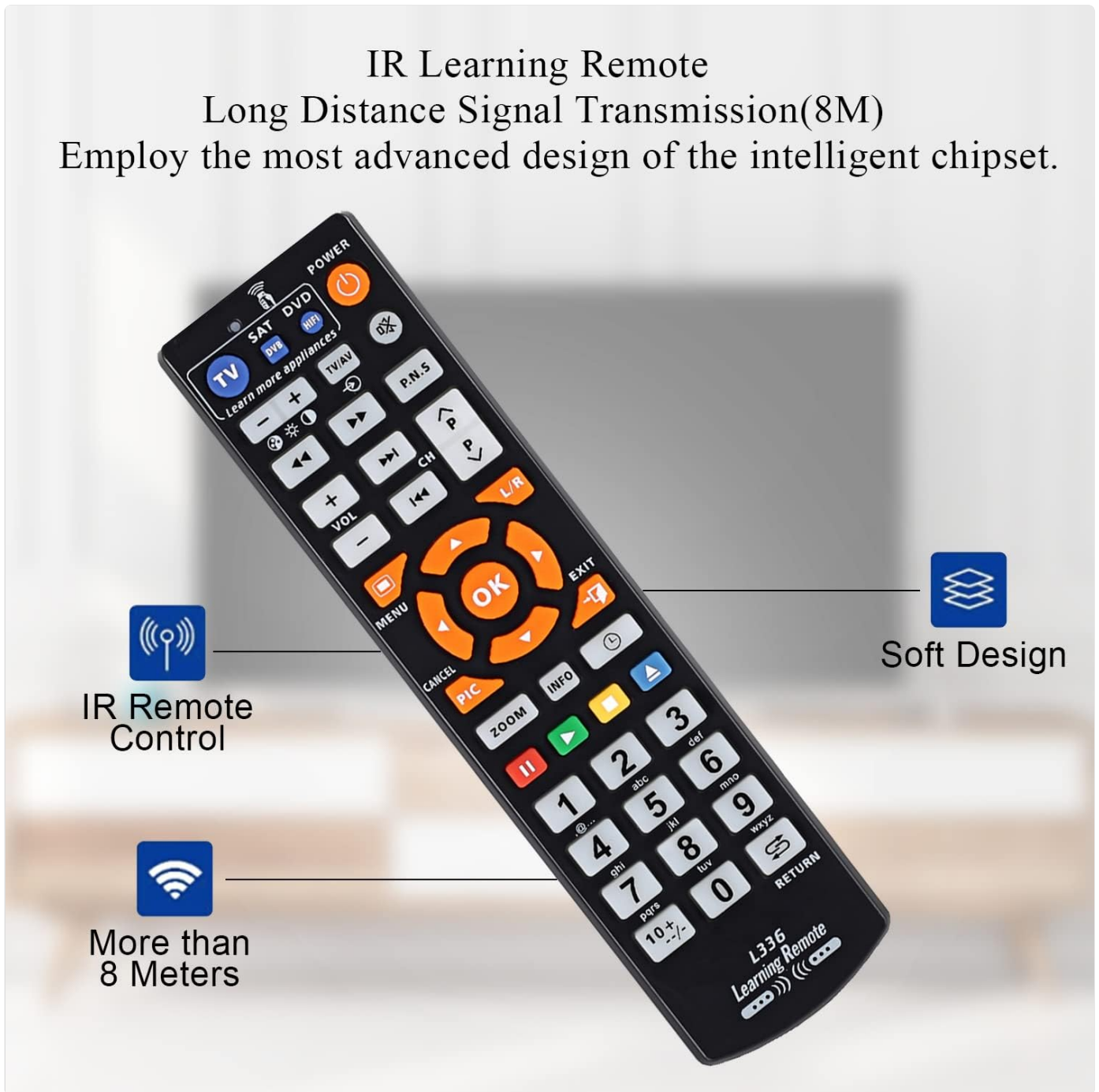
Figure 4: Key features of the L336 remote, including its IR capability, 8-meter signal range, intelligent chipset, and ergonomic design.