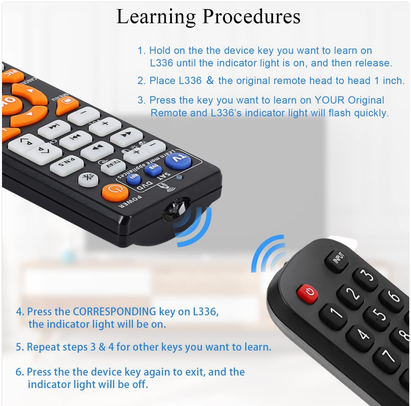
Figure 3: Visual guide for the remote control learning process, demonstrating how to position the L336 and an original remote.