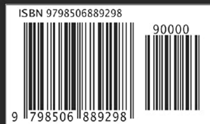
Image: Back cover of the AirTags User Guide, showing publication details and ISBN barcode.