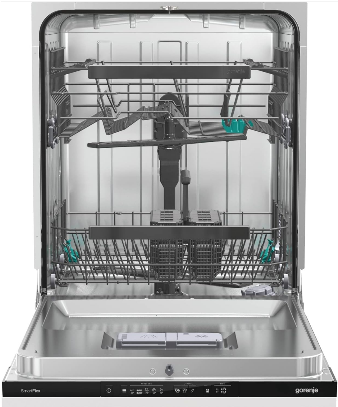
Image Description: This image shows the interior of the Gorenje GV651D60 dishwasher with its racks pulled out, ready for loading. The interior is stainless steel.