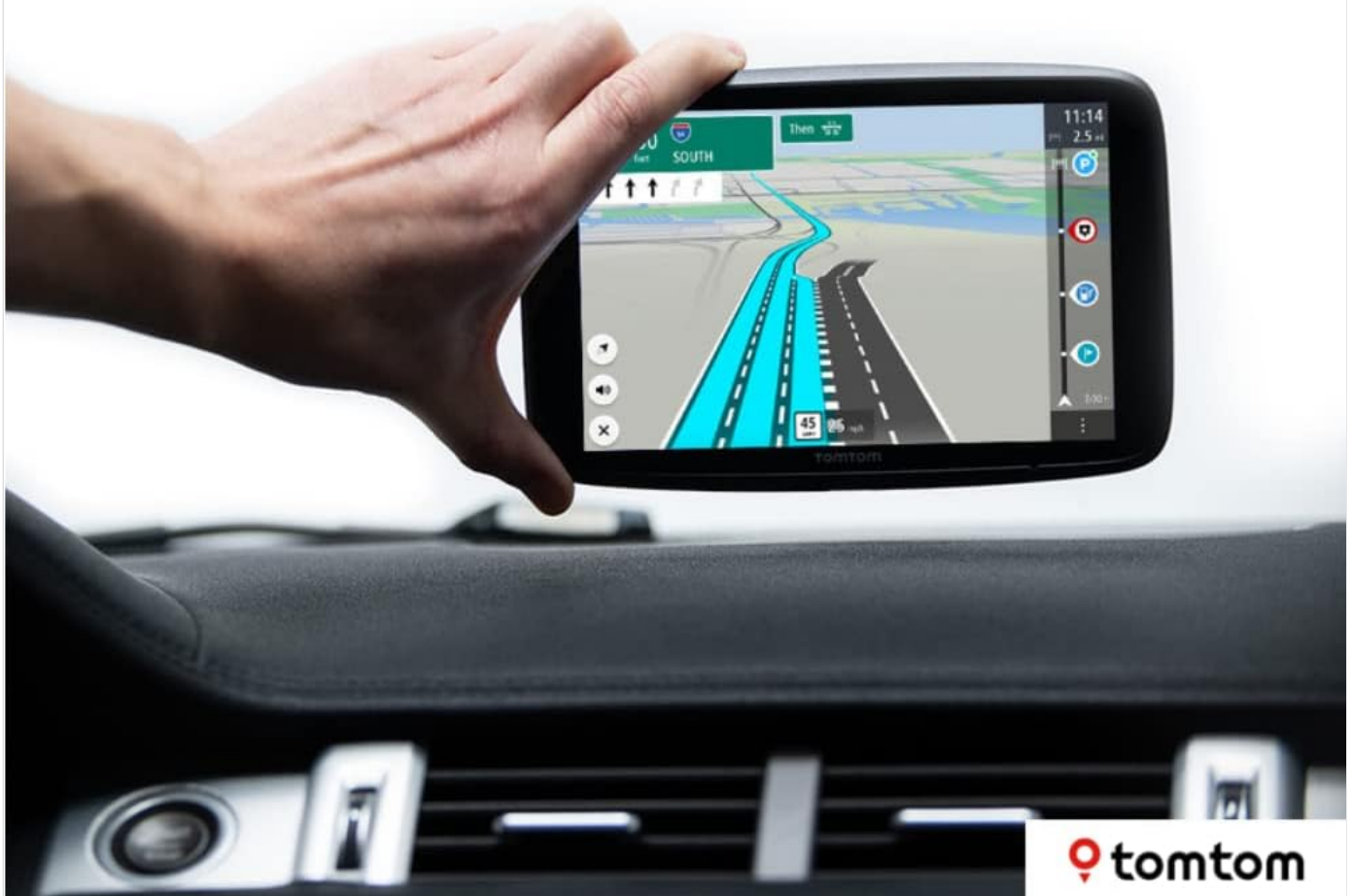
Image: A hand demonstrating the highly responsive touchscreen for smooth swiping and zooming on the TomTom GO Discover.

Simple and distortion-free menu navigation.