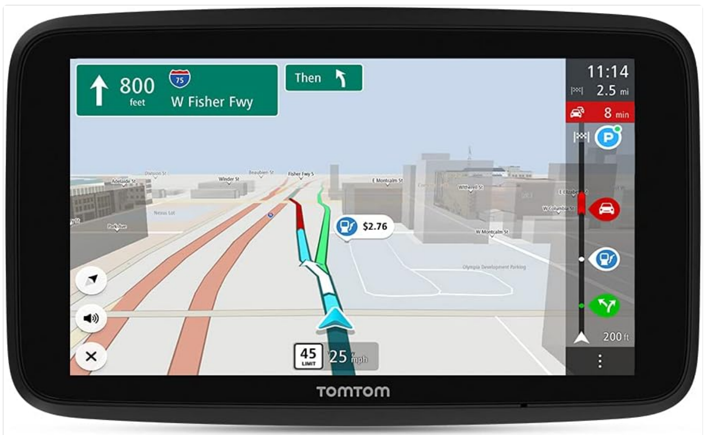
Image: The TomTom GO Discover 7" GPS device displaying a navigation route.

The TomTom GO Discover 7" GPS Navigation Device is designed to provide powerful, reliable, and effortless navigation. Equipped with TomTom's advanced technology, it offers real-time traffic updates, world maps, and a suite of services including fuel pricing, parking availability, and speed camera alerts. This manual provides essential information for setting up, operating, maintaining, and troubleshooting your device to ensure a smooth and comfortable driving experience.