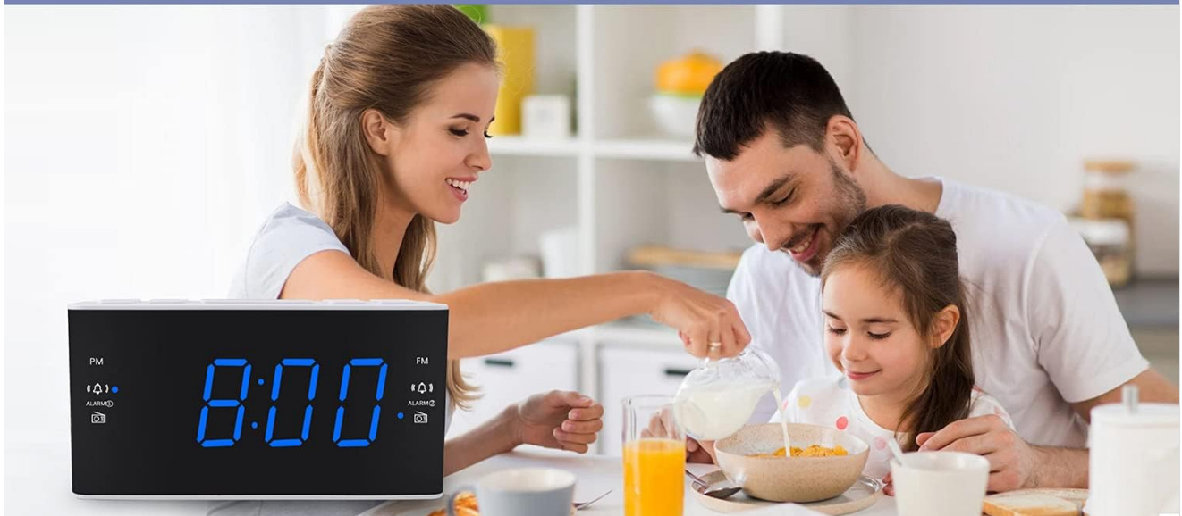
Image: Visual representation of the dual alarm feature, showing the clock used for different wake-up scenarios.

Dual alarms and 2 ringtones for better wake up and remind