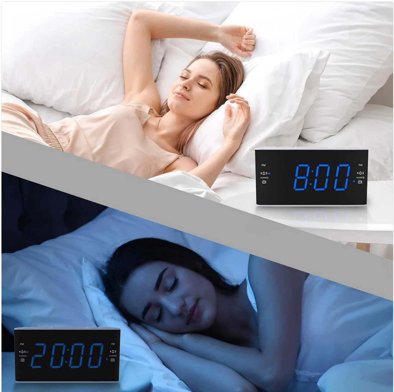
Image: Comparison of the clock display at high and low brightness settings, demonstrating the dimmer function.