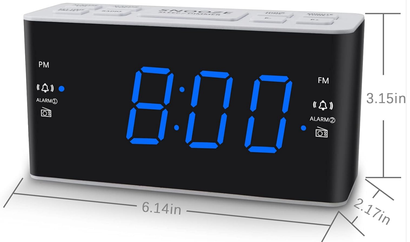
Image: Product dimensions of the Ratakee Digital Alarm Clock Radio.

Packed in: Clock*1 Instruction*1 Warranty*1