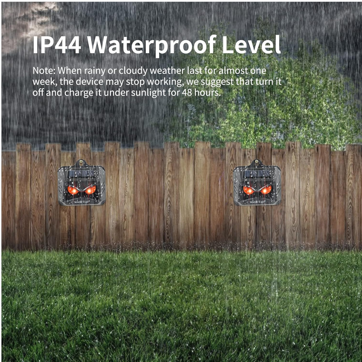
Image 6.1: The device is designed to withstand rain with its IP44 waterproof rating.

Note: When rainy or cloudy weather last for almost one week, the device may stop working, we suggest that turn it off and charge it under sunlight for 48 hours.