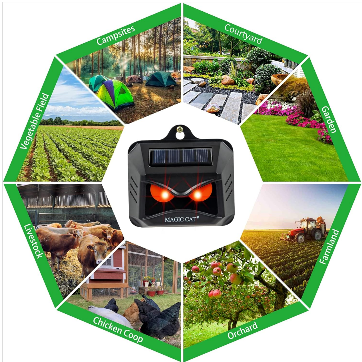
Image 4.3: The repeller can be used in diverse outdoor environments.