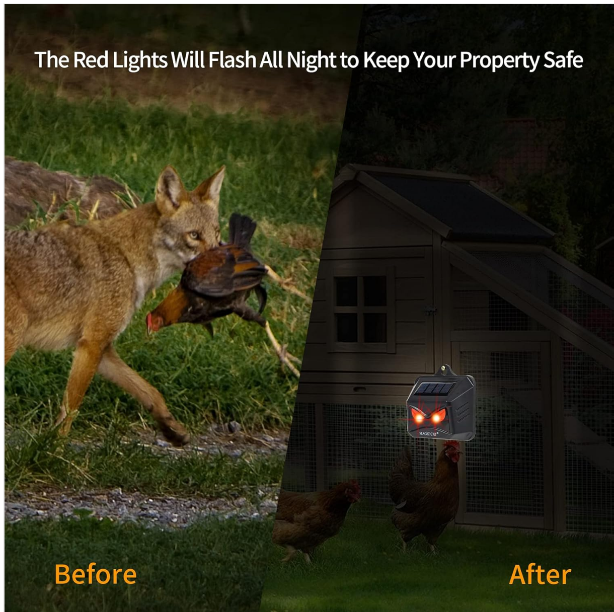
Image 5.1: The repeller aims to protect property from nocturnal animals.