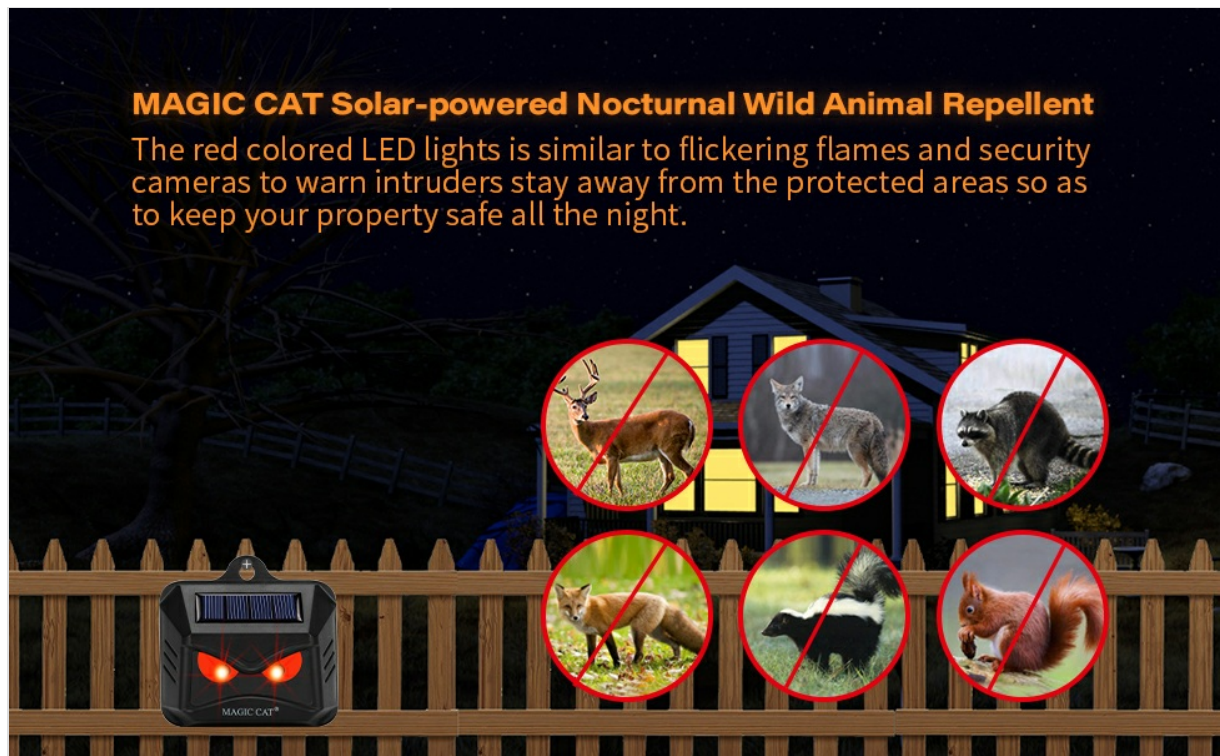
Image 1.1: The MAGIC CAT Solar Animal Repeller charges during the day and activates its red lights at night to deter animals.