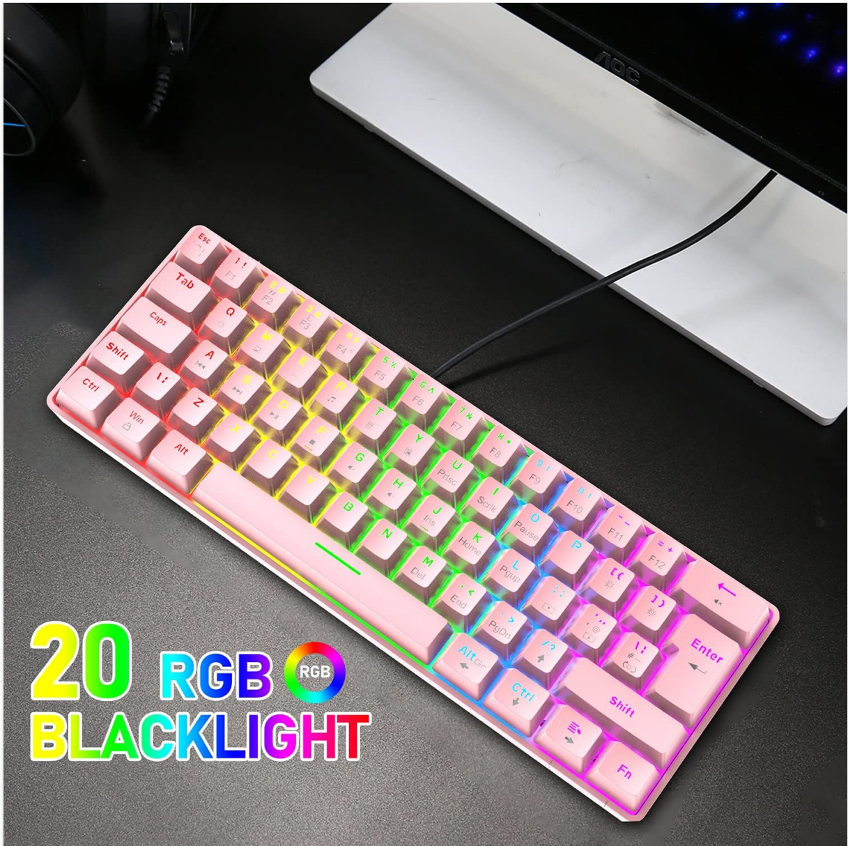
Image: The XINMENG T60-01 keyboard illuminated with RGB backlighting, highlighting its visual appeal.