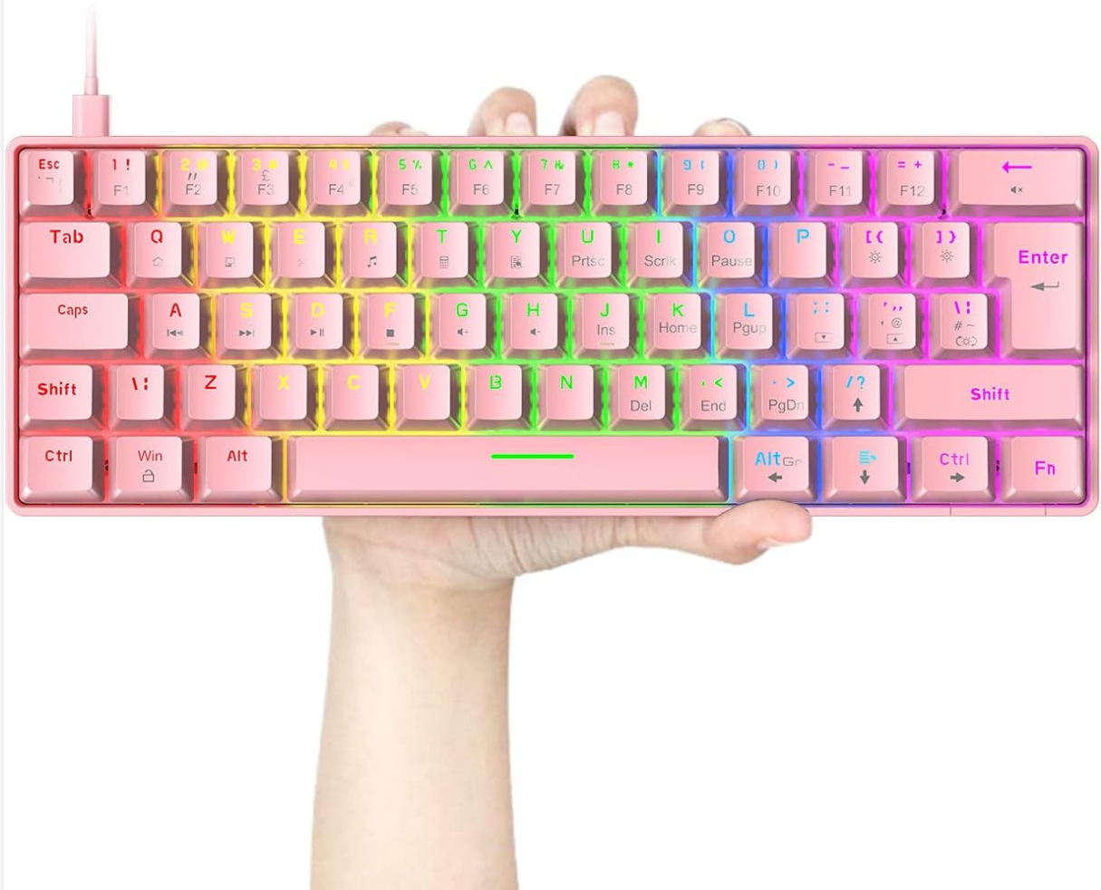
Image: The XINMENG T60-01 60% Mechanical Gaming Keyboard, demonstrating its ultra-compact design.