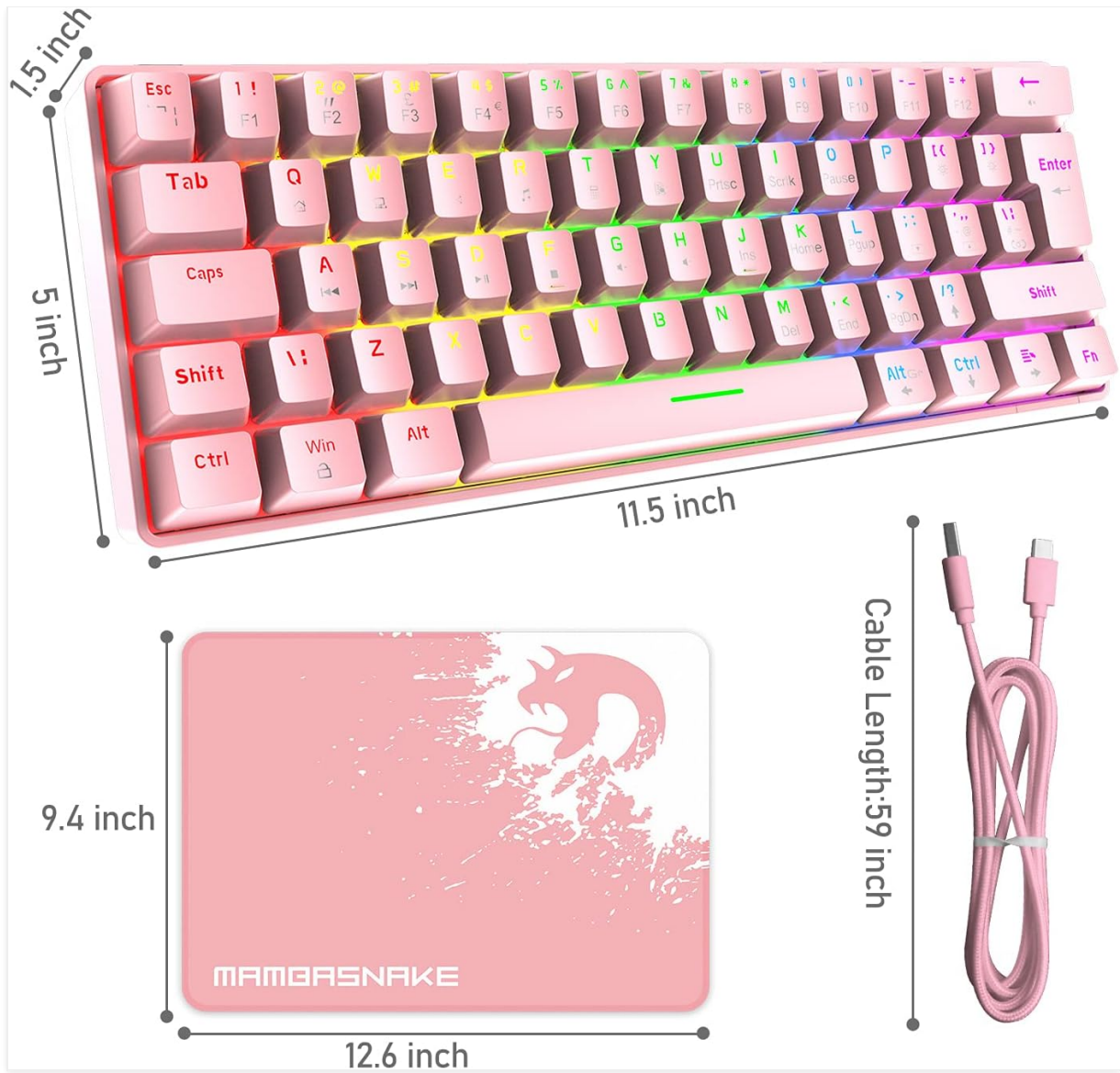
Image: A visual representation of the keyboard and mouse pad dimensions, including cable length.