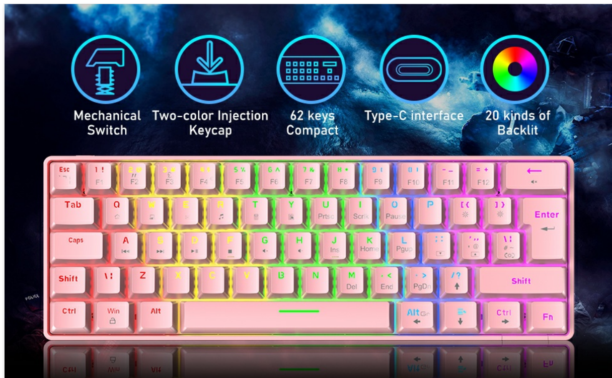
Image: Visual guide to the multimedia shortcut keys accessible via the Fn key on the XINMENG T60-01 keyboard.