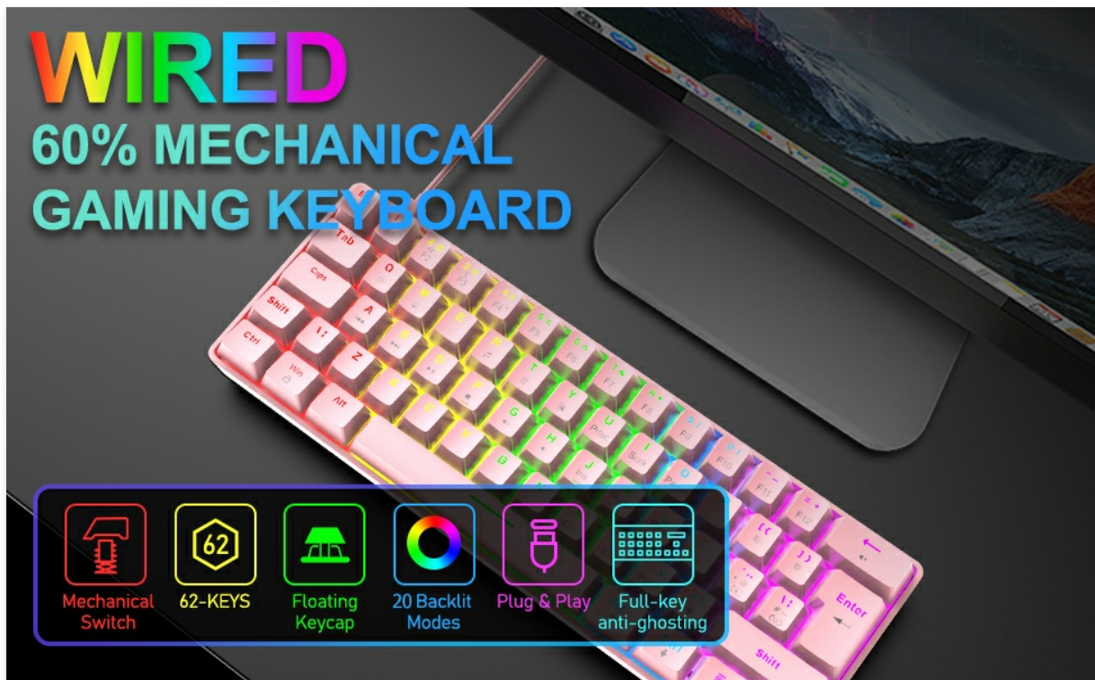
Image: An illustration detailing the characteristics of the blue mechanical switch, emphasizing its tactile feedback and audible click.