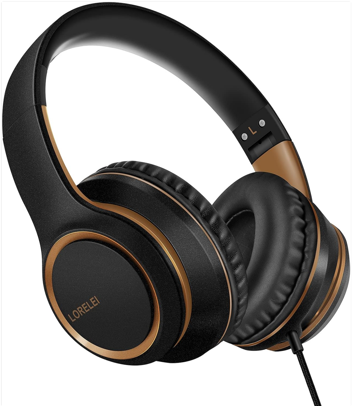
Image: LORELEI X8 Over-Ear Wired Headphones in Black-Gold color. The headphones feature a black headband and earcups with gold accents, connected by a black braided cable.